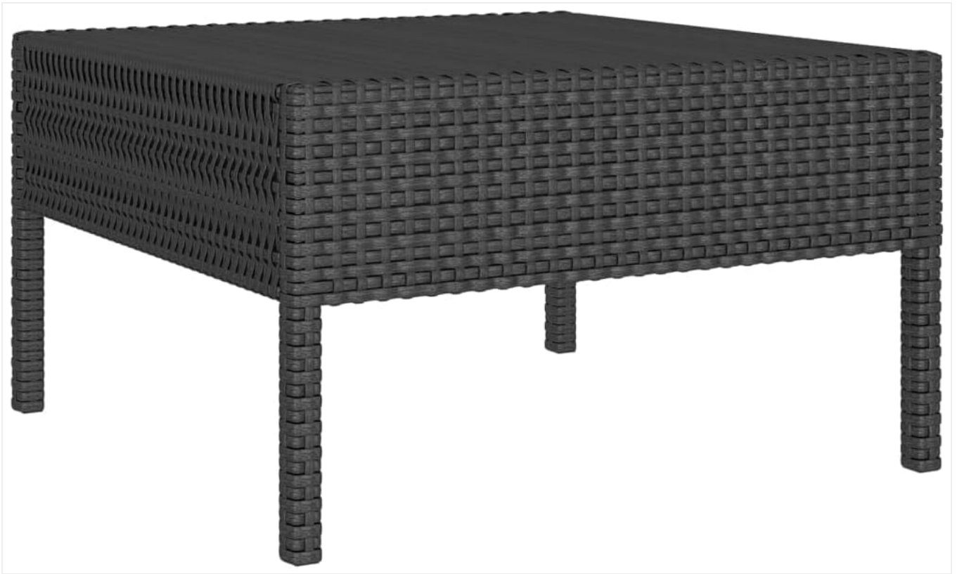
Image: The versatile footrest, which can also serve as a table.