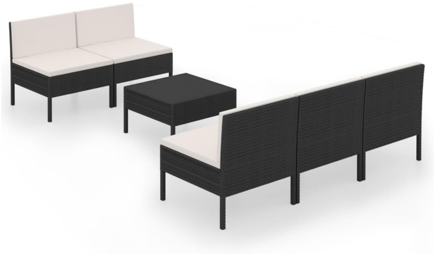
Image: The complete vidaXL Garden Lounge Set, showcasing its modular design with multiple sofa sections and a central table.