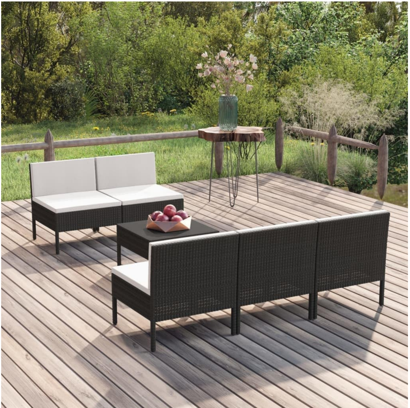
Image: The lounge set arranged on a patio, demonstrating its use in an outdoor environment.