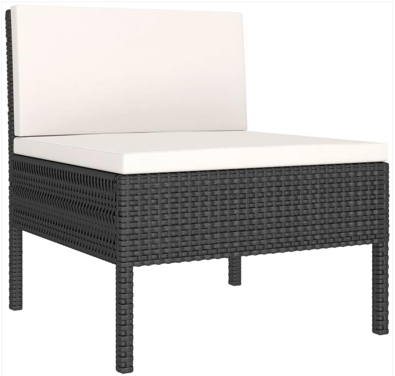
Image: A single middle sofa section with cushion.