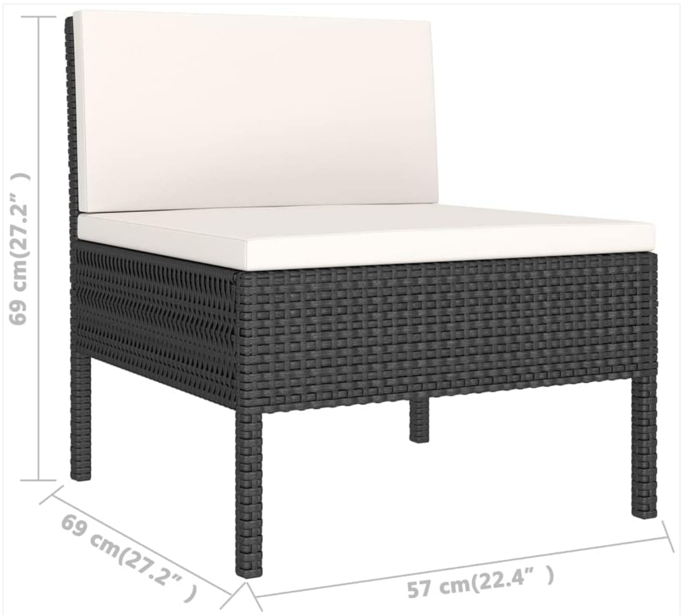
Image: Detailed dimensions for a middle sofa section.