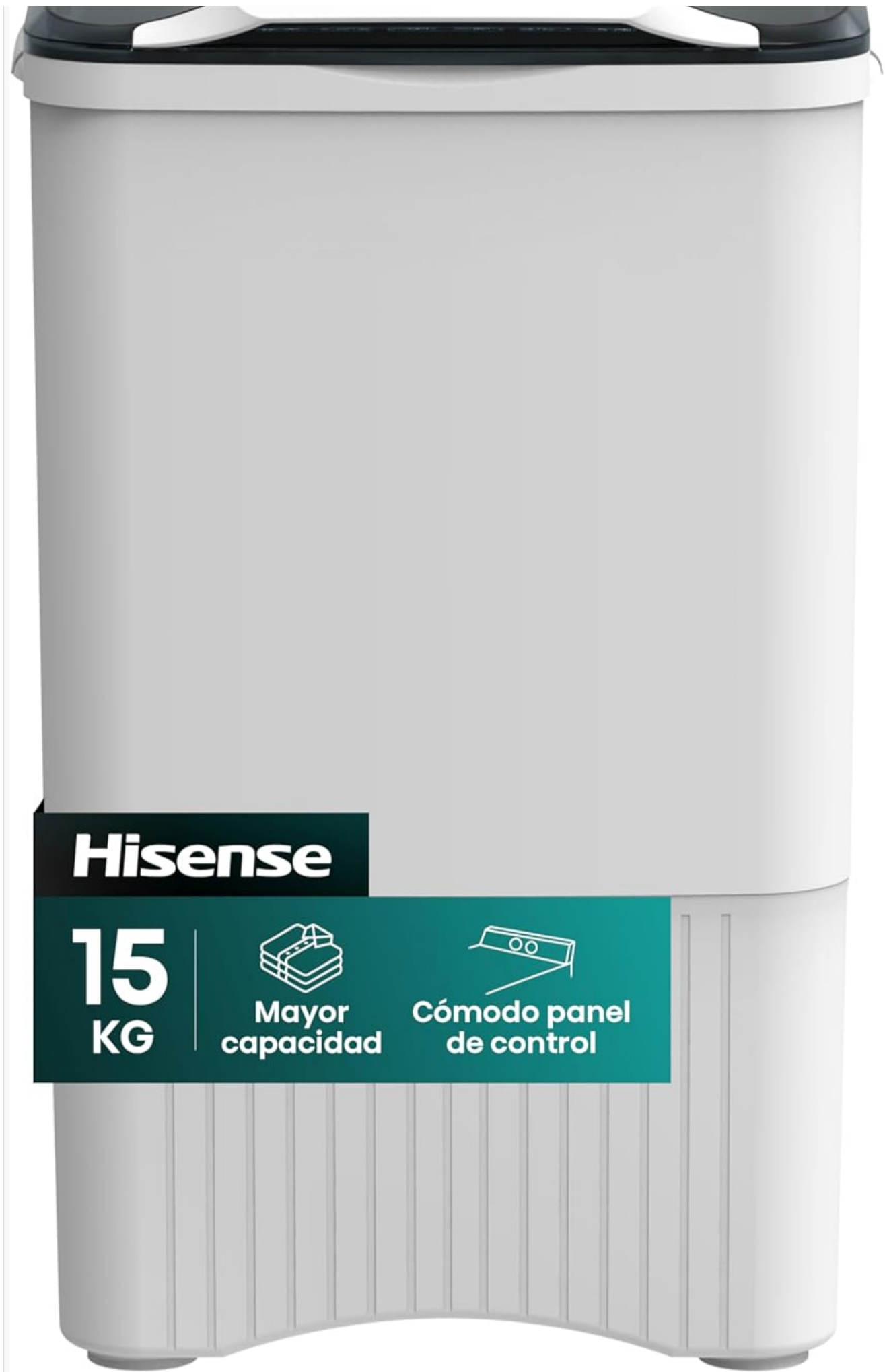
Figure 3.1: Front view of the Hisense WSFF1501 washing machine, showing its compact design and top-loading access.