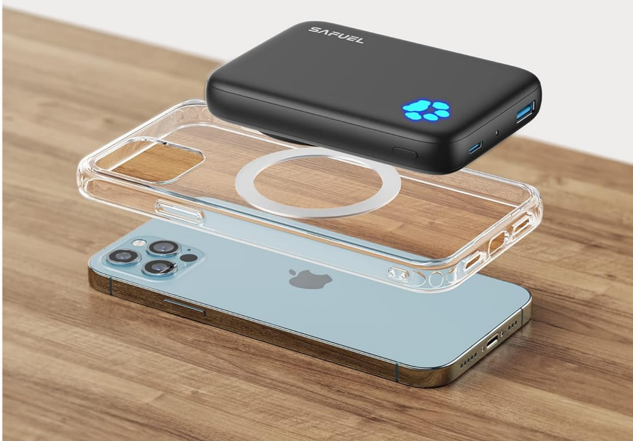
Figure 5.2: Compatibility guide showing that magnetic charging is effective with MagSafe cases but not with standard non-MagSafe cases.