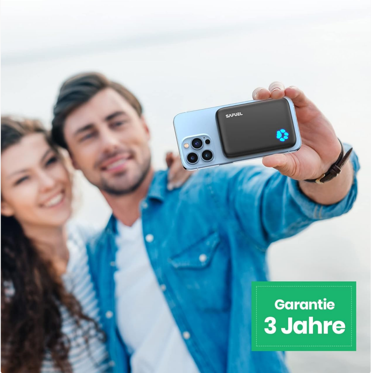
Figure 9.1: The SAFUEL power bank in a real-world usage scenario, highlighting its portability and the included 3-year warranty.

For warranty claims, technical support, or any questions regarding your product, please contact SAFUEL customer service through the retailer's platform or the contact information provided on the product packaging.