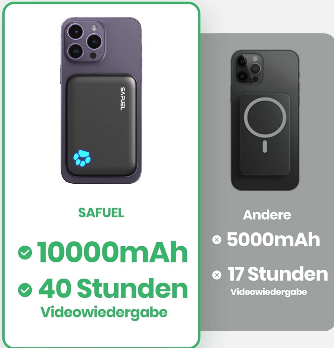
Figure 8.1: Capacity comparison illustrating the extended video playback time provided by the 10000mAh SAFUEL power bank.