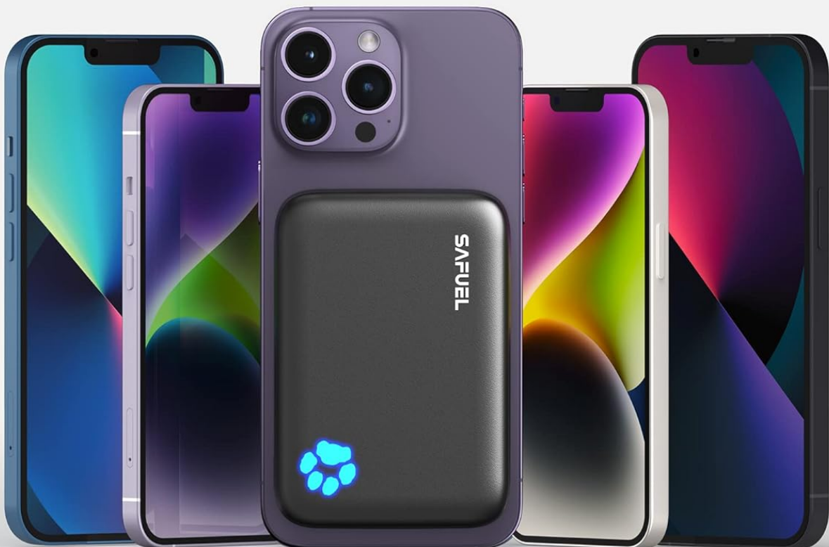
Figure 8.2: The SAFUEL power bank demonstrating magnetic compatibility with various iPhone 12, 13, and 14 series models.

*funktioniert nur mit iPhone 14 und iPhone 13 und iPhone 12 Serie