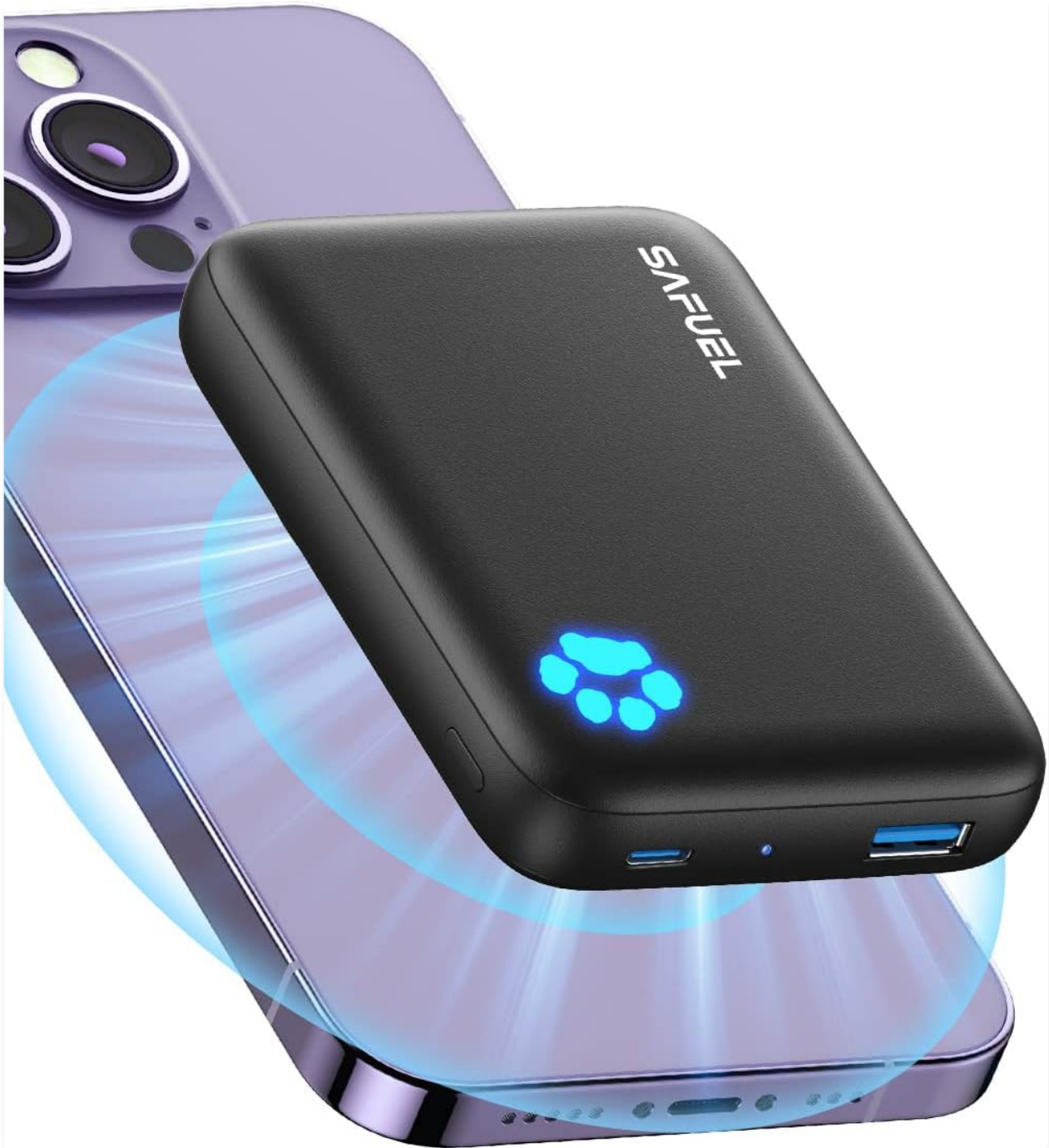
Figure 3.1: SAFUEL 10000mAh Magnetic Wireless Power Bank in use, demonstrating its wireless charging capability with a smartphone.