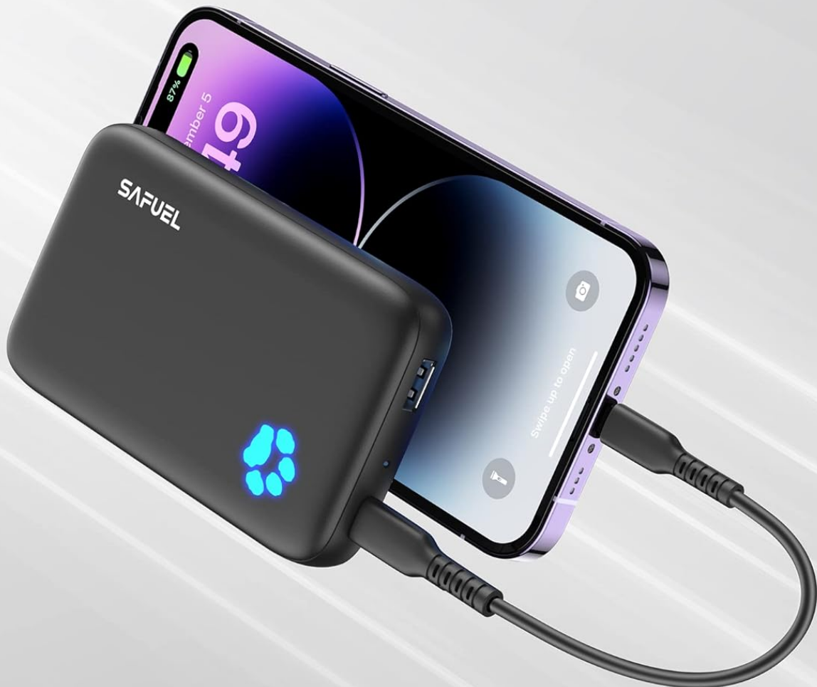
Figure 5.3: The SAFUEL power bank providing 20W Power Delivery fast charging to an iPhone via a USB-C cable.