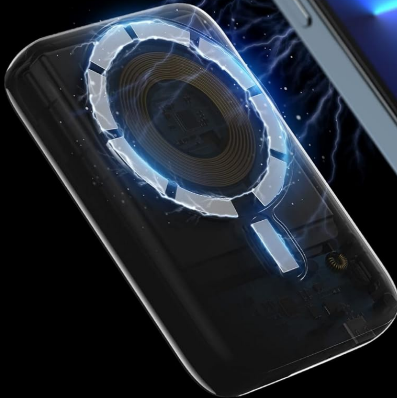
Figure 5.1: The strong magnetic connection of the SAFUEL power bank to a smartphone, highlighting the internal magnetic coil for secure wireless charging.