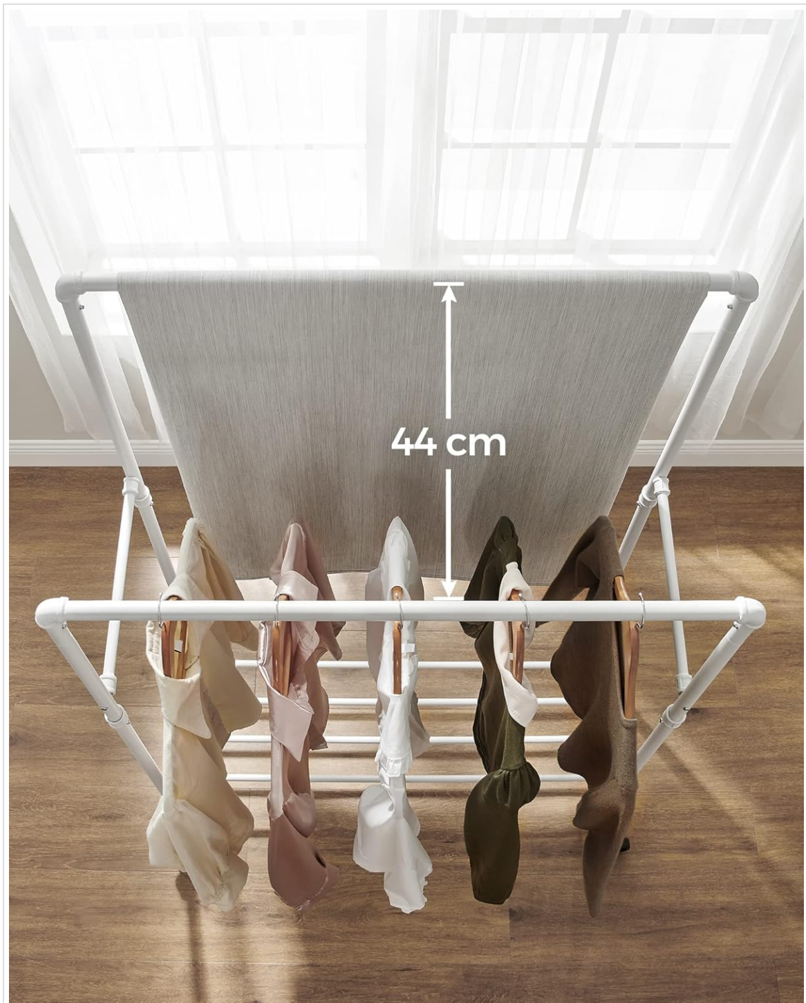
Image 4.1: The 44 cm spacing between rods provides ample room for garments.

Utilize the double hanging rods to organize your clothing. The distance between the bars is approximately 44 cm, allowing for easy access and preventing clothes from touching the lower shelf.