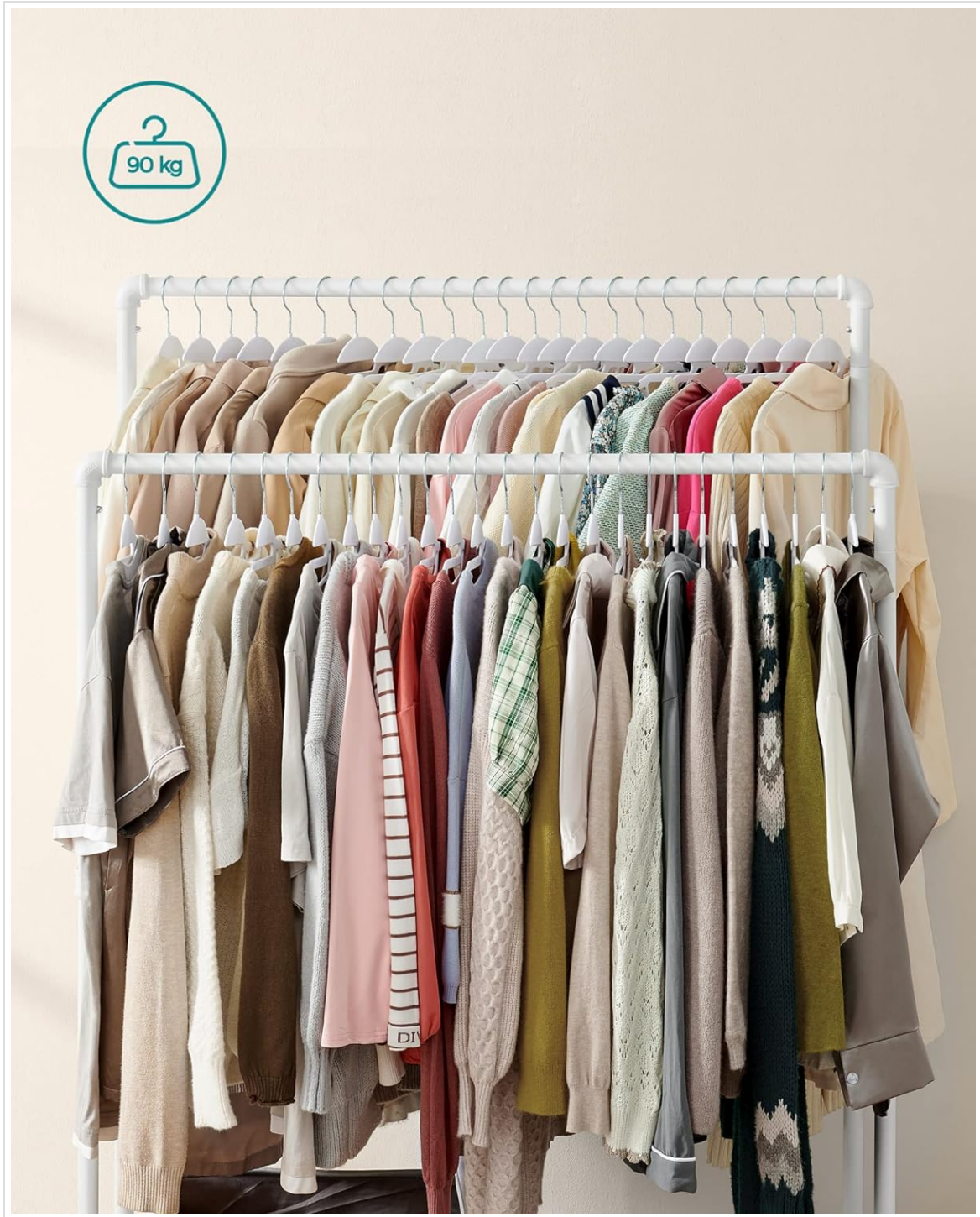
Image 2.1: The double hanging rods provide extensive storage for various clothing items.

Please ensure all parts are present before beginning assembly. Refer to the included parts list in your packaging for detailed identification.