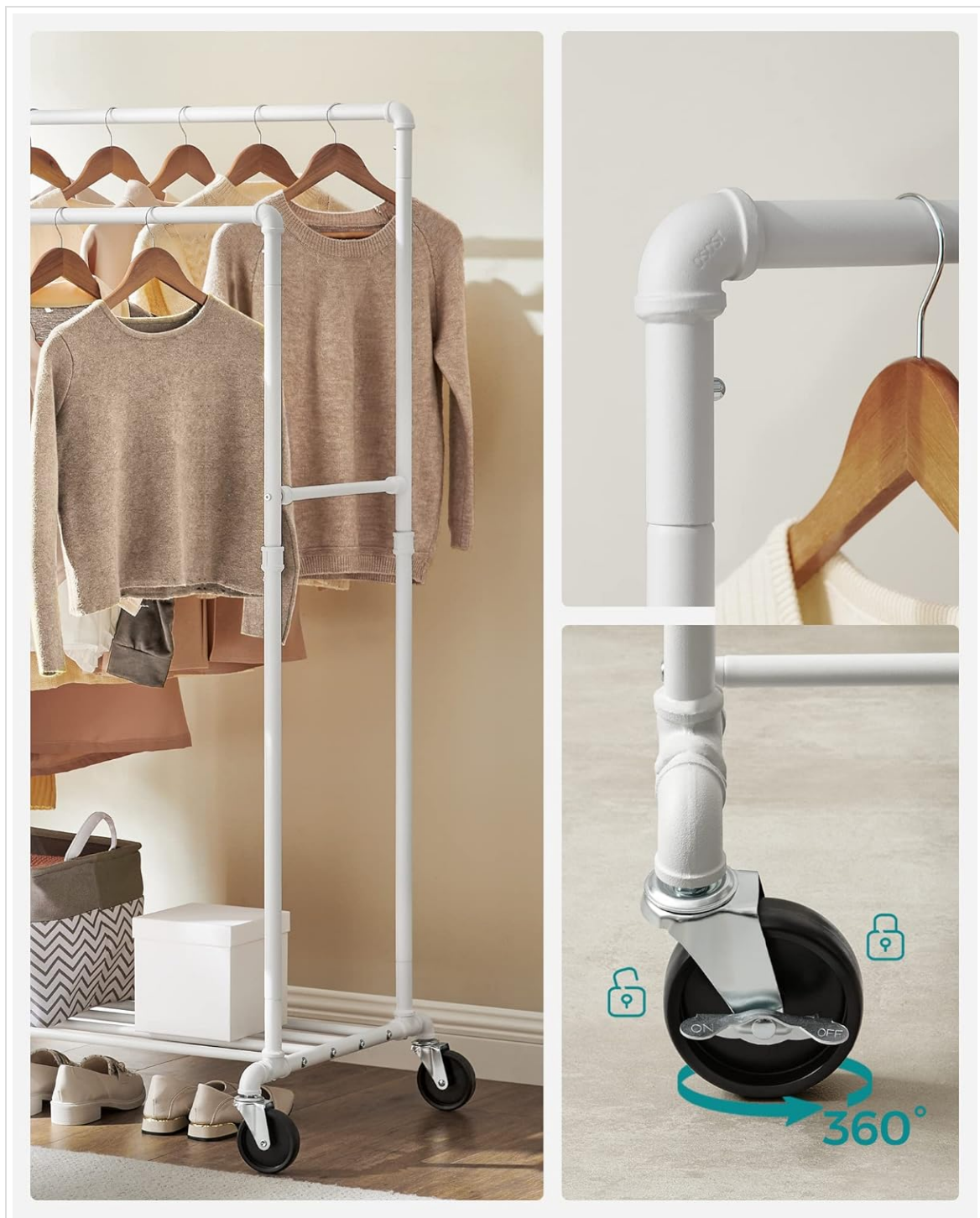
Image 3.1: Detail of the robust pipe connections and a lockable wheel.