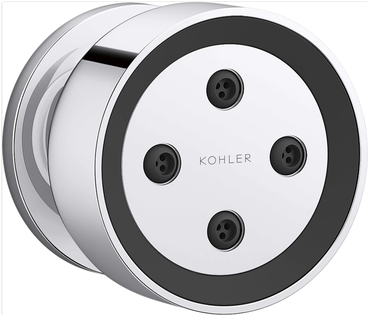
Figure 1: Kohler Statement Round Deep Massage Body Spray in Polished Chrome.