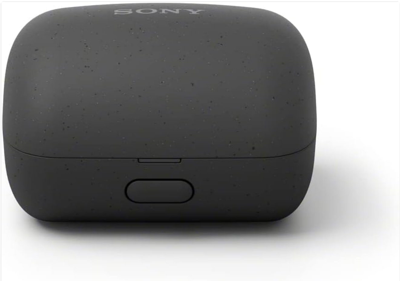
Figure 2: Sony LinkBuds securely placed within their charging case.