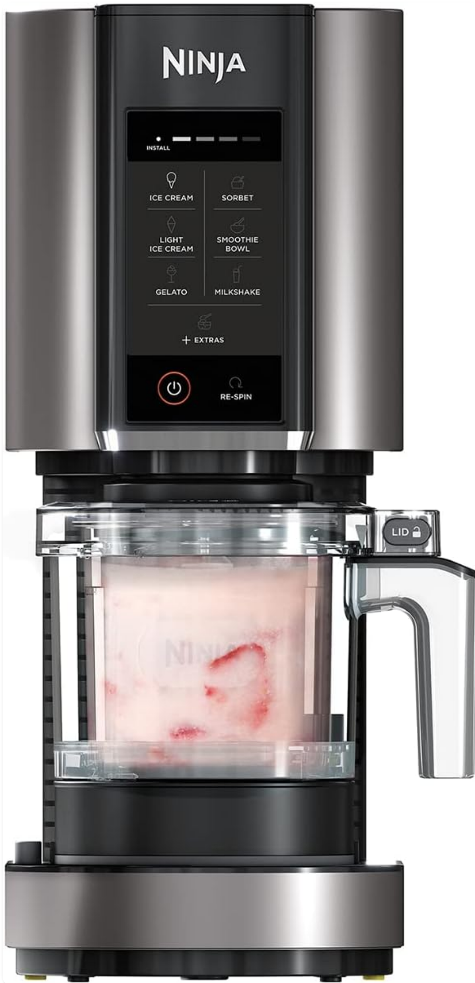
Image: The Ninja CREAMi Ice Cream and Dessert Maker, showcasing its sleek design and a container filled with a frozen dessert base.