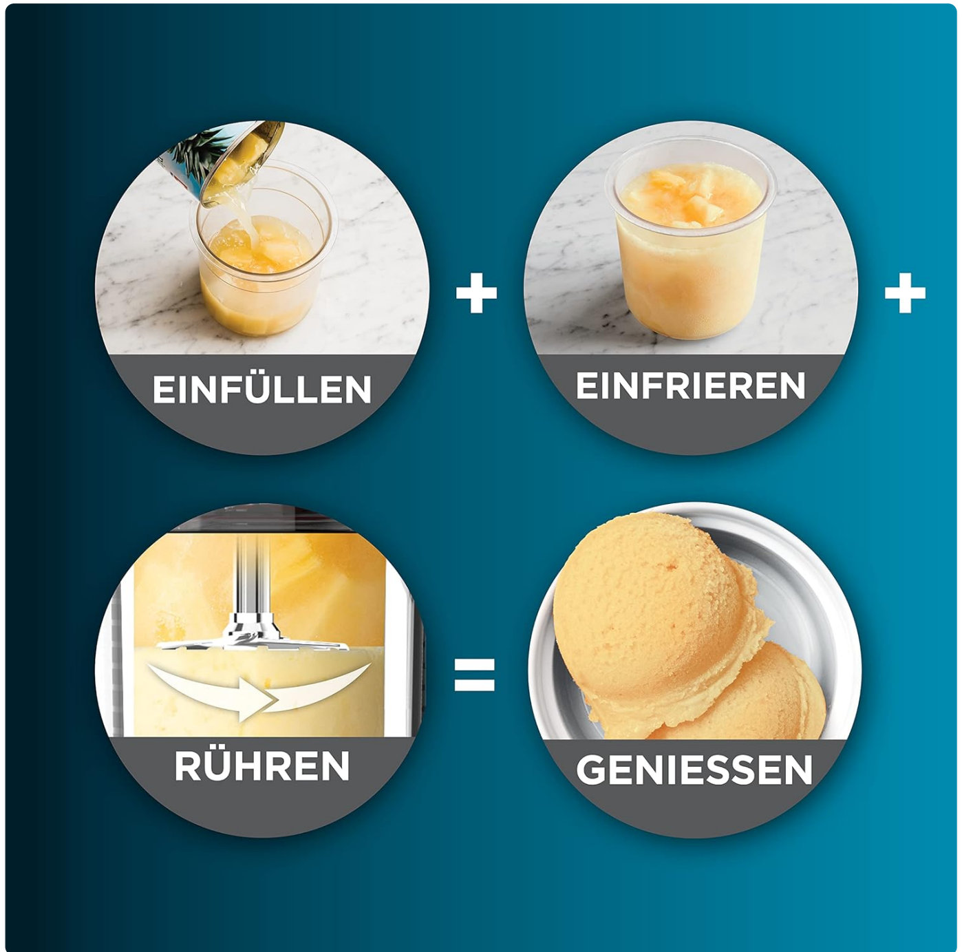
Image: Visual representation of the four-step process: Fill, Freeze, Process, Enjoy.

Prepare your ingredients according to your desired recipe. Pour the mixture into one of the pint containers. Do not fill past the MAX FILL line.