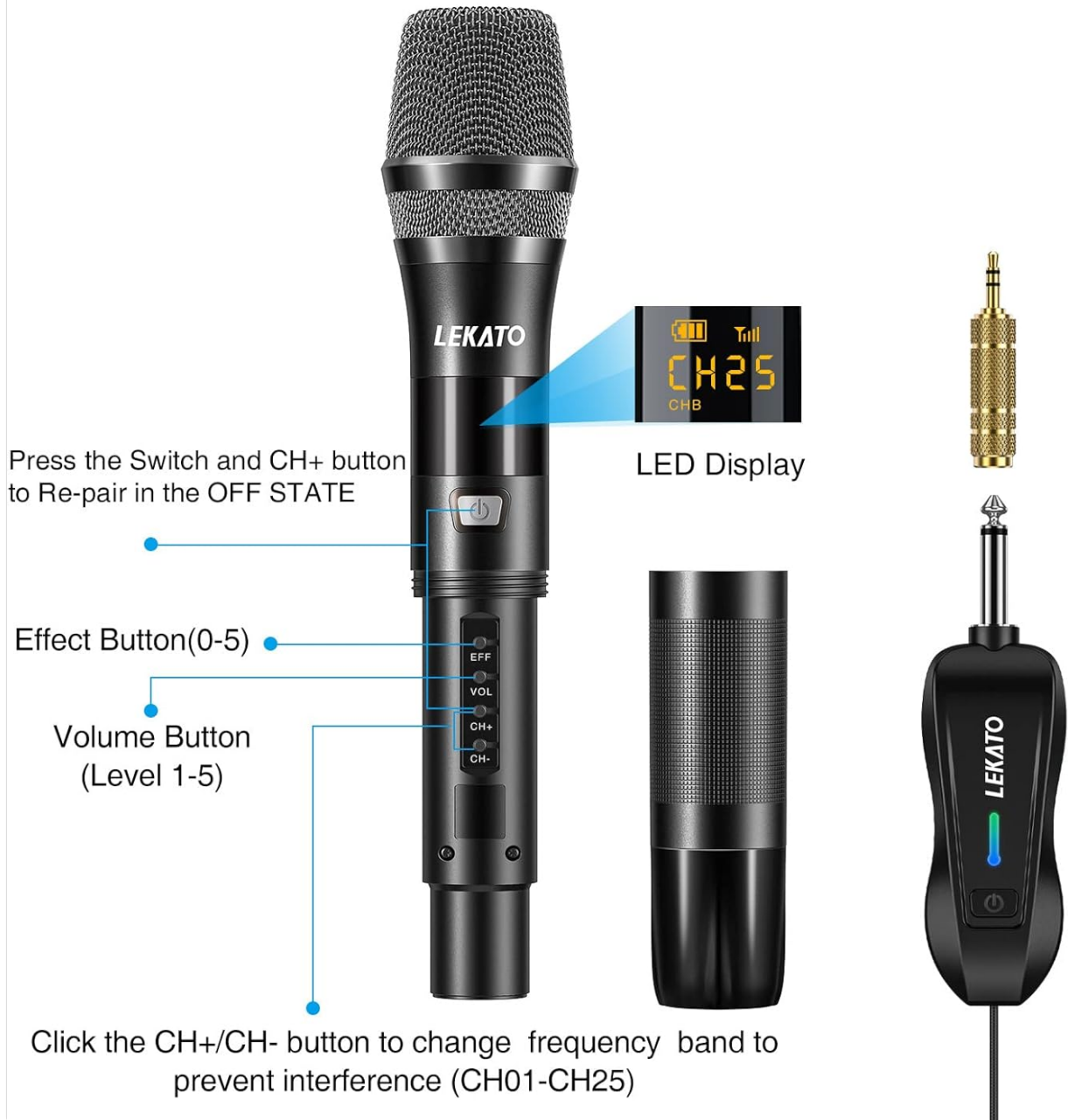
Image: A diagram illustrating the LEKATO wireless microphone, its receiver, and the various connection options for 6.35mm (1/4") and 3.5mm (1/8") microphone interfaces. It highlights compatibility with karaoke machines, powered speakers, amplifiers, and audio interfaces, while indicating incompatibility with Bluetooth speakers, PCs, and phones.