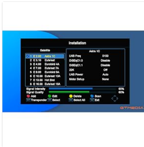
Image: Screenshot of the GTMEDIA V7 HD's installation menu, showing satellite selection options and signal intensity indicators.