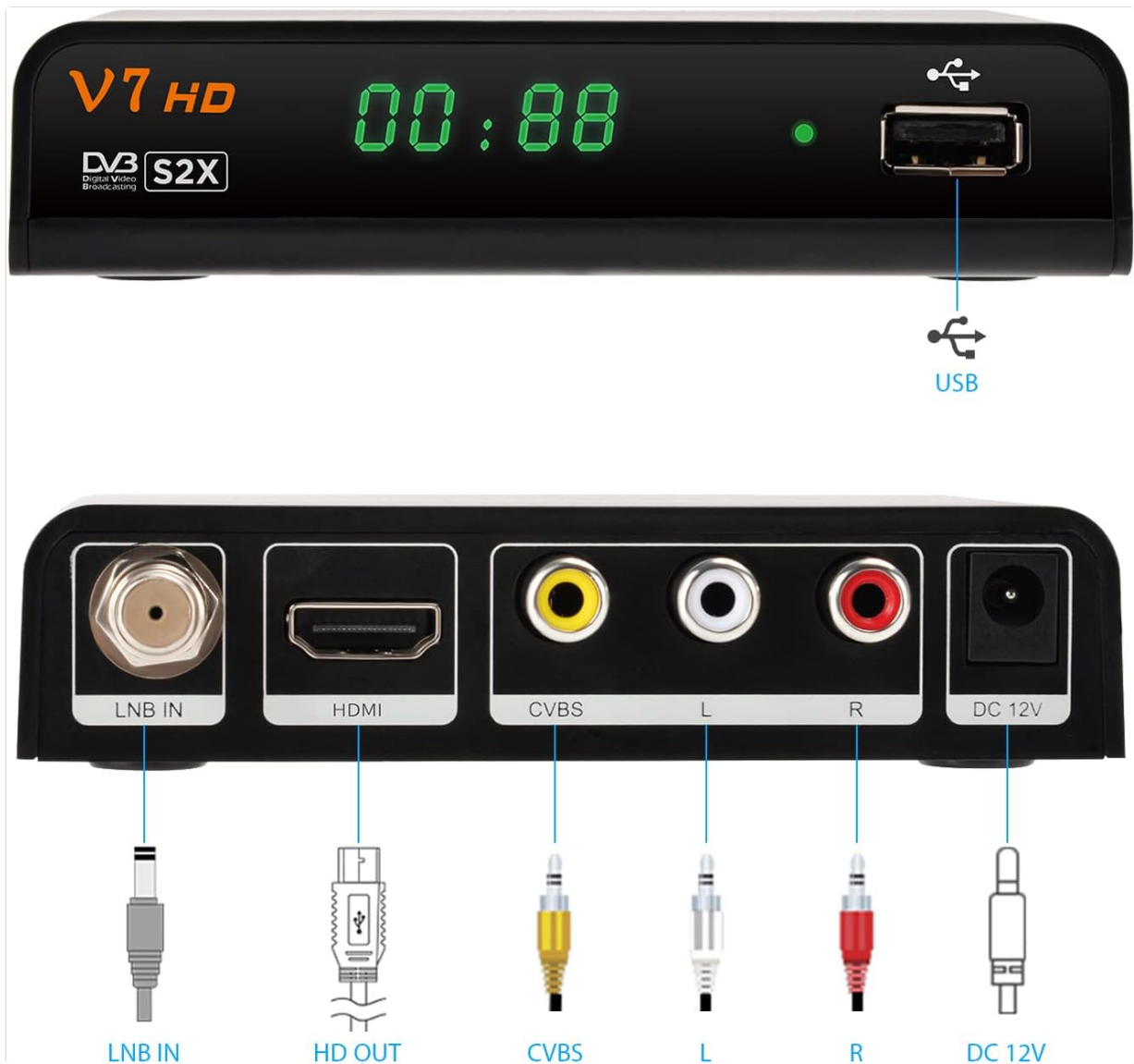
Image: Detailed view of the GTMEDIA V7 HD receiver's rear panel, showing LNB IN, HDMI, CVBS (RCA), and DC 12V power input ports.