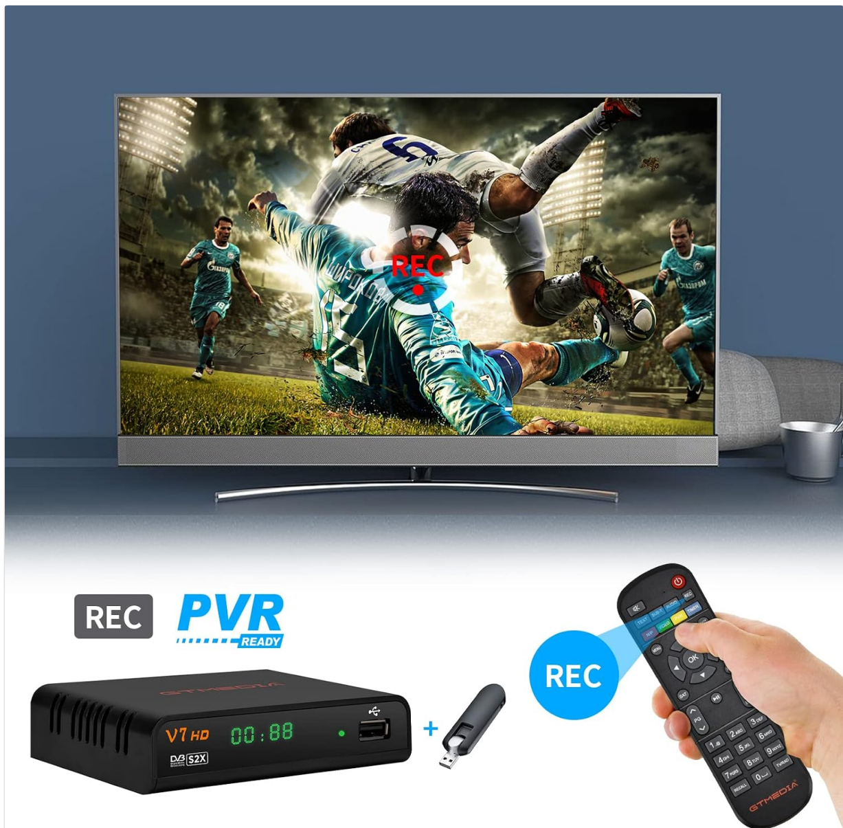
Image: Illustration of the GTMEDIA V7 HD's PVR recording capability, showing the receiver, a USB drive, and the remote control with the 'REC' button highlighted, alongside a TV displaying a recorded program.