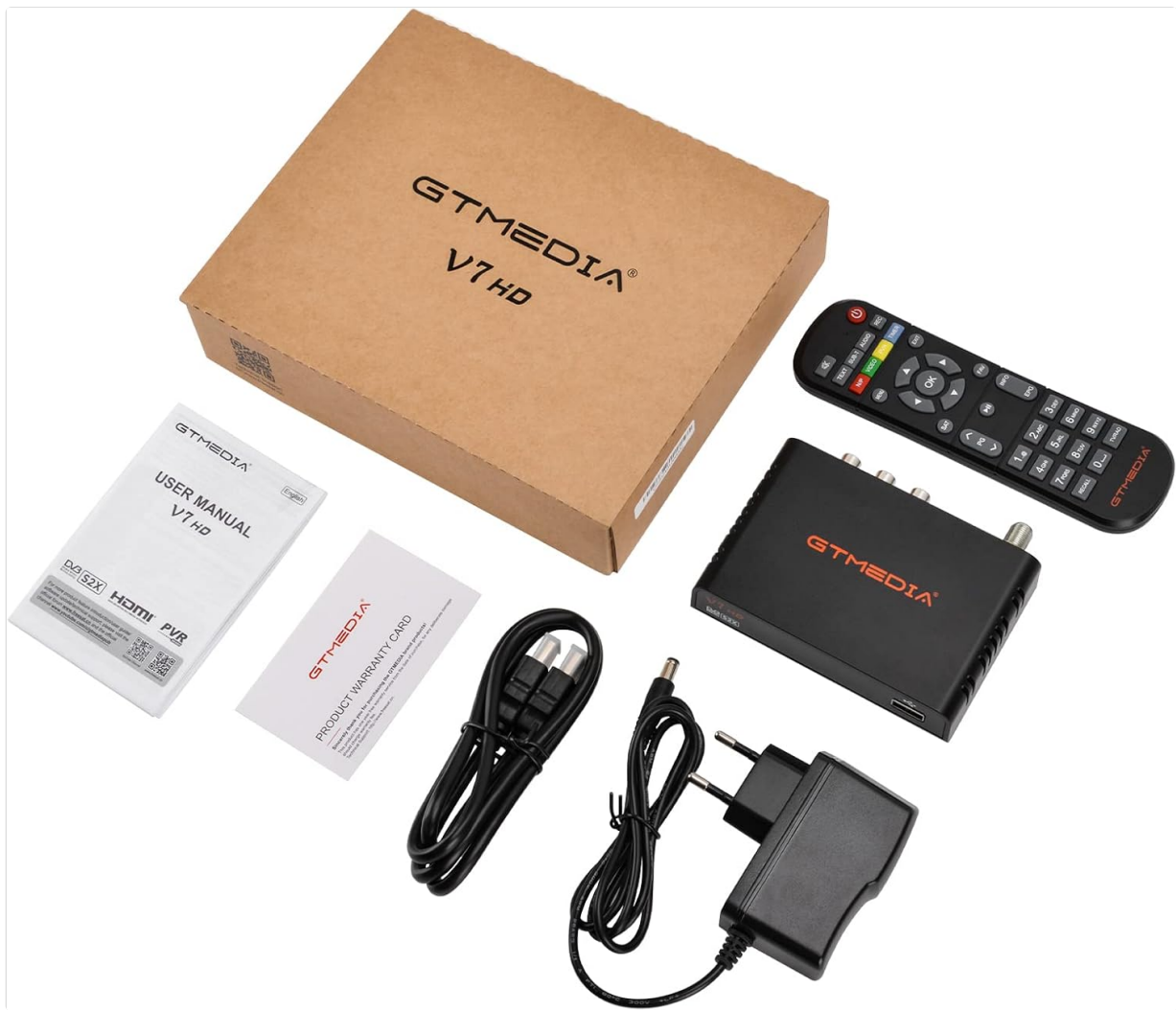
Image: Contents of the GTMEDIA V7 HD package, including the receiver, remote, power adapter, HDMI cable, USB Wi-Fi adapter, user manual, and warranty card.