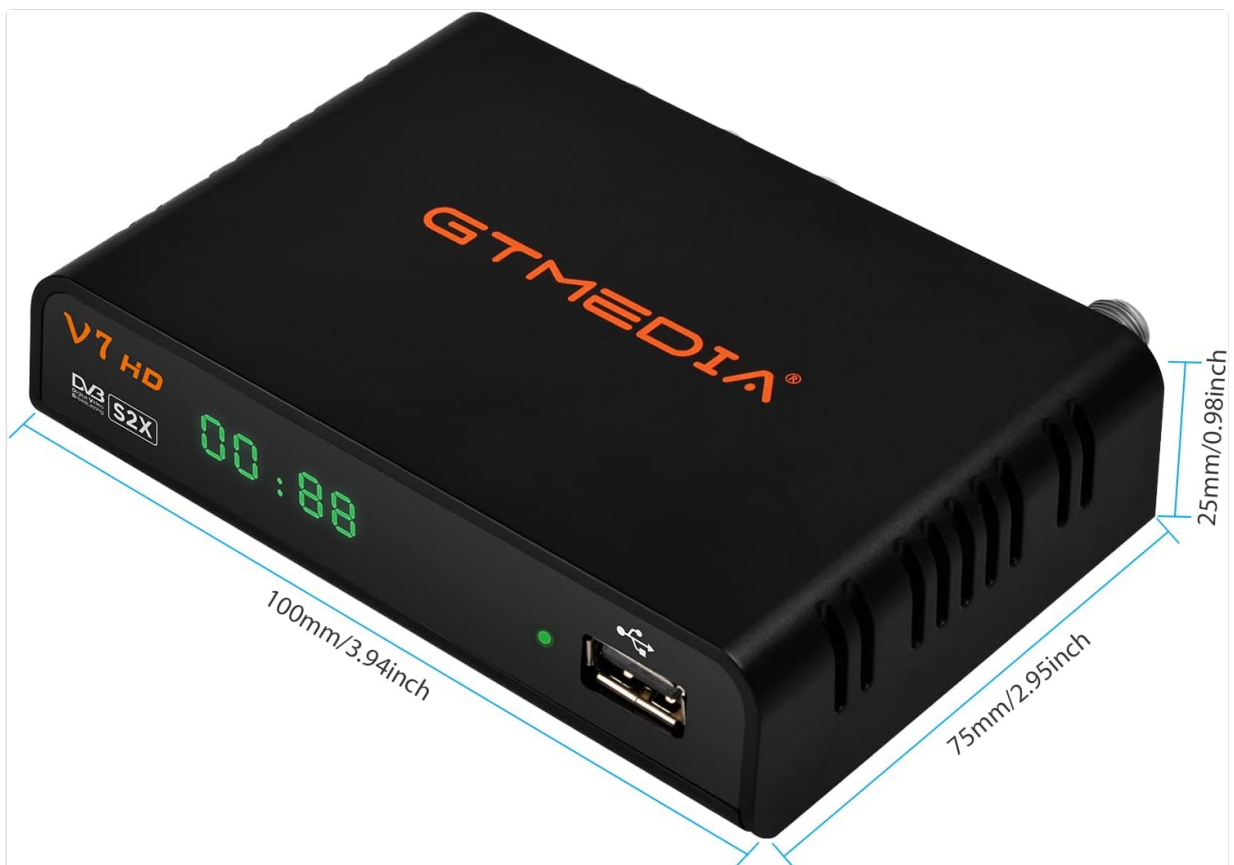
Image: Diagram illustrating the dimensions of the GTMEDIA V7 HD receiver, showing its compact size.