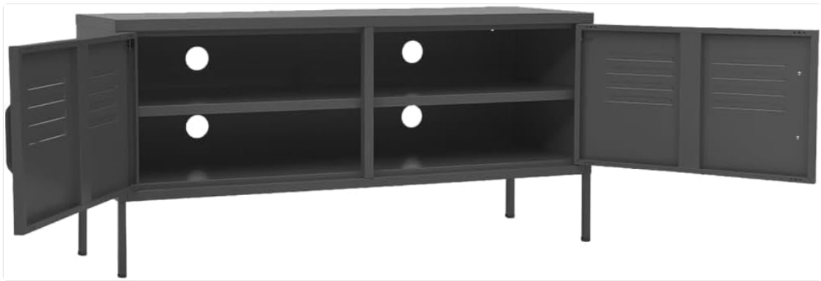
Image 4.3: Interior view of the TV stand with both doors open, revealing the central shelf for storage.