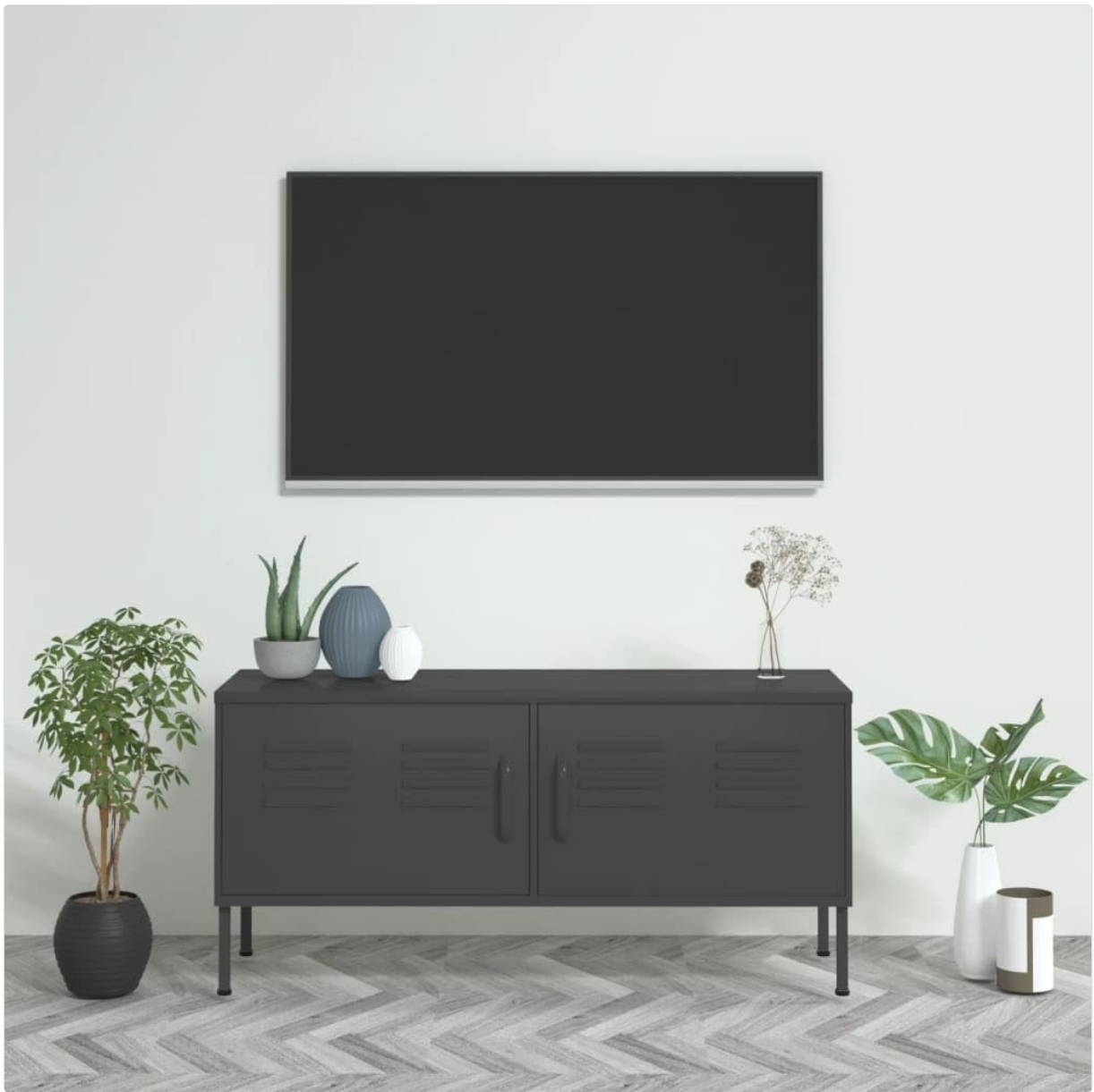
Image 1.1: The vidaXL Industrial Steel TV Stand in Anthracite color, showcasing its design and functionality in a living space.