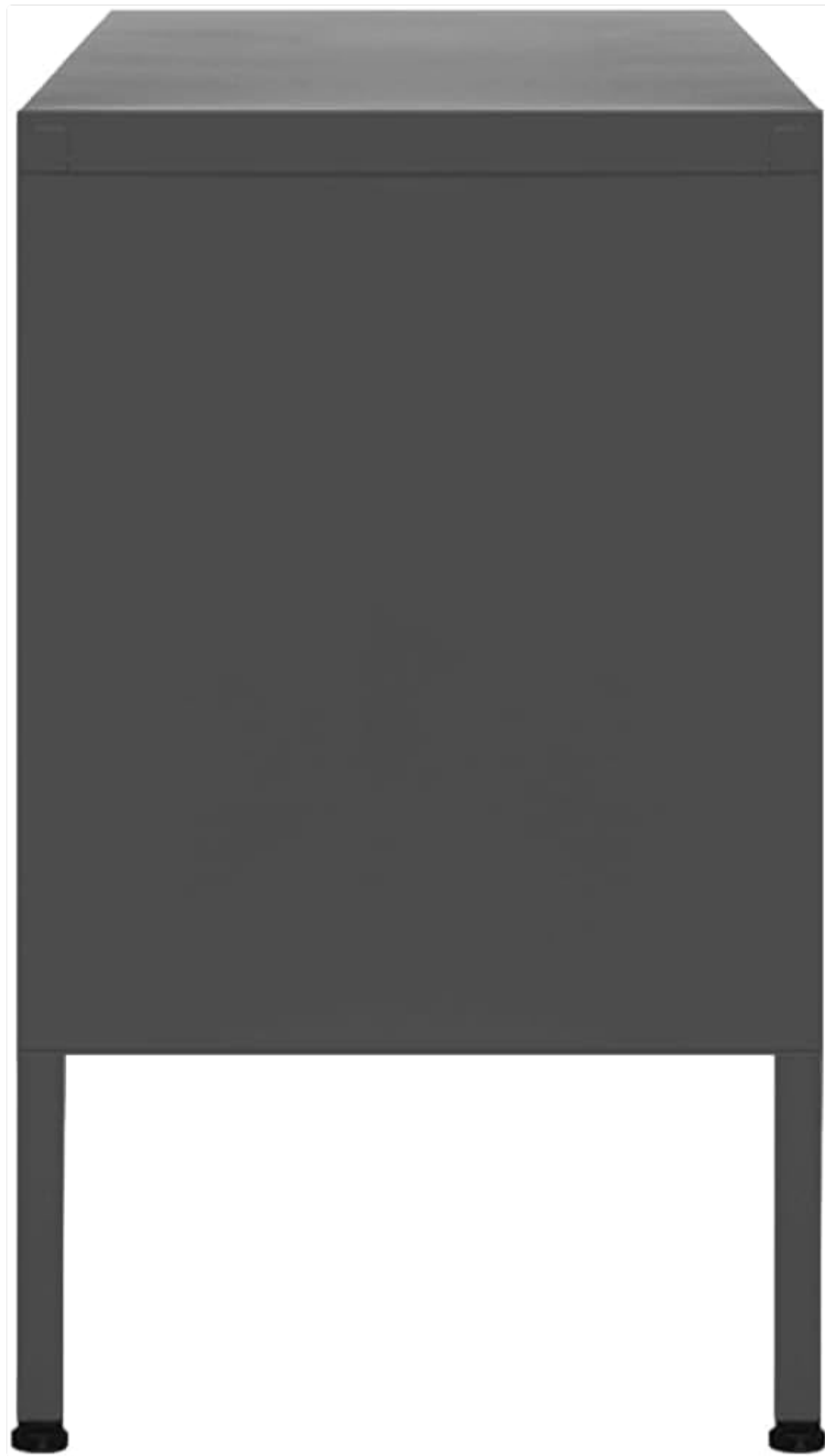
Image 4.2: Side profile of the TV stand, illustrating the sturdy legs and the adjustable levellers at their base.