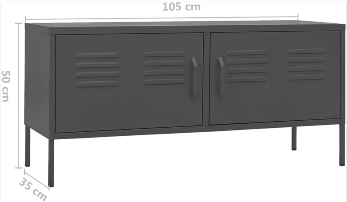
Image 8.1: Dimensional diagram of the TV stand, indicating a width of 105 cm, height of 50 cm, and depth of 35 cm.

Solution: Review the assembly steps carefully. Ensure you are using the correct hardware for each step. If instructions are unclear, refer to the diagrams or seek assistance from another person.