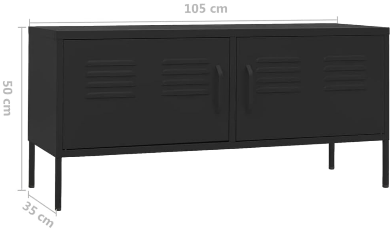
Key dimensions of the TV stand.