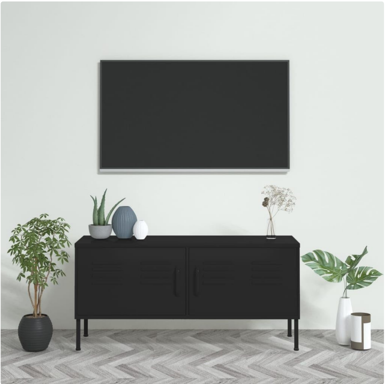
The vidaXL Industrial Style TV Stand, designed to complement modern living spaces.