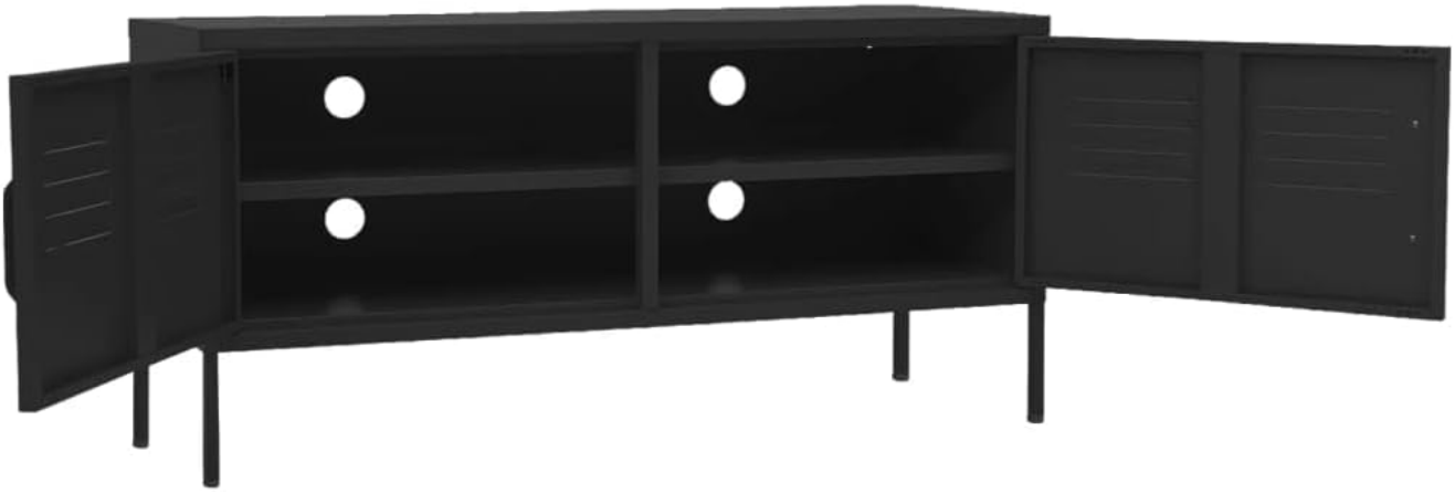
Interior view showcasing the storage compartments and cable management openings.

helps to further organize items within the cabinet.