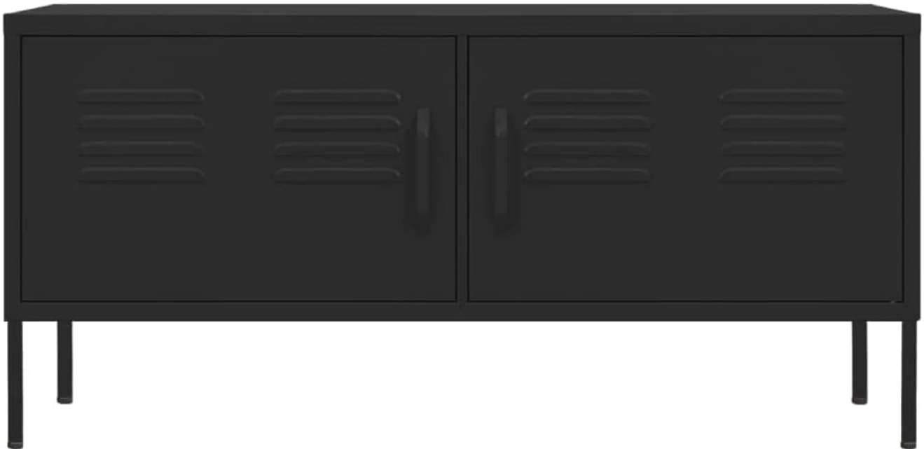
Front view of the TV stand after assembly.