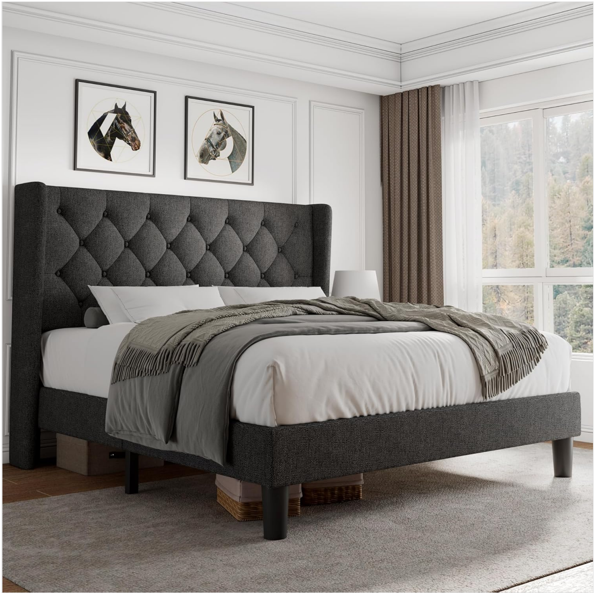
Figure 4.1: The iPormis Queen Size Platform Bed Frame in a bedroom setting.