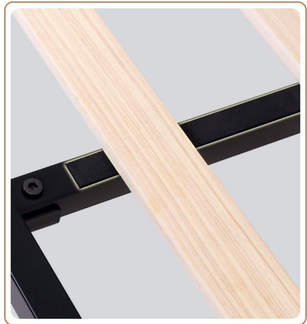
Figure 3.2: Velcro slats and EVA foam mute bars for silent and stable support.

Avoid direct contact between steel frame and wood slats plus noises eliminating