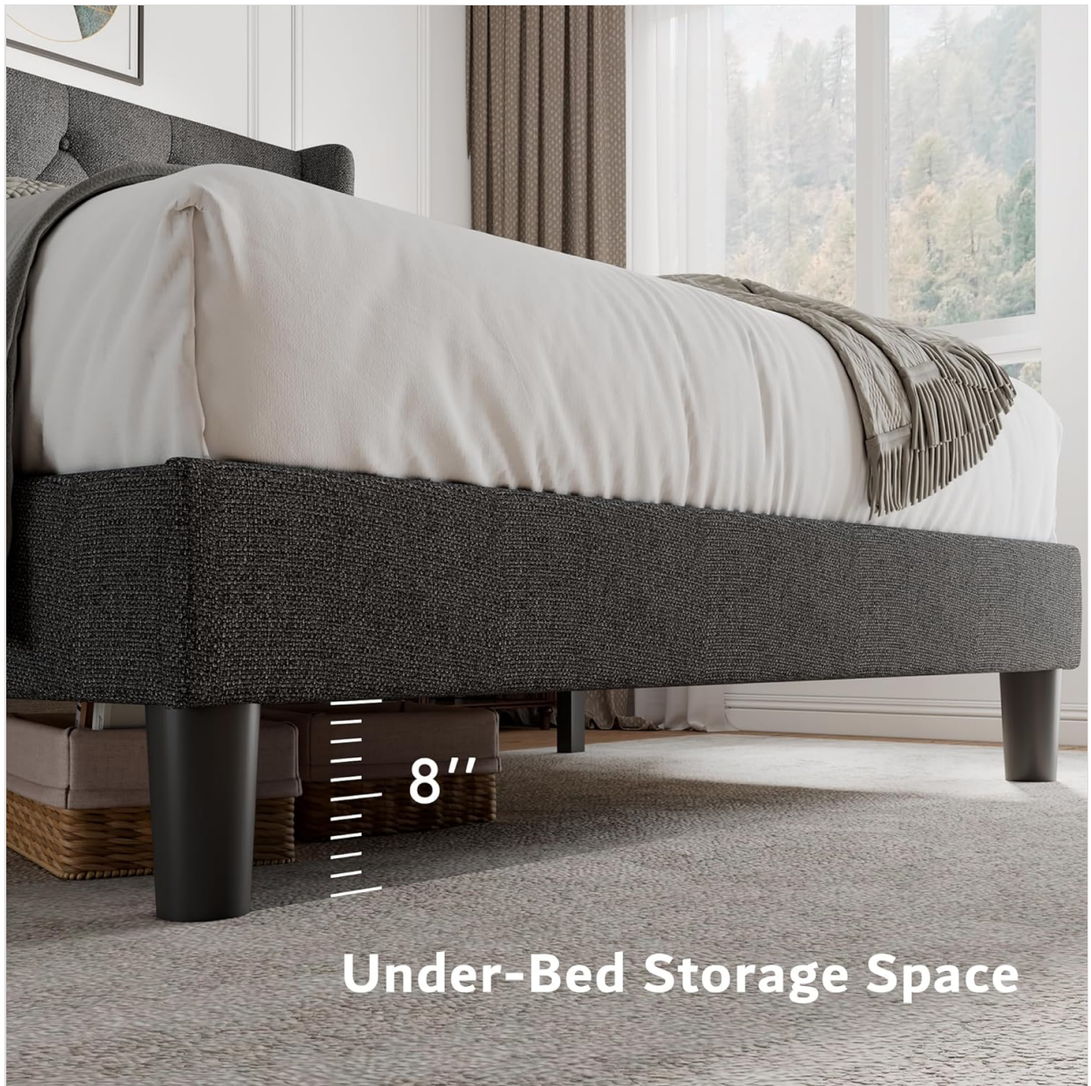
Figure 4.2: Illustration of the 8-inch under-bed storage space.