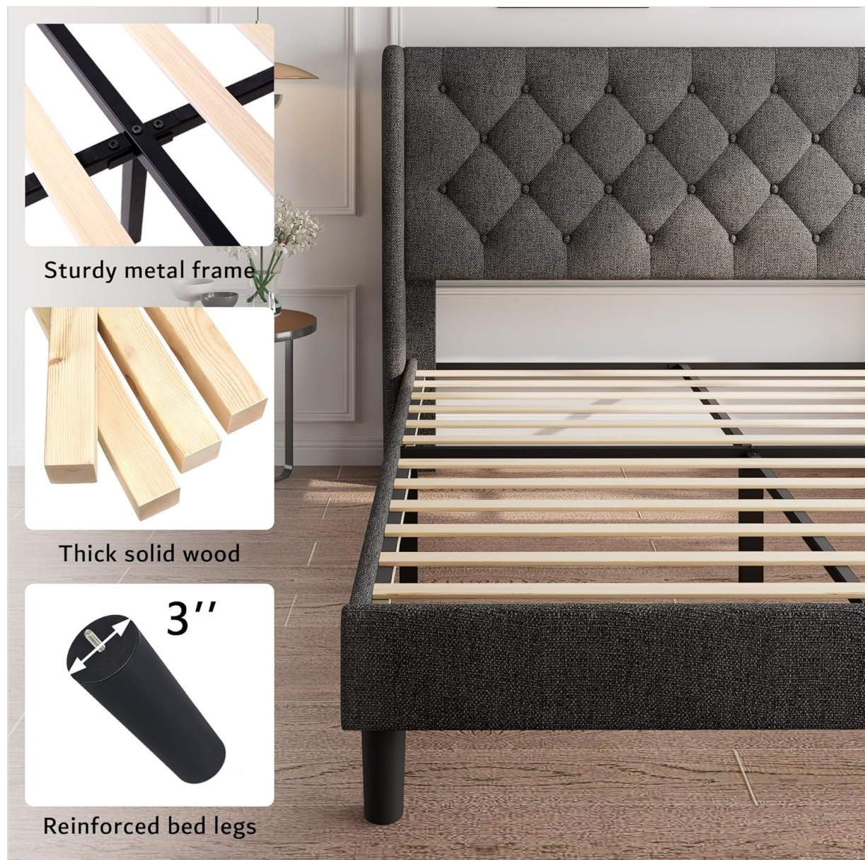
Figure 3.1: Details of the sturdy metal frame, thick solid wood slats, and reinforced bed legs.