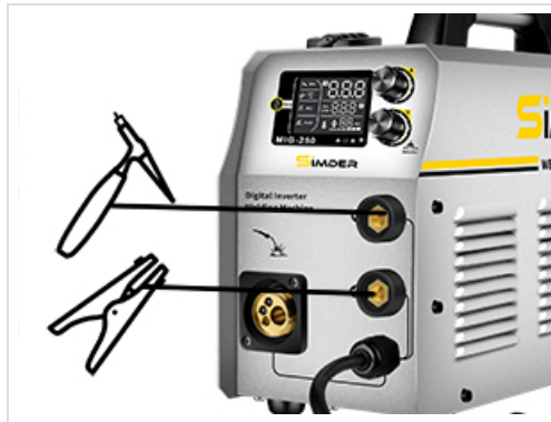
Figure 8: Lift TIG Welding Connection.

Diagram showing the connection points for Flux Core welding, which typically uses the MIG gun and ground clamp without external gas.