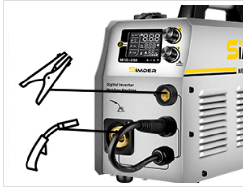
Figure 7: Flux Core Welding Connection.

Diagram showing the connection points for Flux Core welding, which typically uses the MIG gun and ground clamp without external gas.