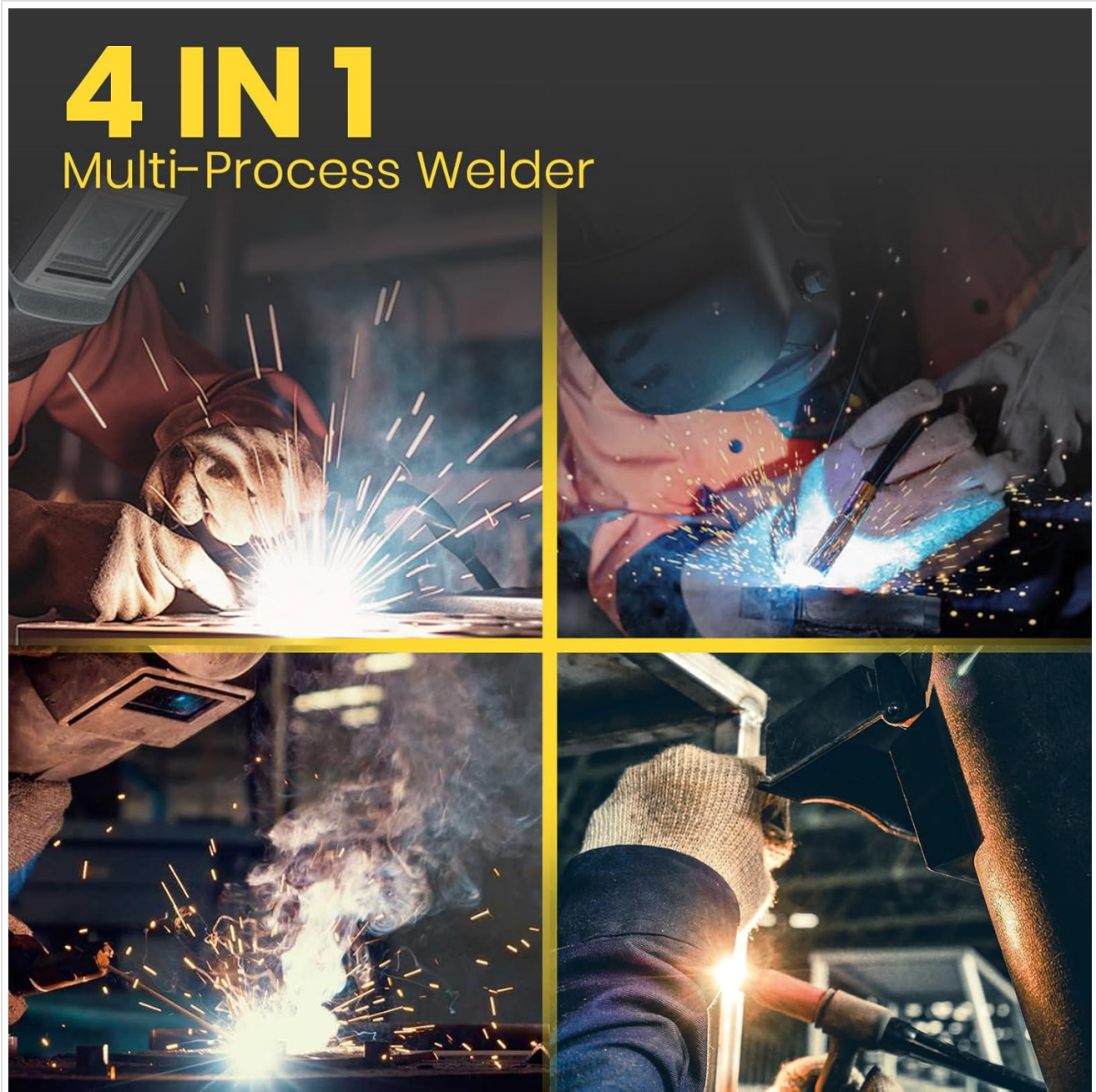
Figure 2: The 4-in-1 Multi-Process Capability of the Welder.

This image illustrates the four primary welding processes supported by the SSIMDER MIG250: MIG, TIG, Stick, and Flux Core welding, highlighting its versatility.