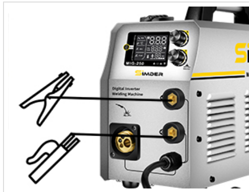
Figure 9: MMA/Stick Welding Connection.

Diagram showing the connection points for Lift TIG welding, including the TIG torch and ground clamp.