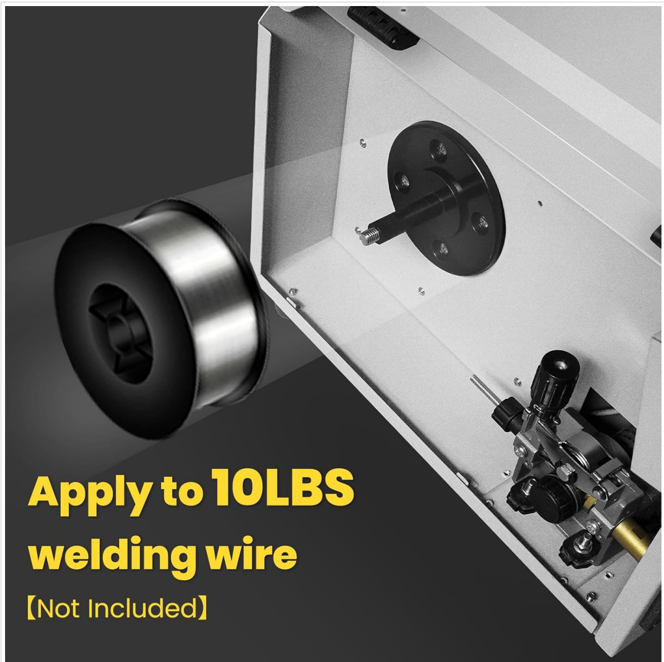
Figure 4: Wire Spool Installation (10LBS shown).

This image demonstrates the internal compartment of the welder, showing how a 10LBS welding wire spool is installed onto the spindle and fed into the wire feeder.