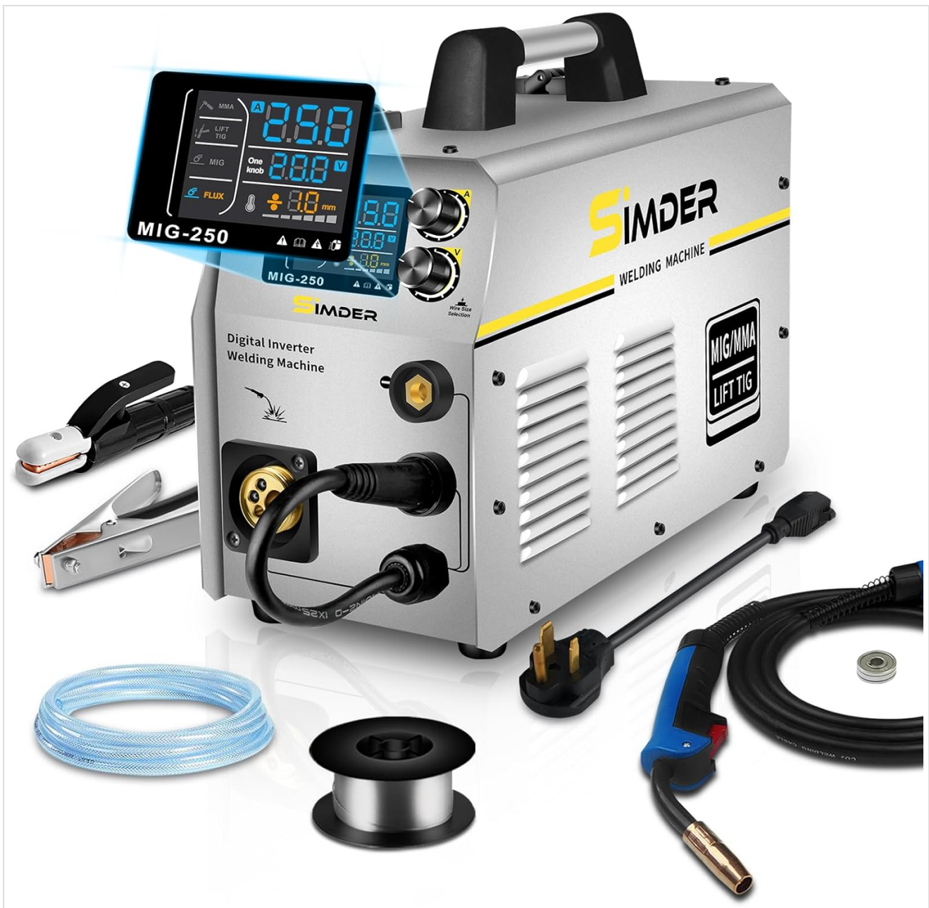
Figure 1: SSIMDER MIG250 Multi-Process Welder and Included Accessories.

The image displays the SSIMDER MIG250 welding machine along with its standard accessories, including the MIG gun, ground clamp, electrode holder, flux core wire, 220V to 110V adapter, 1.0mm K Wheel, and gas tube.