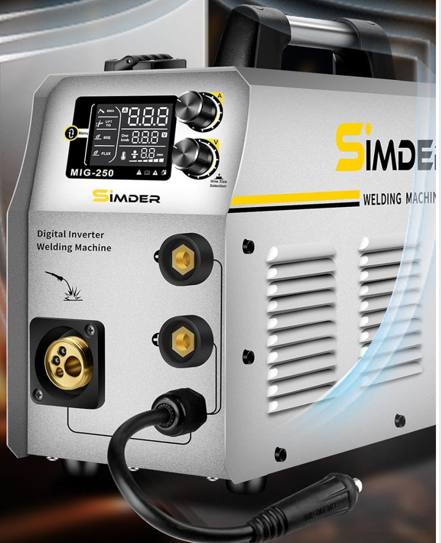
Figure 10: Multiple Protection Features.

This image illustrates the built-in safety features of the welder, including protection against over-voltage, over-current, and over-heating, which contribute to its durability and user safety.