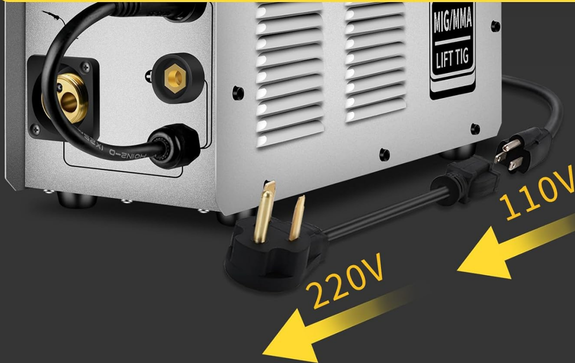
Figure 3: Dual Voltage Input (110V/220V).

The image shows the welder's capability to operate on both 110V for lightweight work and 220V for construction site work, with an adapter for 110V connection.