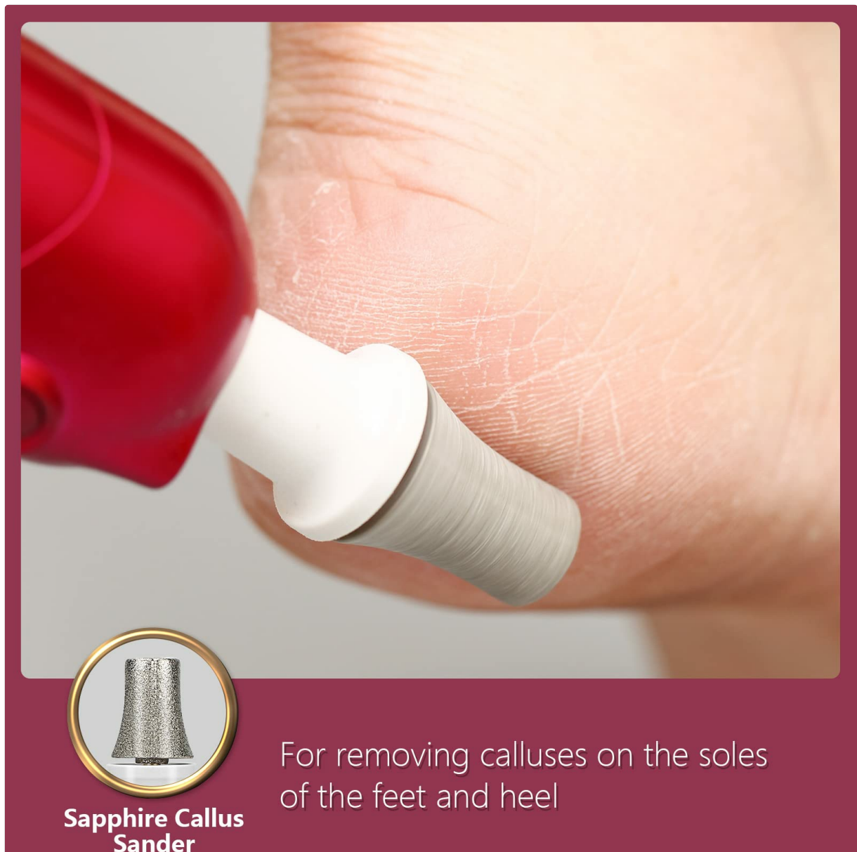
Image 4.1: The Sapphire Callus Sander in use. This image demonstrates the bit being applied to the heel of a foot, illustrating its intended function for removing calluses and hard skin.