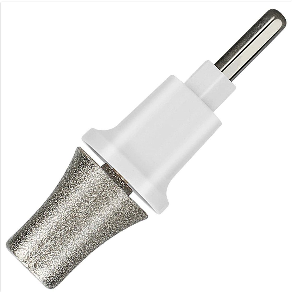
Image 1.1: The SEAMIND Sapphire Callus Sander replacement bit. This image shows the complete bit, featuring its sapphire-coated head and white plastic base, ready for attachment to a compatible SEAMIND device.