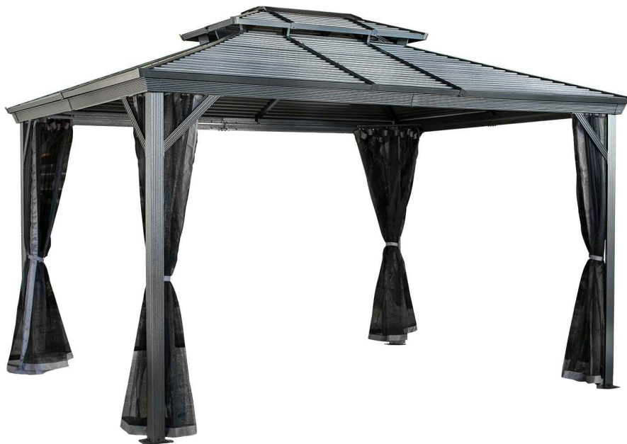
Image 1.1: The Sojag Ventura II 10' x 12' Hardtop Gazebo provides a versatile outdoor shelter.

This manual provides essential information for the safe and effective assembly, operation, and maintenance of your Sojag Ventura II 10' x 12' Hardtop Gazebo. This outdoor structure features a durable aluminum frame and a galvanized steel double roof, designed to offer protection from various weather conditions. Please read all instructions carefully before proceeding with assembly or use.