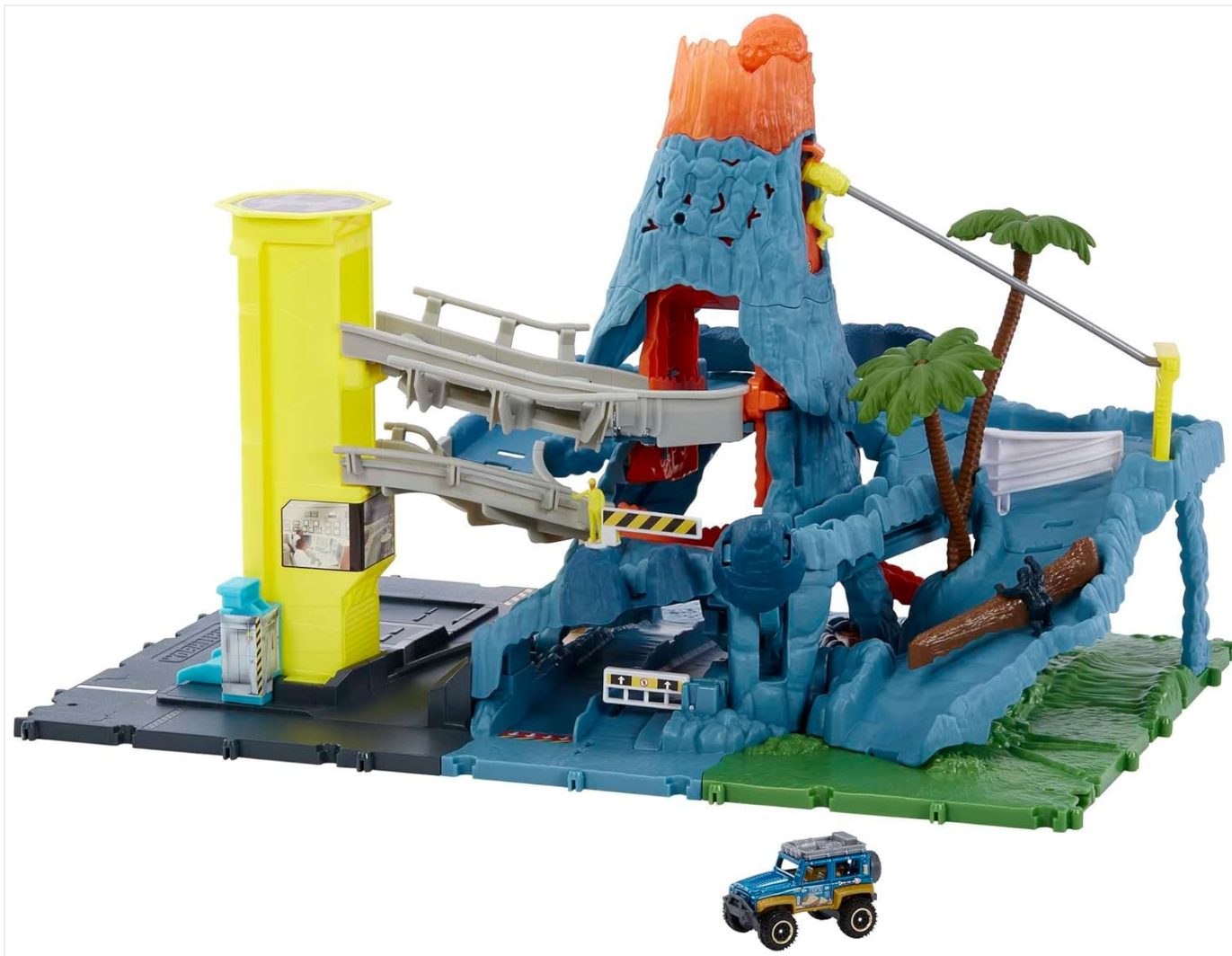
Figure 3.1: Fully assembled Matchbox Action Drivers Volcano Escape Playset.