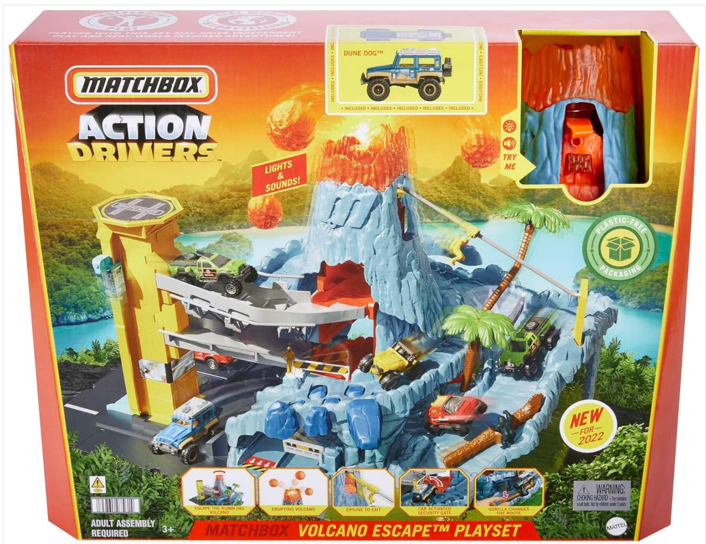
Figure 2.1: Product packaging showing included items and features.