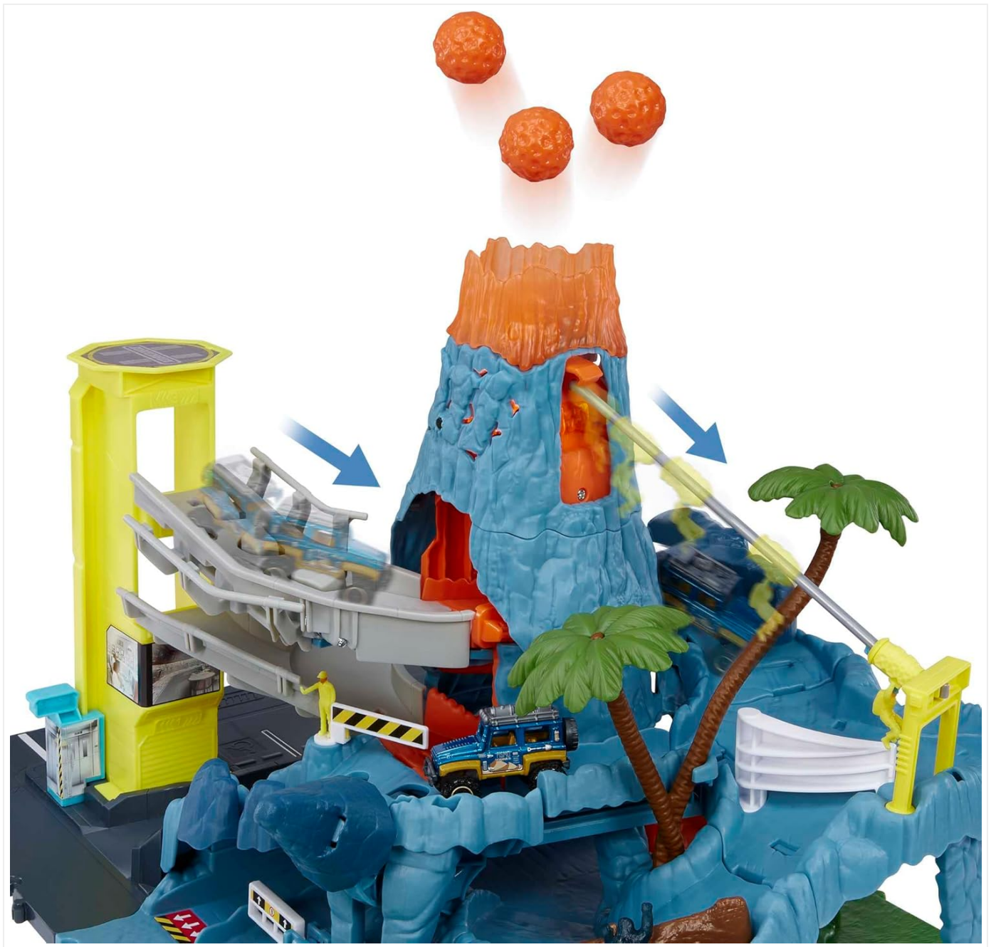
Figure 4.2: The volcano erupting and the zipline in motion.