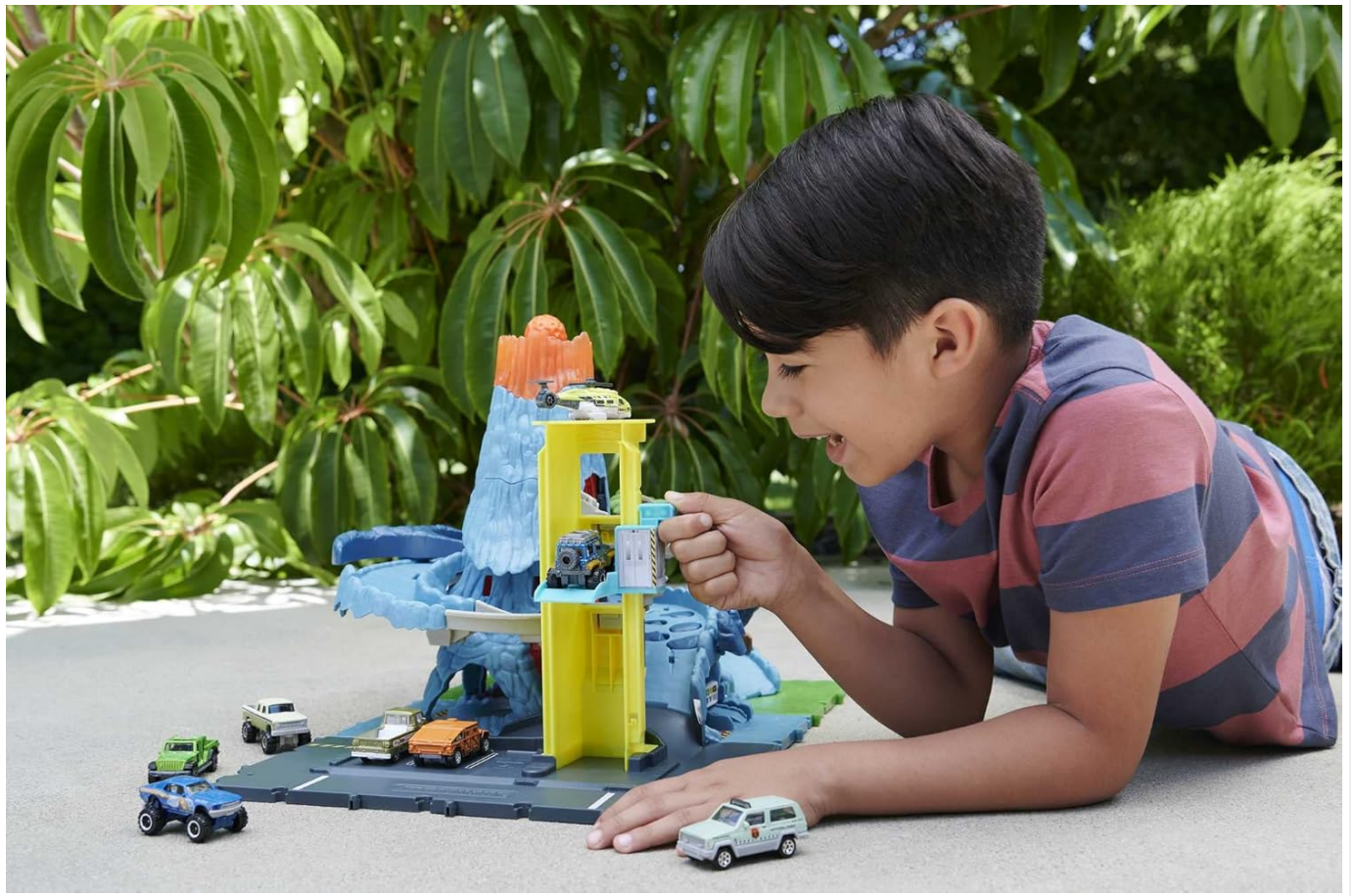
Figure 4.1: Demonstrating the vehicle elevator in use.