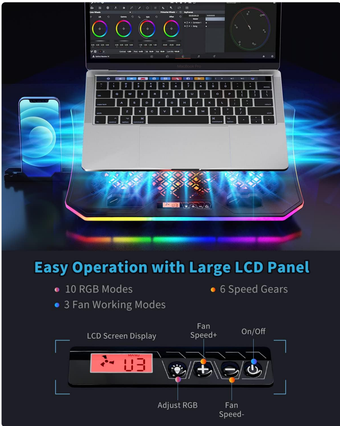
Image 6: The easy-to-operate LCD control panel of the cooling pad, displaying options for 10 RGB modes, 6 fan speed gears, and 3 fan working modes.