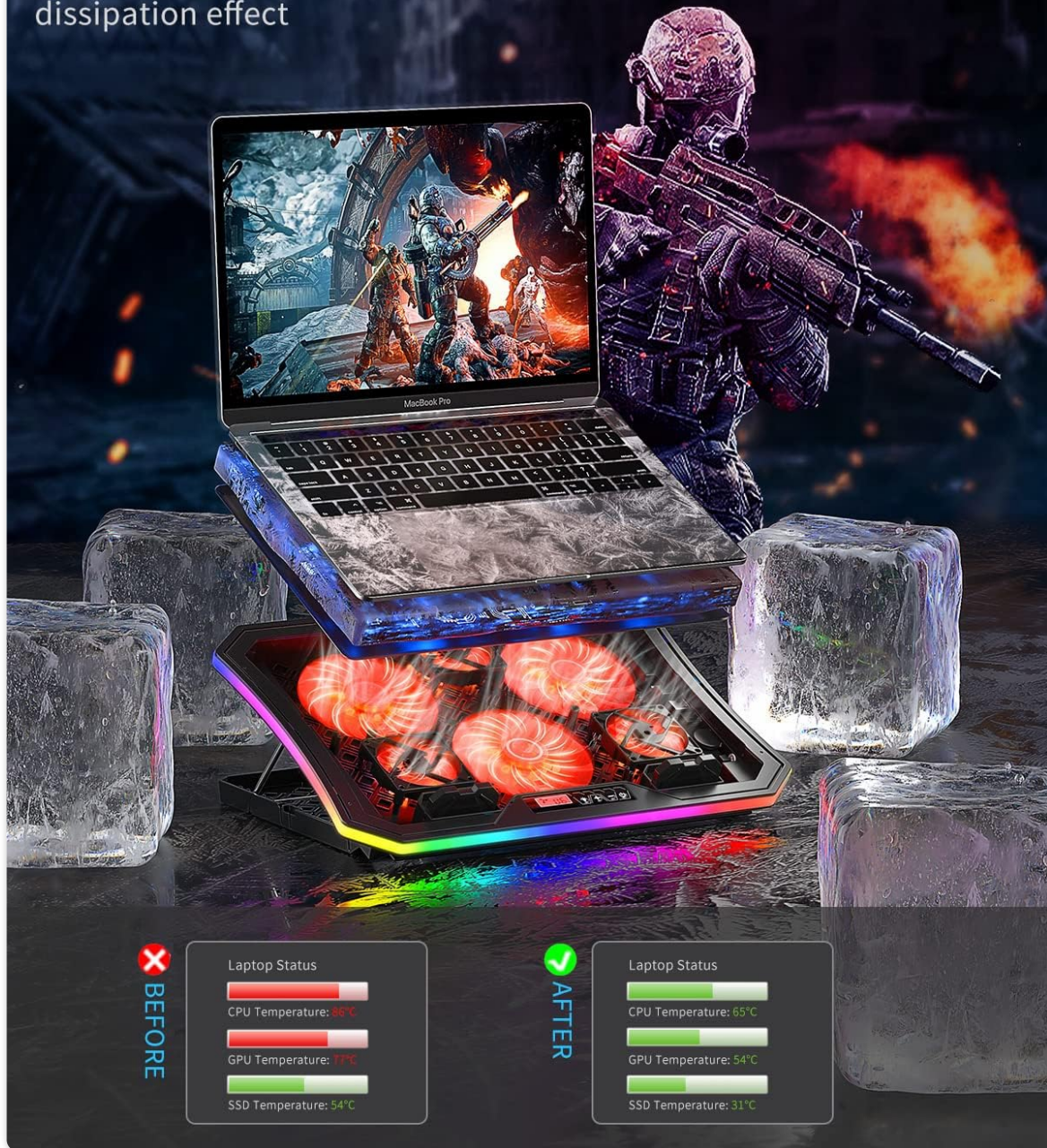
Image 1: The KeiBn A8 Laptop Cooling Pad featuring 6 super cooling fans with LED lights, illustrating its ultra heat dissipation effect and temperature reduction capabilities.

6 super cooling fans with LED lights provide ultra heat dissipation effect