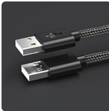
Image 3: The included USB-A to USB-A cable used to power the cooling pad from your laptop.