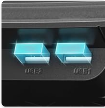
Image 2: Close-up view of the two USB ports located on the side of the cooling pad. One port is used for power, the other for connecting external devices.

USB port on your laptop. The cooling pad will power on automatically.