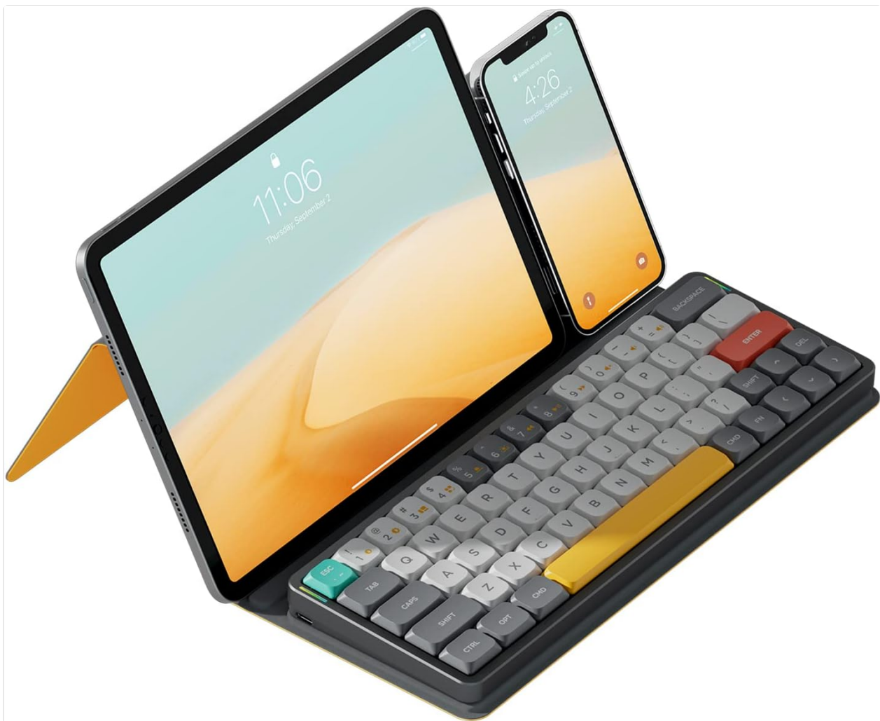
Figure 4: The Nuphy Air60 keyboard connected wirelessly to a tablet and smartphone, demonstrating its multi-device capability.