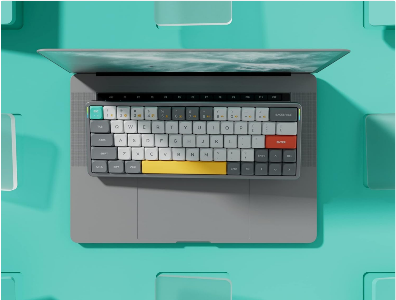
Figure 8: The Nuphy Air60 with some keycaps removed, illustrating the hot-swappable switch design.

durability, resistance to shine, and a textured feel that provides a comfortable typing experience over long periods. The included key puller allows for easy removal and replacement of keycaps for cleaning or customization.