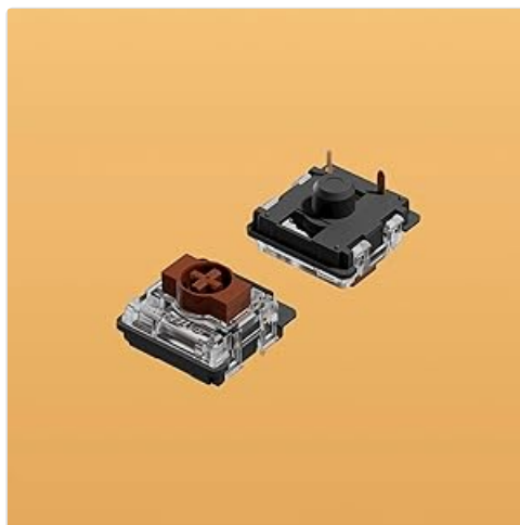
Figure 7: A close-up view of a Gateron Brown Switch, highlighting its design for tactile feedback.

The Nuphy Air60 features a hot-swappable PCB, allowing you to easily change the mechanical switches without any soldering. This enables users to customize the typing feel to their preference. The keyboard comes pre-installed with Gateron Brown Switches, and sample switches (Red, Blue) are often included for testing different tactile experiences.