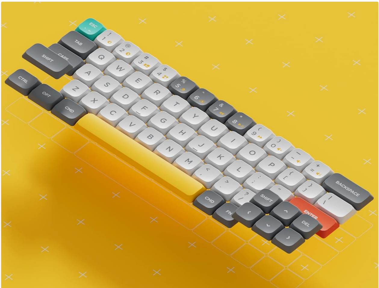
Figure 6: The Nuphy Air60 showcasing its vibrant RGB backlighting and unique side lighting effects.