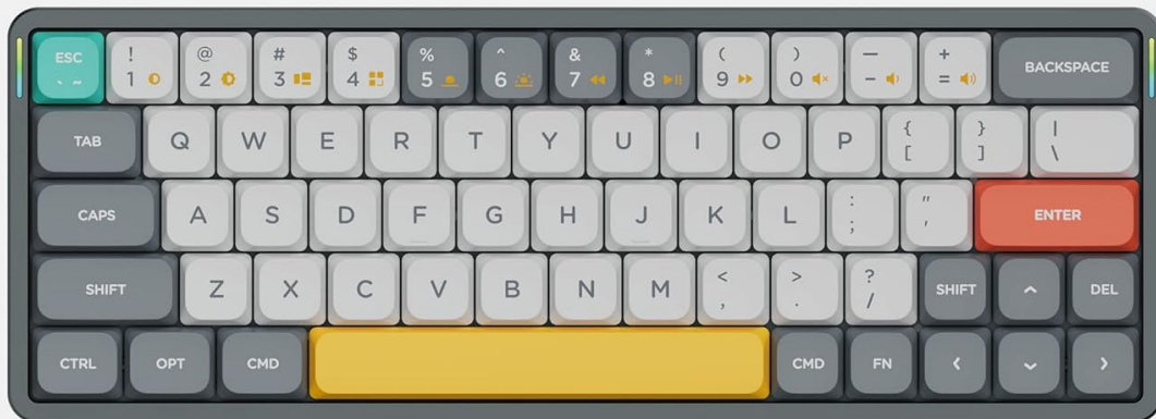
Figure 1: Nuphy Air60 Portable Wireless Keyboard, showcasing its compact design and colorful keycaps.