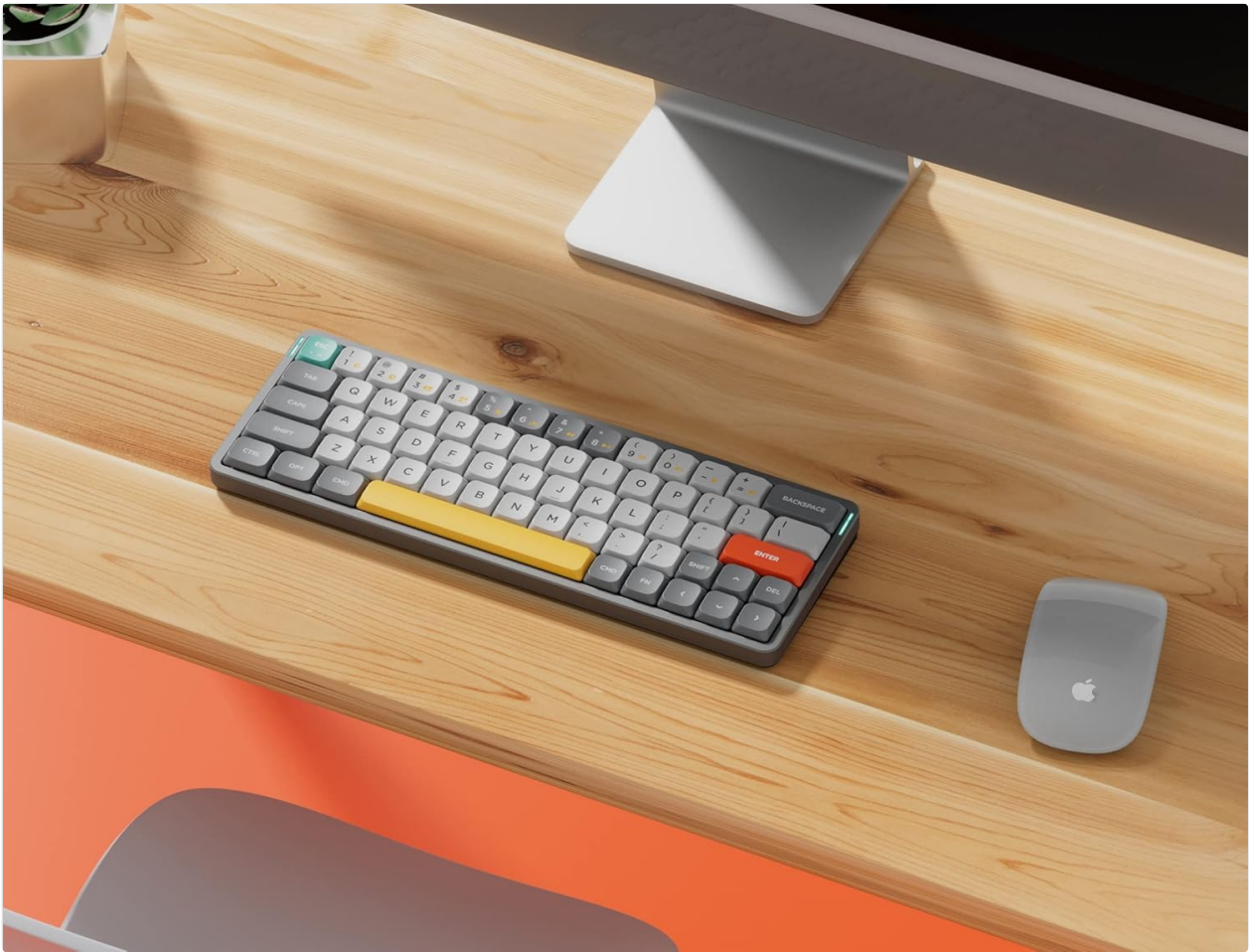
Figure 9: The Nuphy Air60 showcasing its magnetic feet, which provide adjustable height and typing angle.