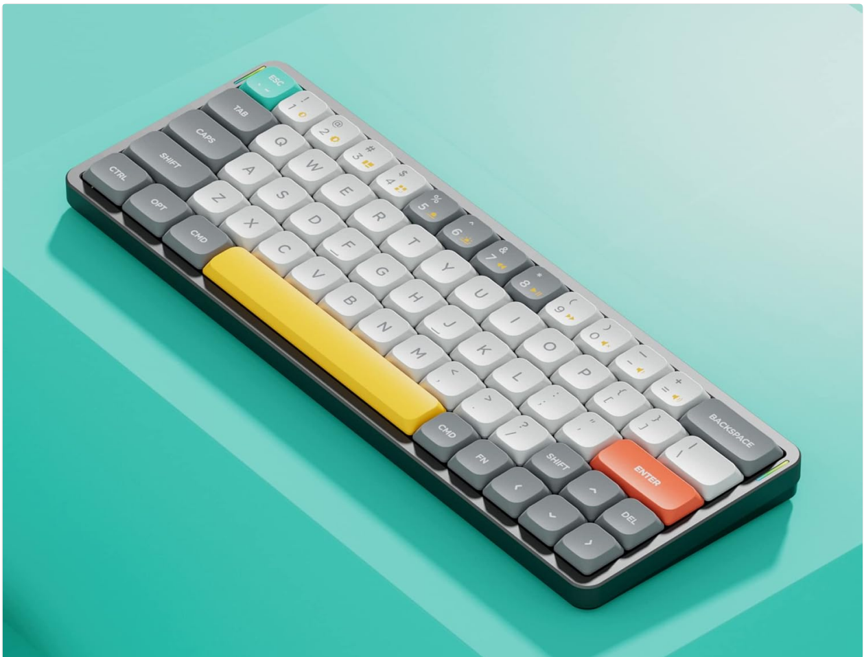
Figure 5: The Nuphy Air60 positioned directly on top of a laptop keyboard, offering an ergonomic typing solution.