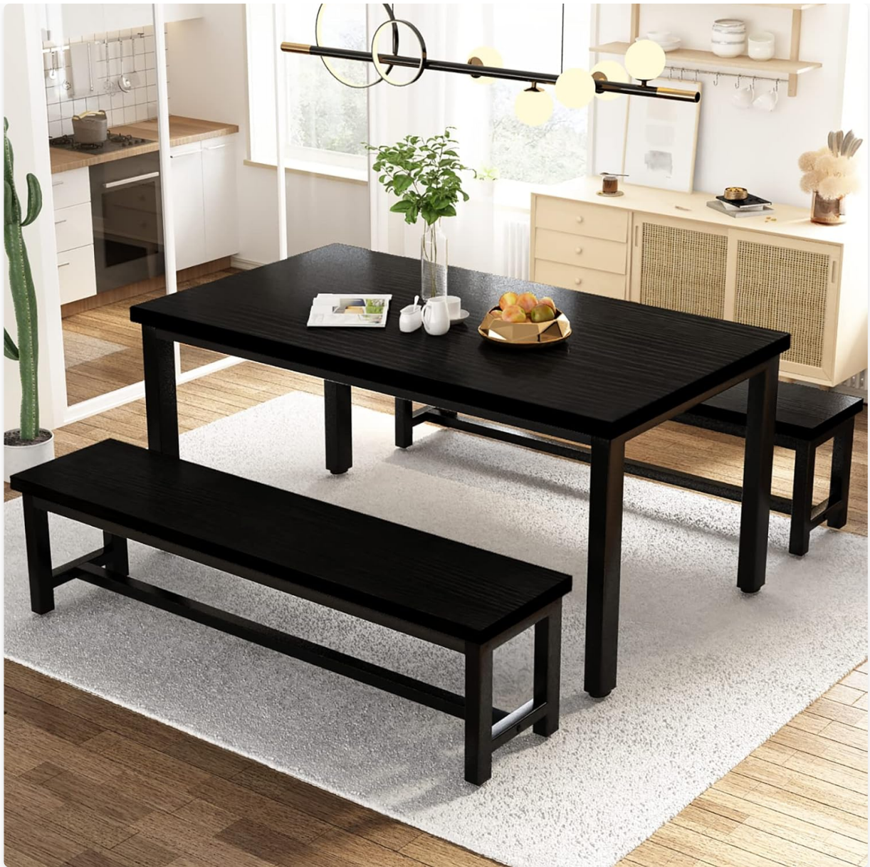
Figure 1: The AWQM Dining Room Table Set in a kitchen environment.