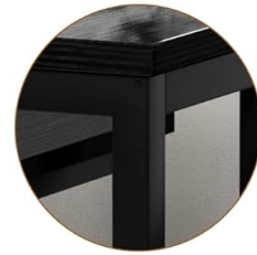
Upgraded Metal Frame