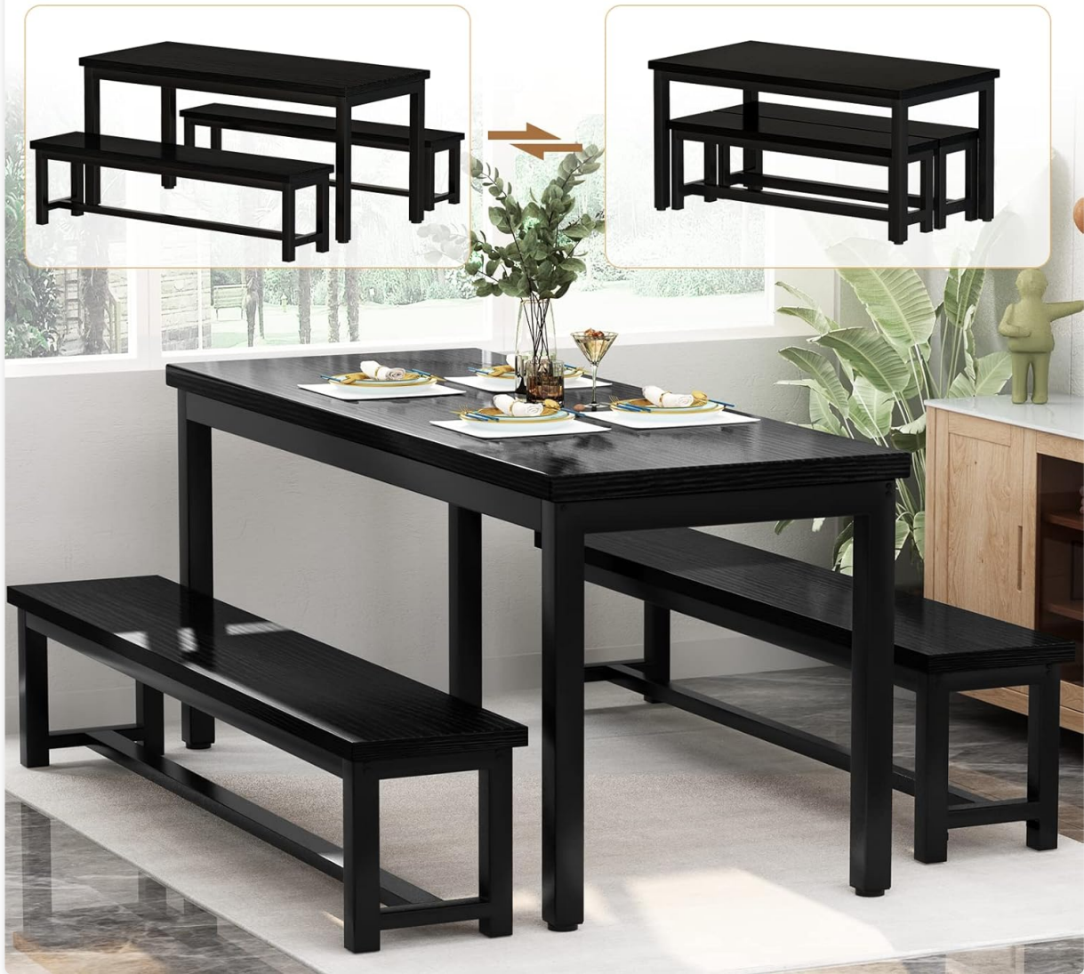
Figure 3: Illustration of the space-saving design, allowing benches to be stored under the table.