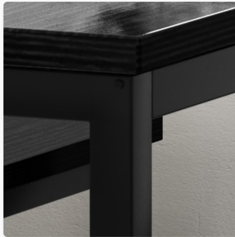
Figure 5: The water-resistant surface of the table.