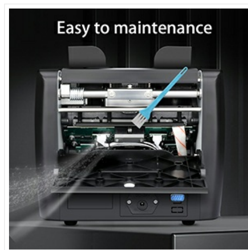
Image: A view of the CASHTEK N10 with its back cover open, demonstrating the easy access for cleaning internal components with a brush.

Perform cleaning regularly, especially if the machine is used frequently or if you notice a decrease in counting accuracy or an increase in bill jams.