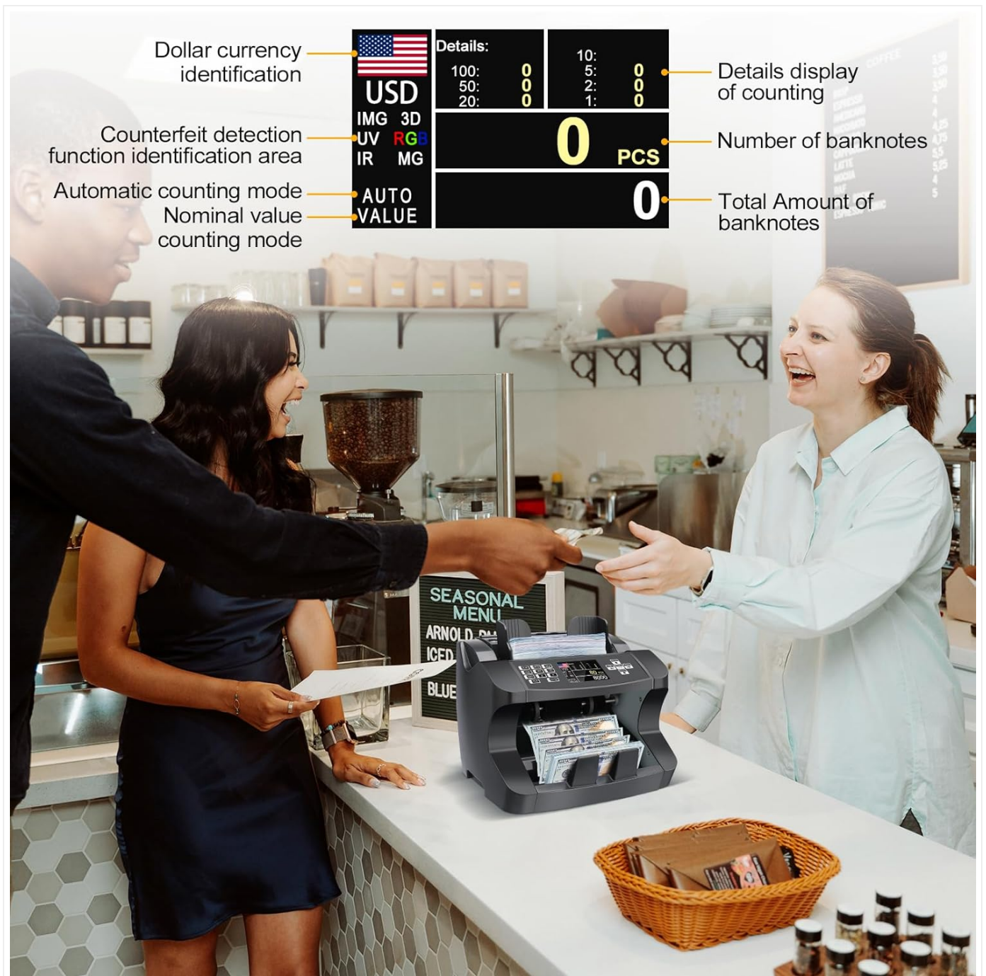
Image: A close-up of the machine's TFT screen displaying various counting details, including currency identification, counterfeit detection function identification area, nominal value, number of banknotes, and total amount.