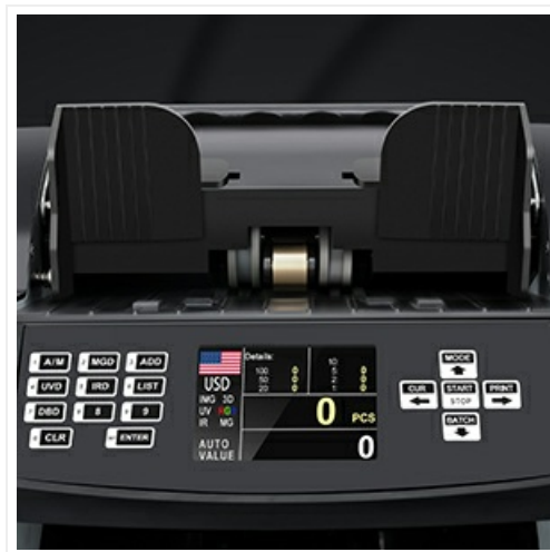
Image: A close-up view of the CASHTEK N10's control panel, showing the buttons for various functions and the display screen.