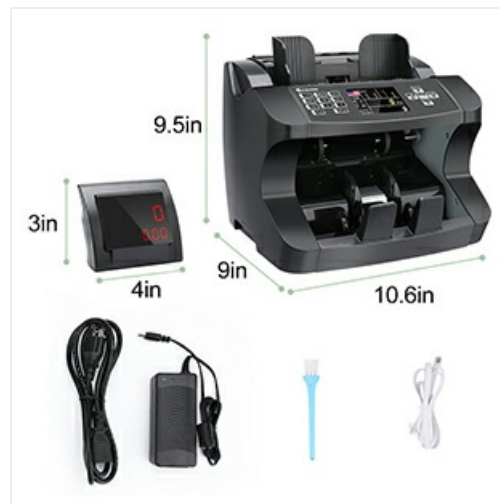
Image: A visual representation of the CASHTEK N10 machine and its accessories, including the power cord, adapter, external display, and cleaning brush, along with key dimensions.