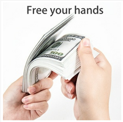
Image: A visual illustrating how the money counter "frees your hands" from the tedious task of manual counting.