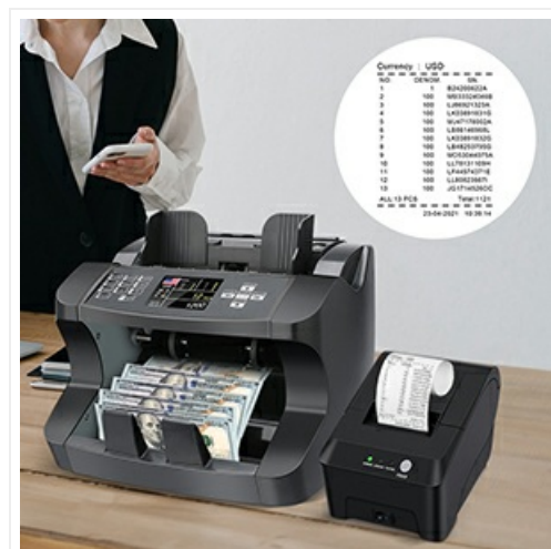
Image: The CASHTEK N10 Money Counter Machine shown alongside an optional external printer, which can be connected to print