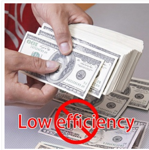
Image: A comparison showing the "low efficiency" of manual money counting versus the ease of using the machine.