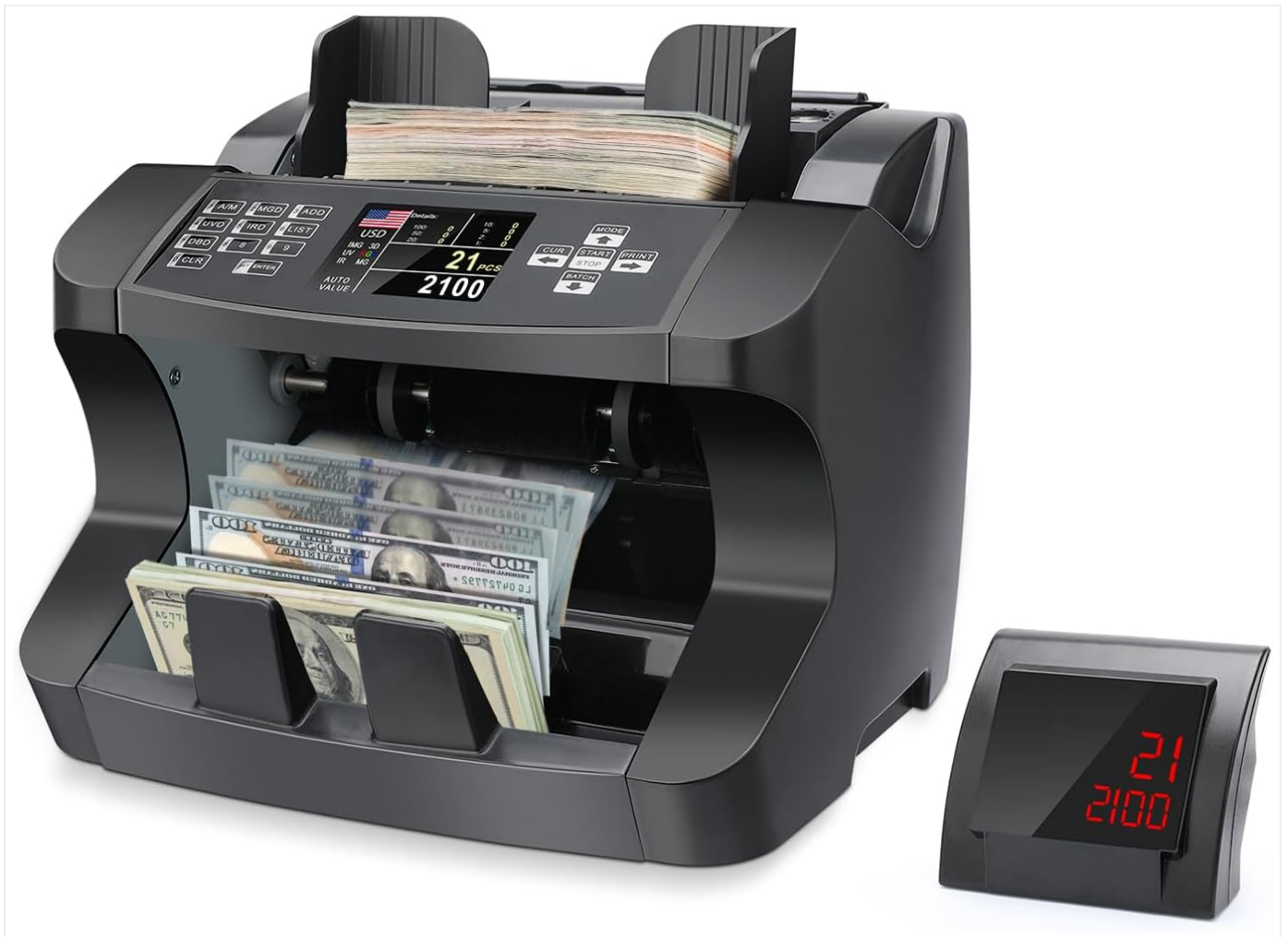
Image: The CASHTEK N10 Money Counter Machine, a compact black device with a bill hopper and stacker, and an external display unit.