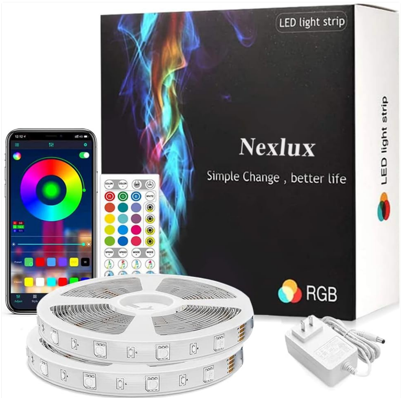
Figure 1: Nexlux 100ft LED Strip Lights product overview.