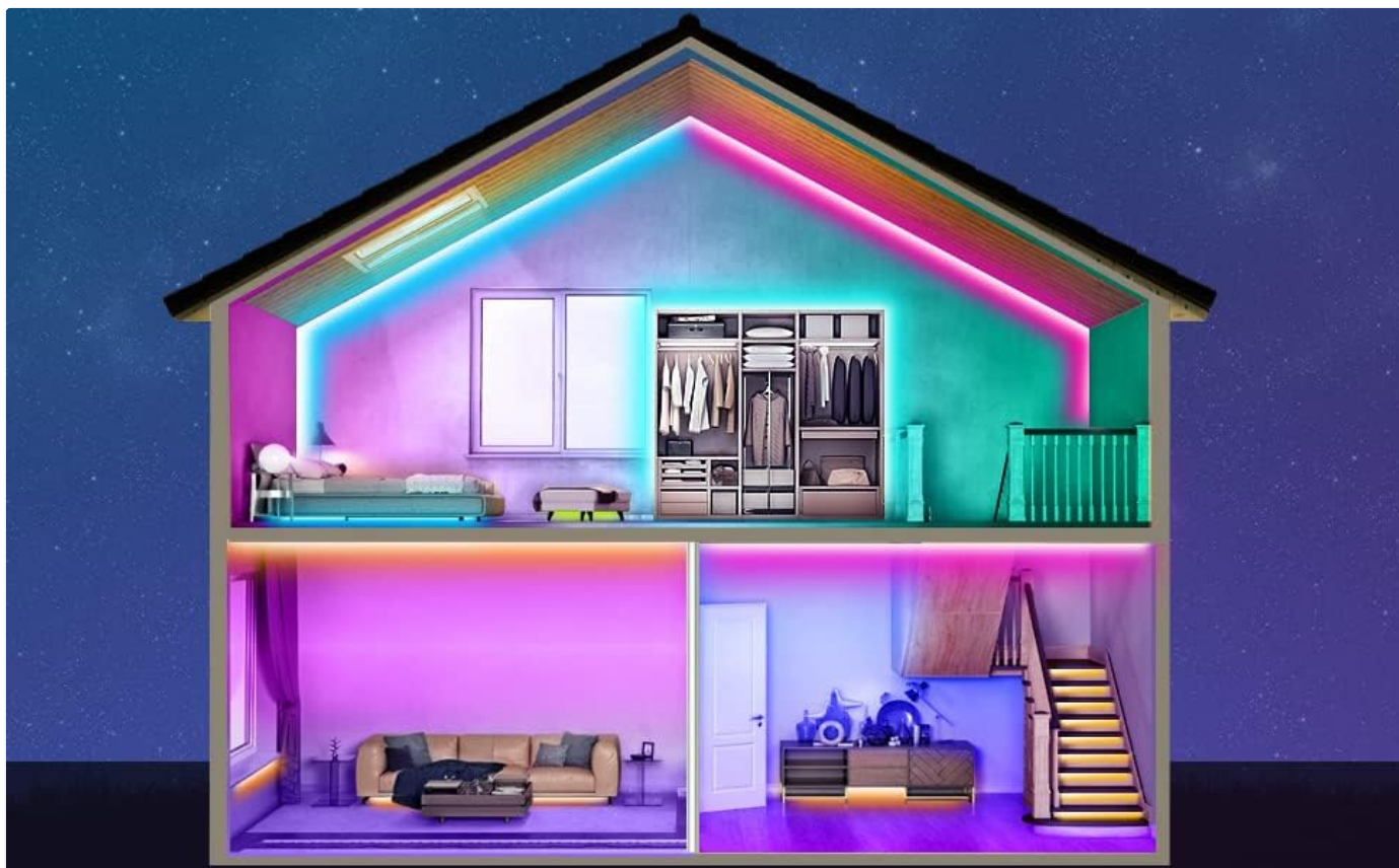
Figure 2: Example indoor installation of LED strip lights.