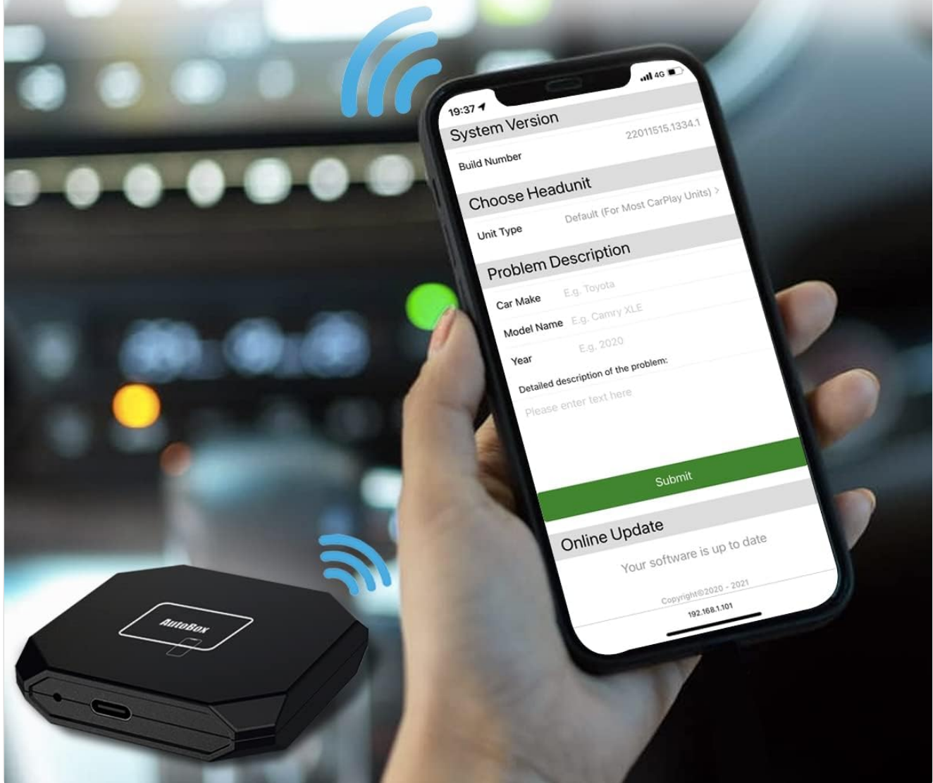
Figure 4: Wireless CarPlay supports original car control methods for seamless interaction.

Support Online Upgrade with IP Address '192.168.1.101'