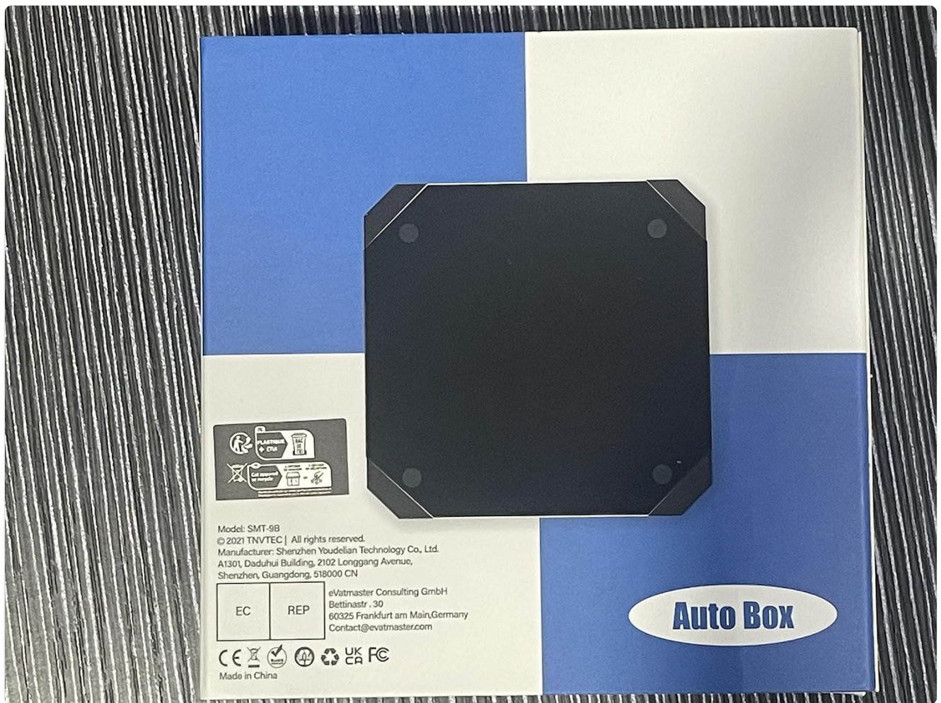
Figure 6: Rear view of the product packaging, displaying model and manufacturer information.