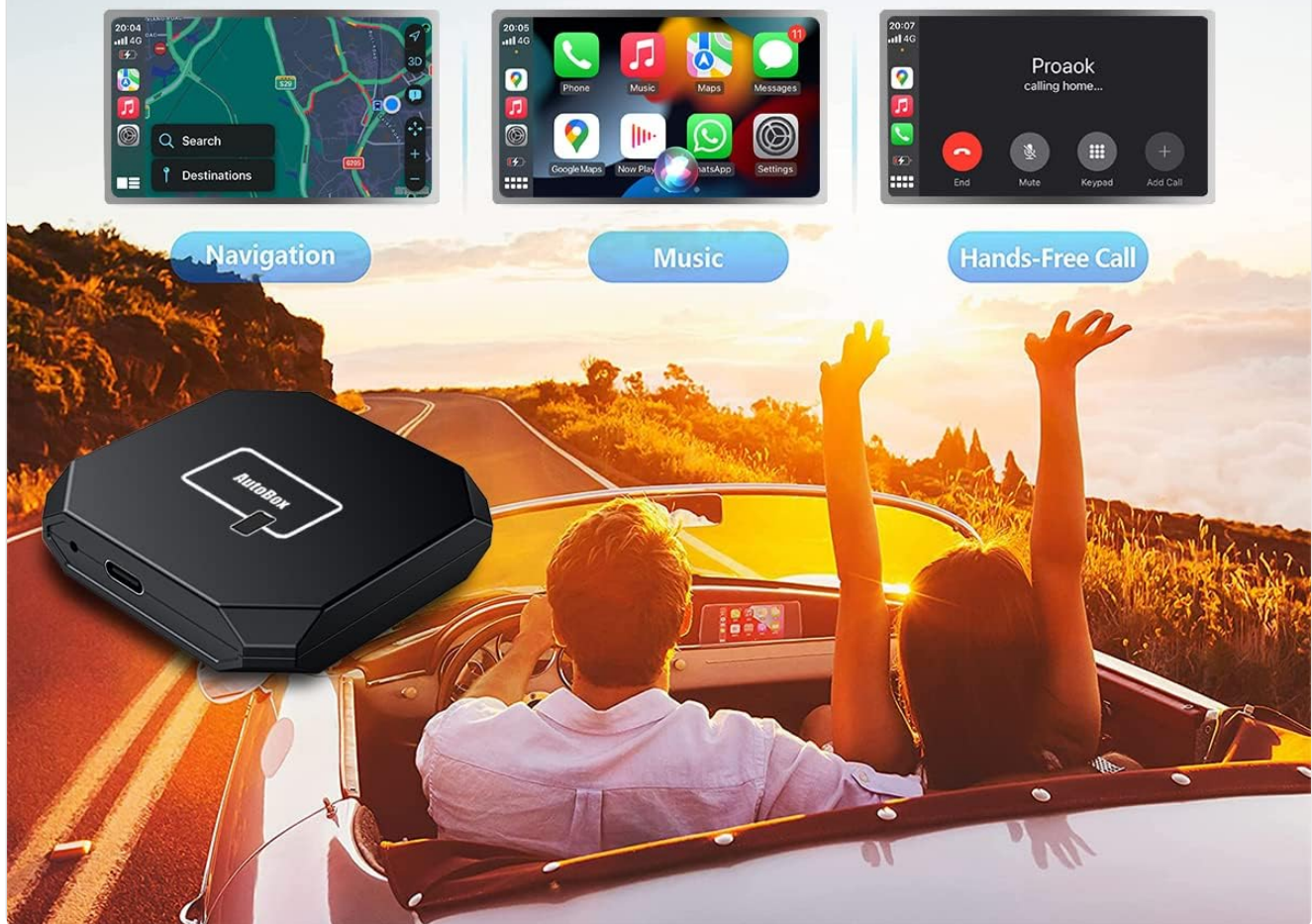
Figure 3: Key features of Wireless CarPlay: Navigation, Music, and Hands-Free Calling.