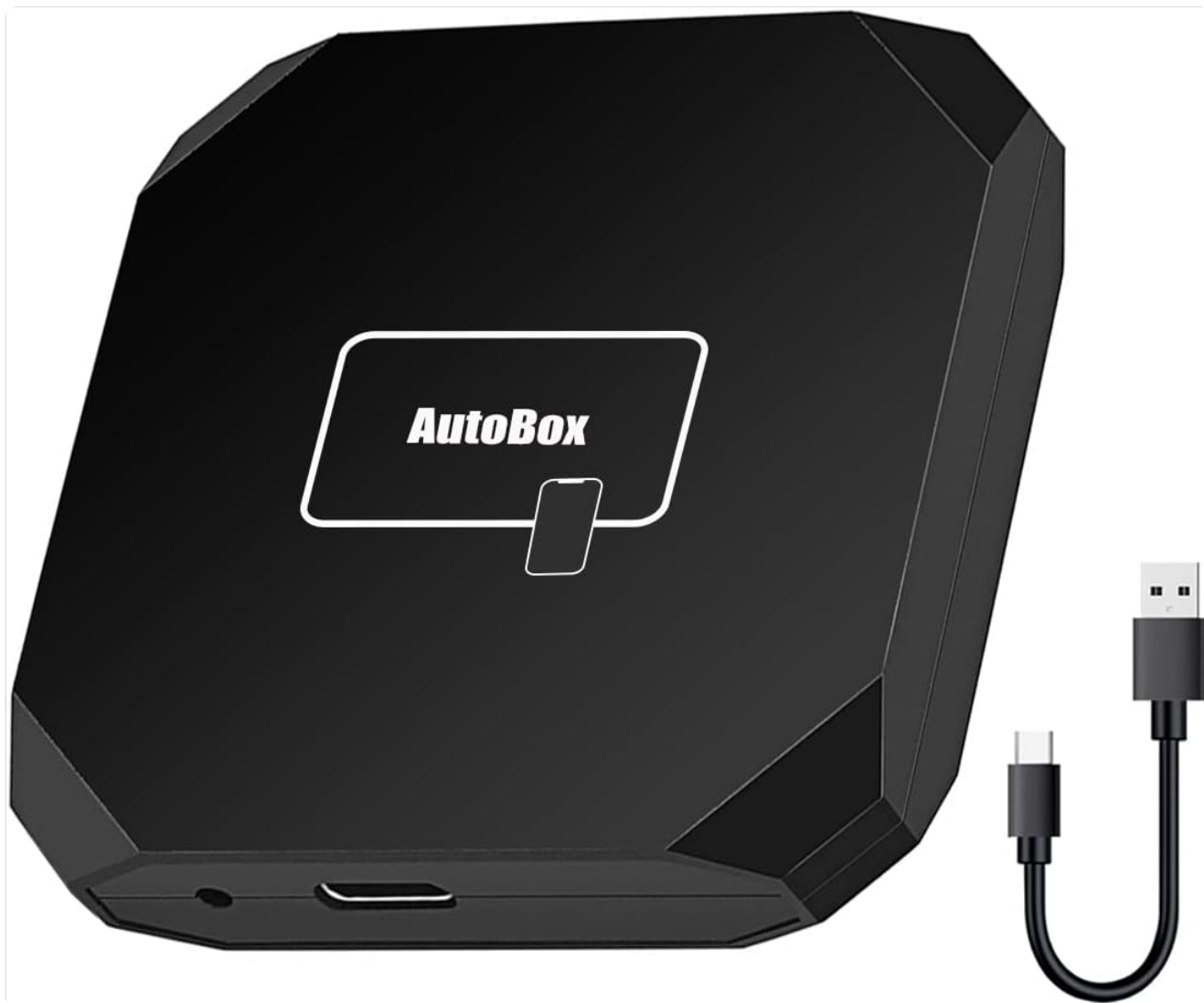
Figure 1: TNVTEC Wireless CarPlay Adapter with included USB-C cable.