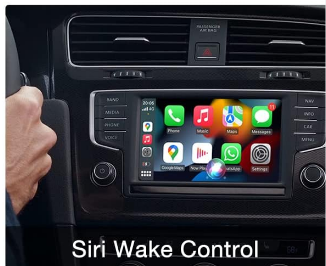
Figure 2: Visual guide for connecting the TNVTEC Wireless CarPlay Adapter.

Your browser does not support the video tag.