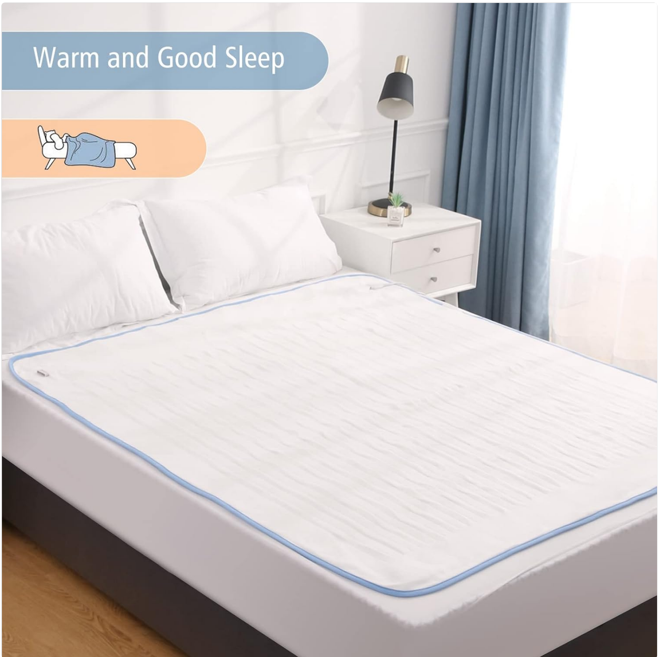
Image 1.1: The CURECURE Electric Heated Mattress Pad on a bed, illustrating its coverage and design.