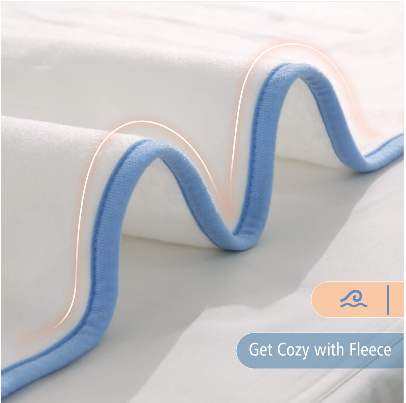
Image 1.2: A close-up view of the mattress pad's soft fleece material, highlighting its texture.