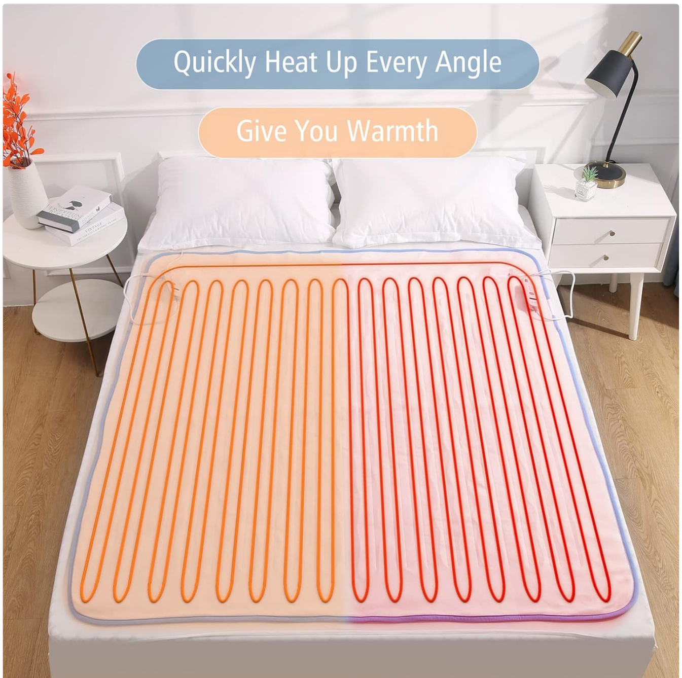
Image 5.2: A visual representation of the heating elements within the mattress pad, illustrating heat distribution.