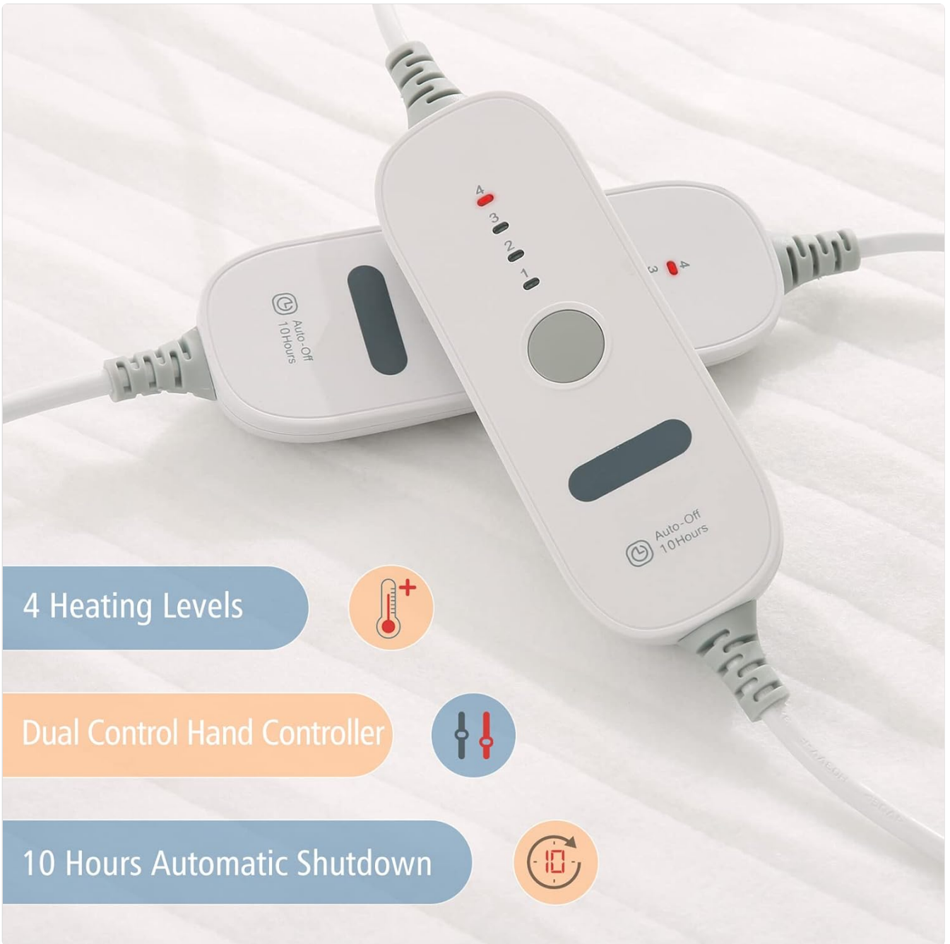
Image 5.1: The dual-hand controllers with indicators for 4 heating levels and a 10-hour automatic shutdown feature.