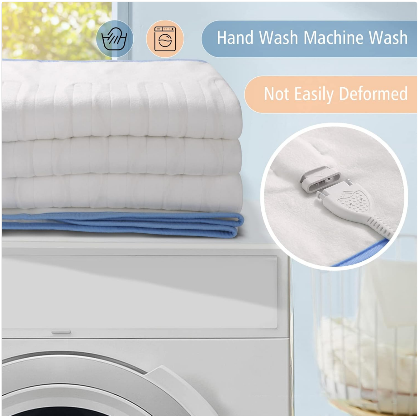
Image 6.1: The mattress pad folded, indicating its suitability for both hand and machine washing.