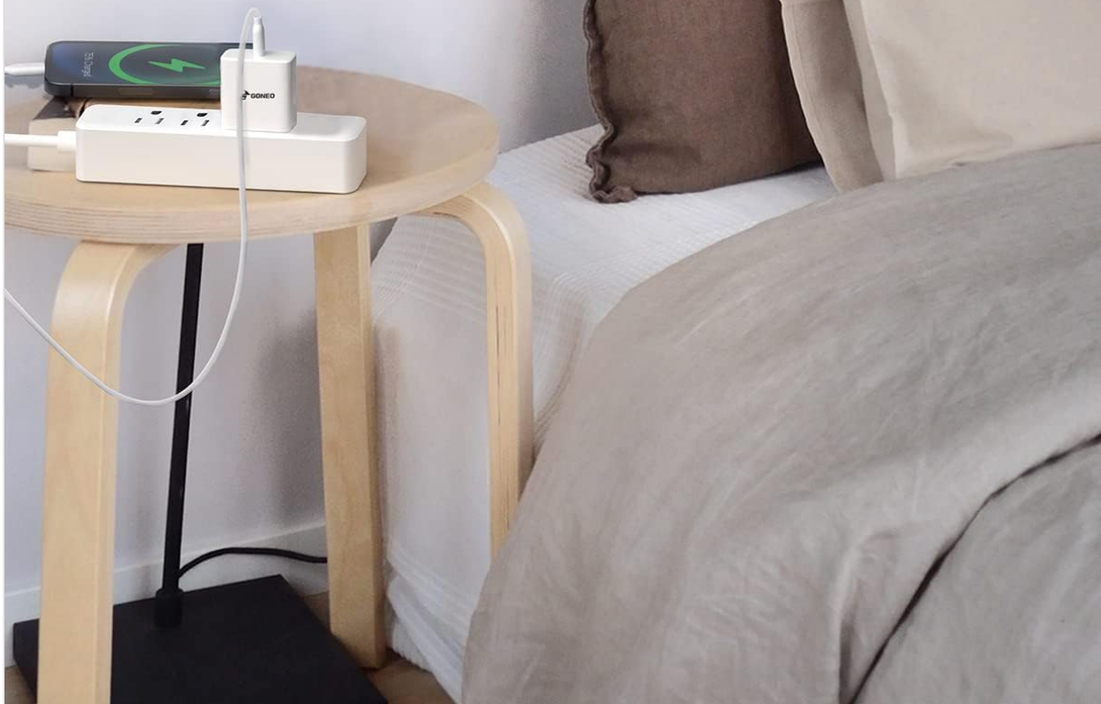
Image: The GONEO 20W USB Wall Charger connected to a power strip, actively charging a smartphone. This illustrates the charger's high-speed charging capability.

Integrated over-current, short-circuit, over-voltage