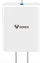
Image: This diagram highlights the wide compatibility of the GONEO 20W USB Wall Charger with various devices, including iPhones, AirPods, and iPads, when used with appropriate USB-C cables.