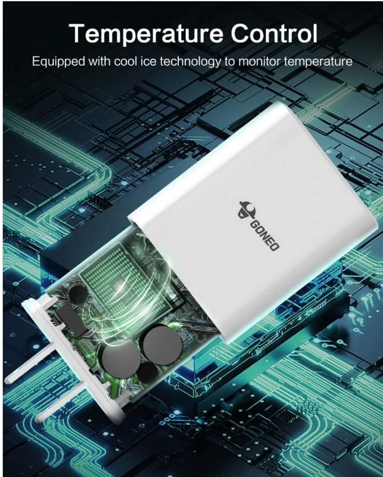
Image: An internal diagram of the GONEO charger, illustrating its advanced temperature control technology designed for safe and reliable operation.