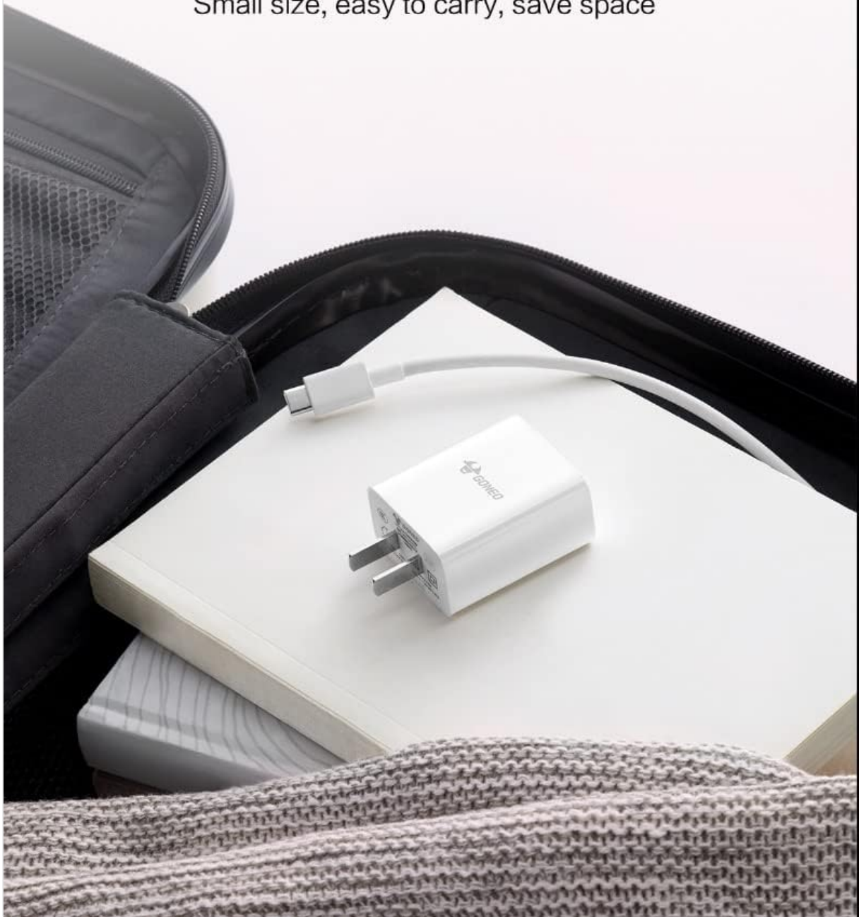
Image: The GONEO 20W USB Wall Charger shown in a travel-friendly context, highlighting its mini and compact design for easy portability.