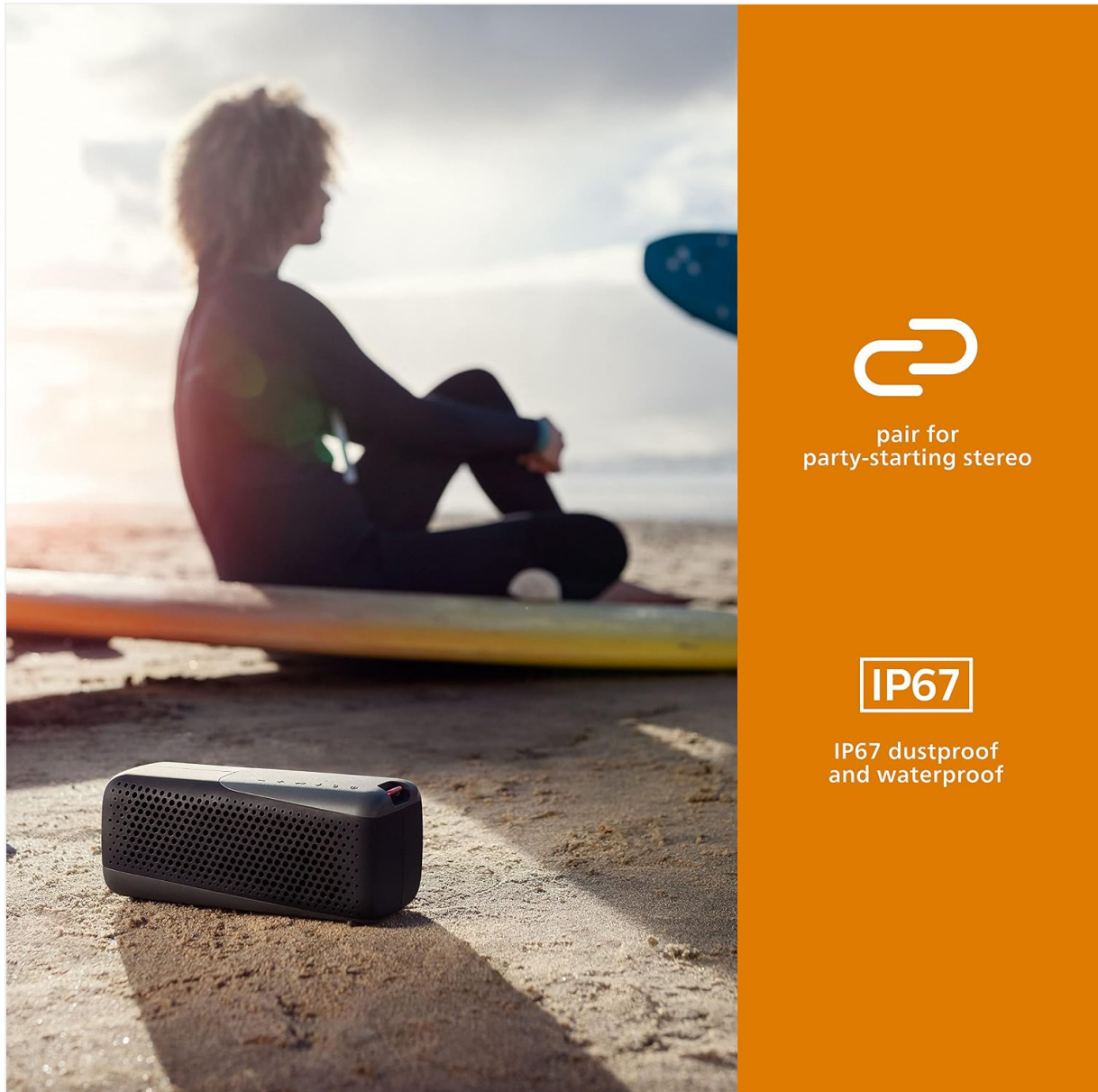
Image 5.1: The Philips S4807 speaker positioned on a sandy beach, illustrating its IP67 dustproof and waterproof capabilities.