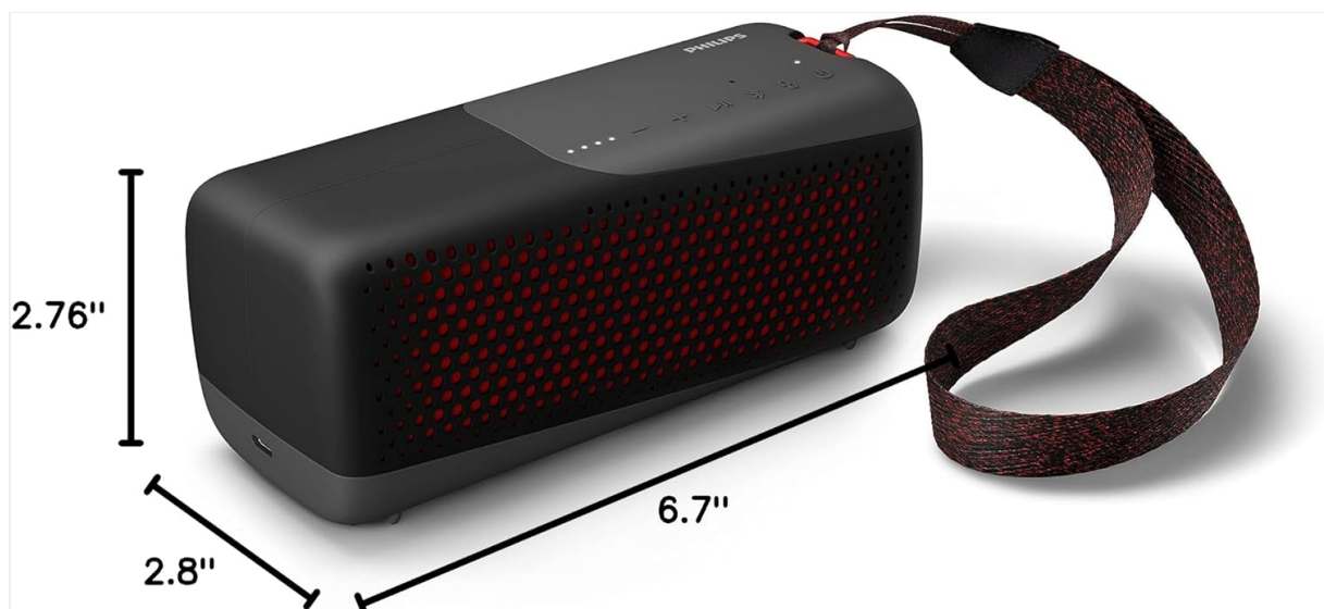
Image 7.1: Detailed view of the Philips S4807 speaker with its dimensions (length, width, height) clearly indicated.