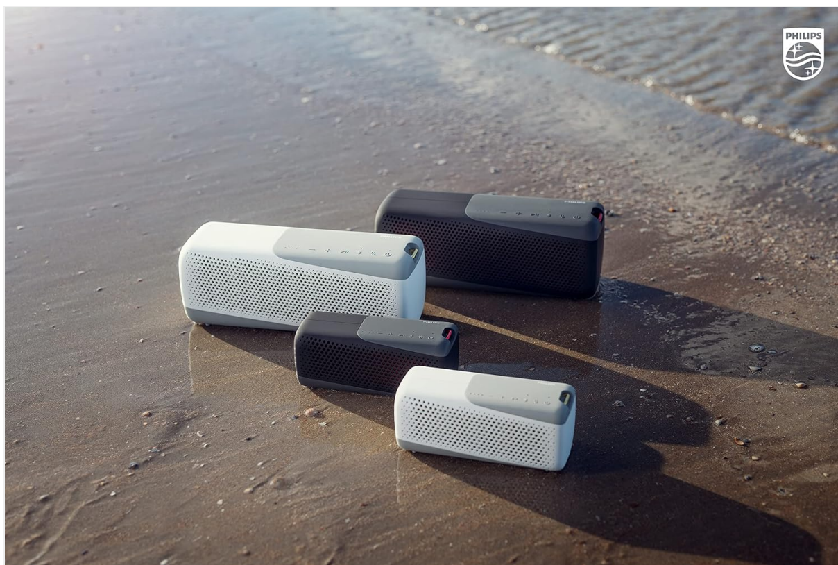
Image 4.2: Multiple Philips S4807 speakers arranged on a beach, demonstrating the stereo pairing feature for a wider soundstage.