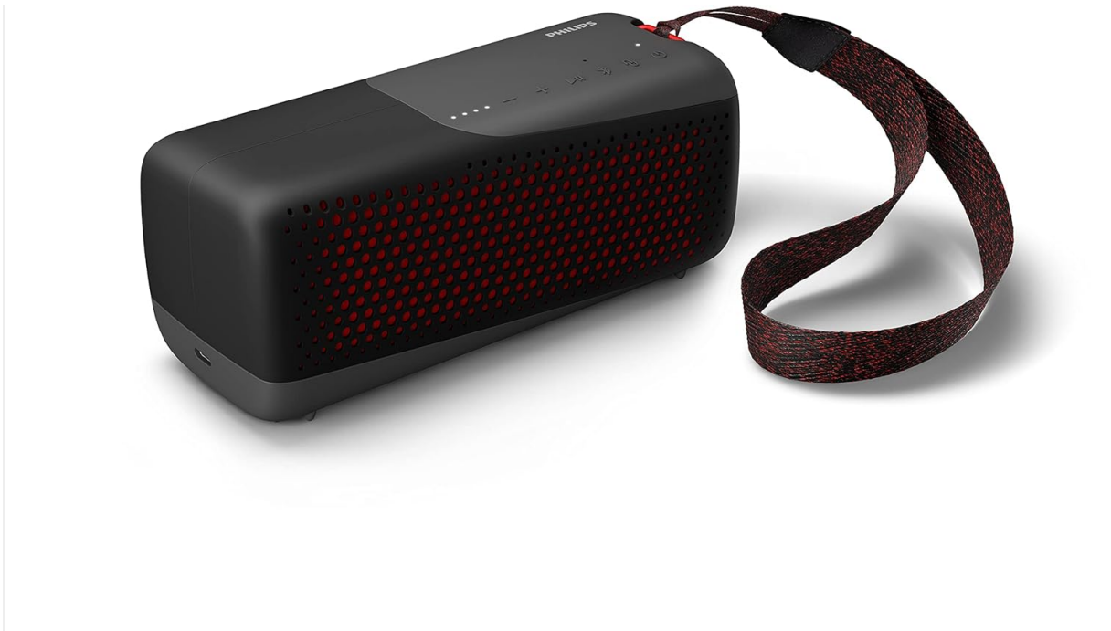
Image 1.1: Philips S4807 Wireless Bluetooth Speaker, showcasing its compact, rugged design with a lanyard strap.

The Philips S4807 is designed for portability and durability, featuring an IP67 waterproof and dustproof rating, Bluetooth multipoint connection, and stereo pairing capabilities.