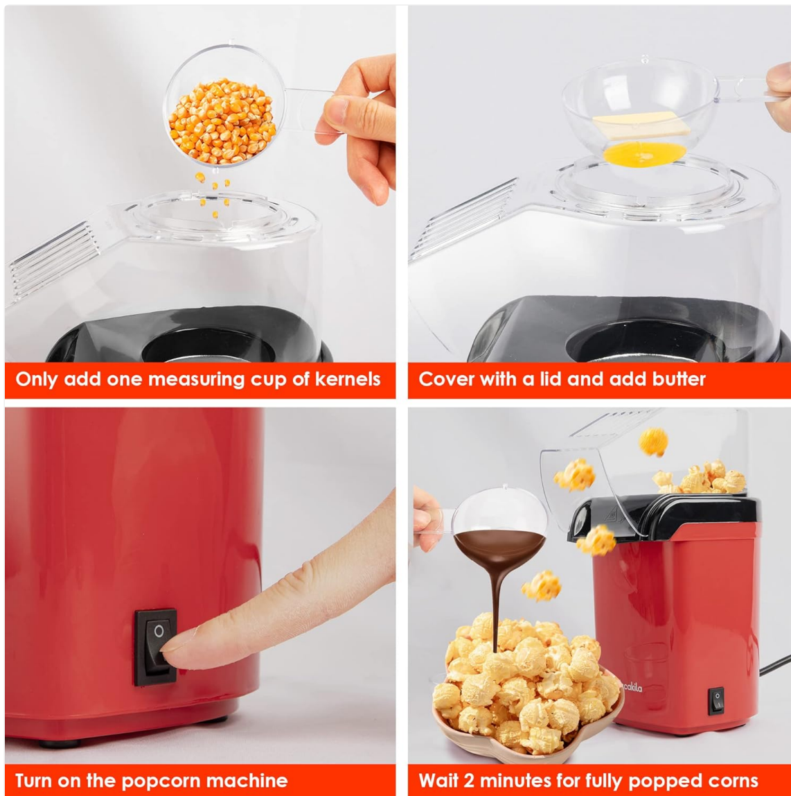
Image: Adding popcorn kernels to the popping chamber.