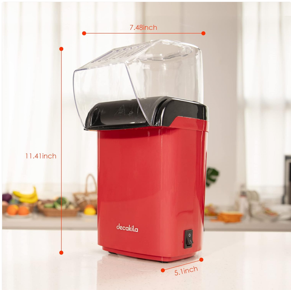
Image: Product dimensions for the DECAKILA Hot Air Popcorn Popper.