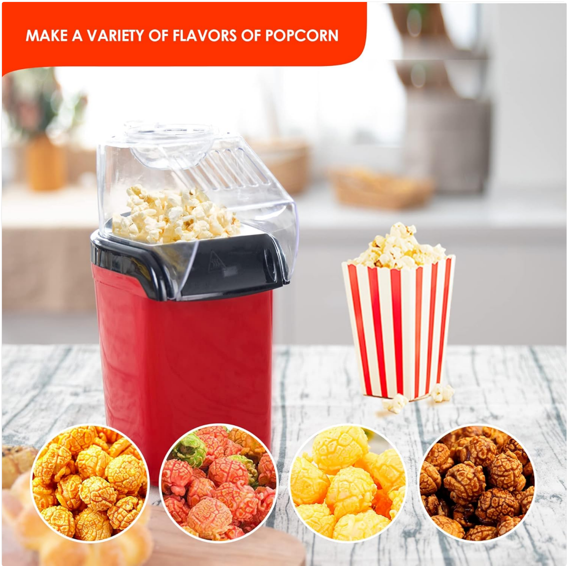
Image: Turning on the popcorn popper.