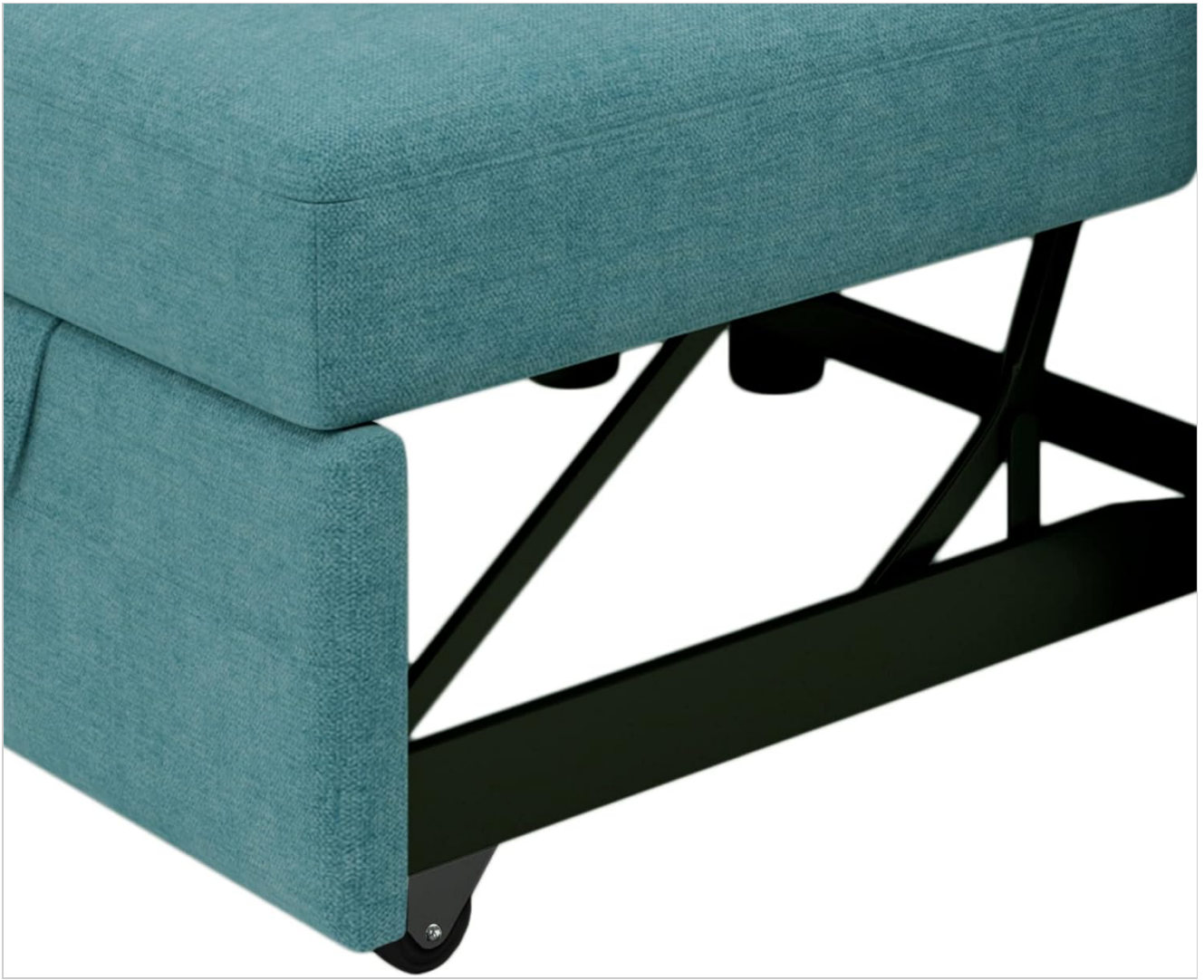
Image: A detailed view of the wheels located on the base of the pull-out section, which aid in the smooth conversion of the chair.