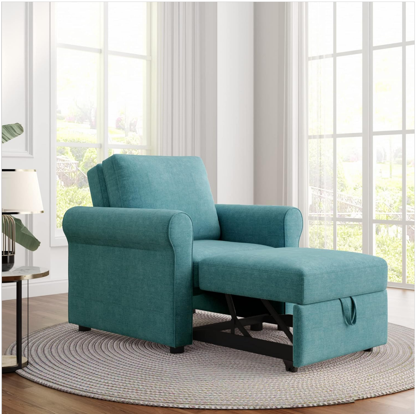
Image: The Polibi 3-in-1 Sofa Bed Chair in its lounger position, demonstrating its appearance after initial setup.