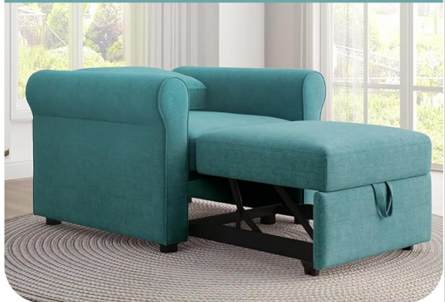
Image: A composite image demonstrating the Polibi 3-in-1 Sofa Bed Chair in its three distinct modes: a compact seat, an extended recliner, and a fully flat bed.