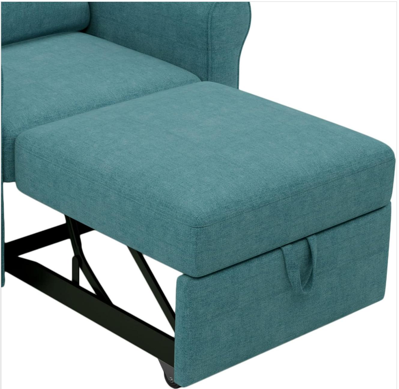
Image: A close-up of the pull-out section, highlighting the handle used to extend the chair into a lounger or bed.