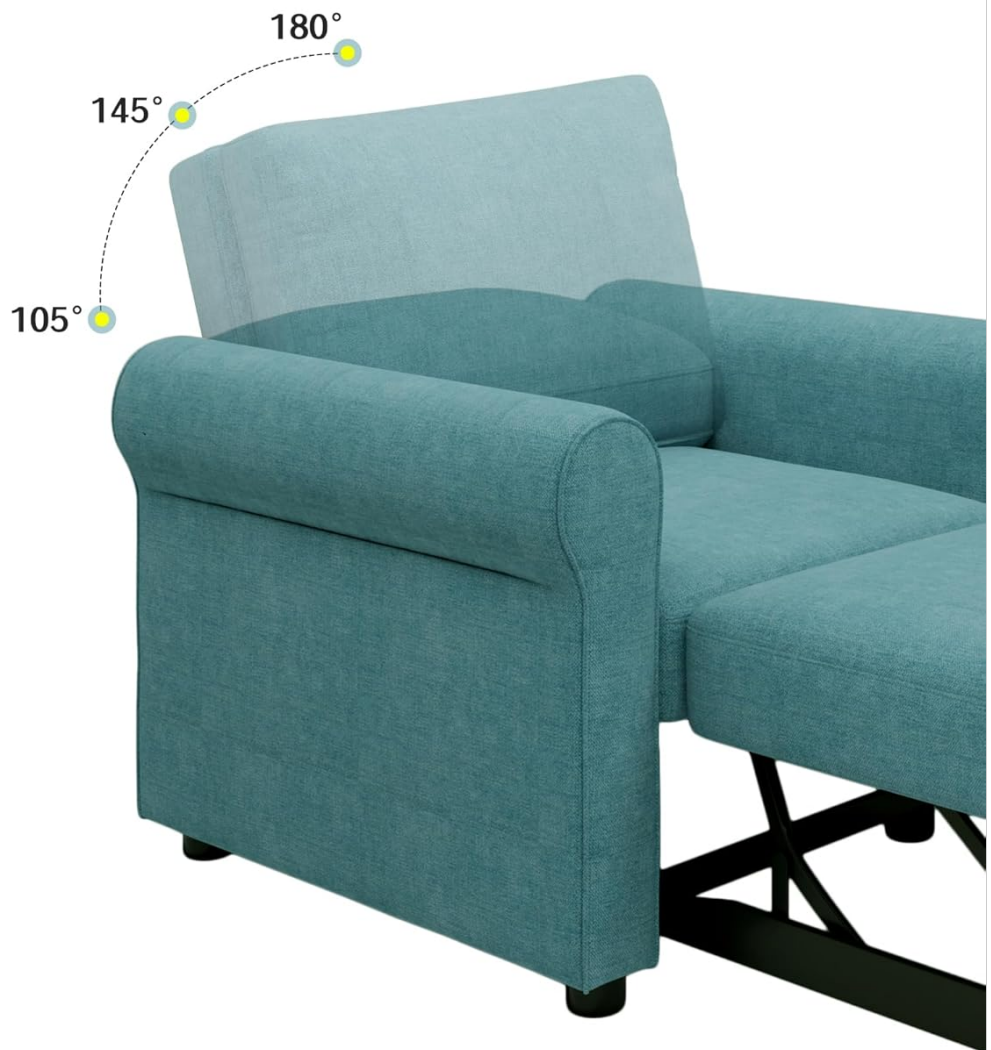
Image: Visual representation of the three adjustable backrest positions, indicating their typical uses.