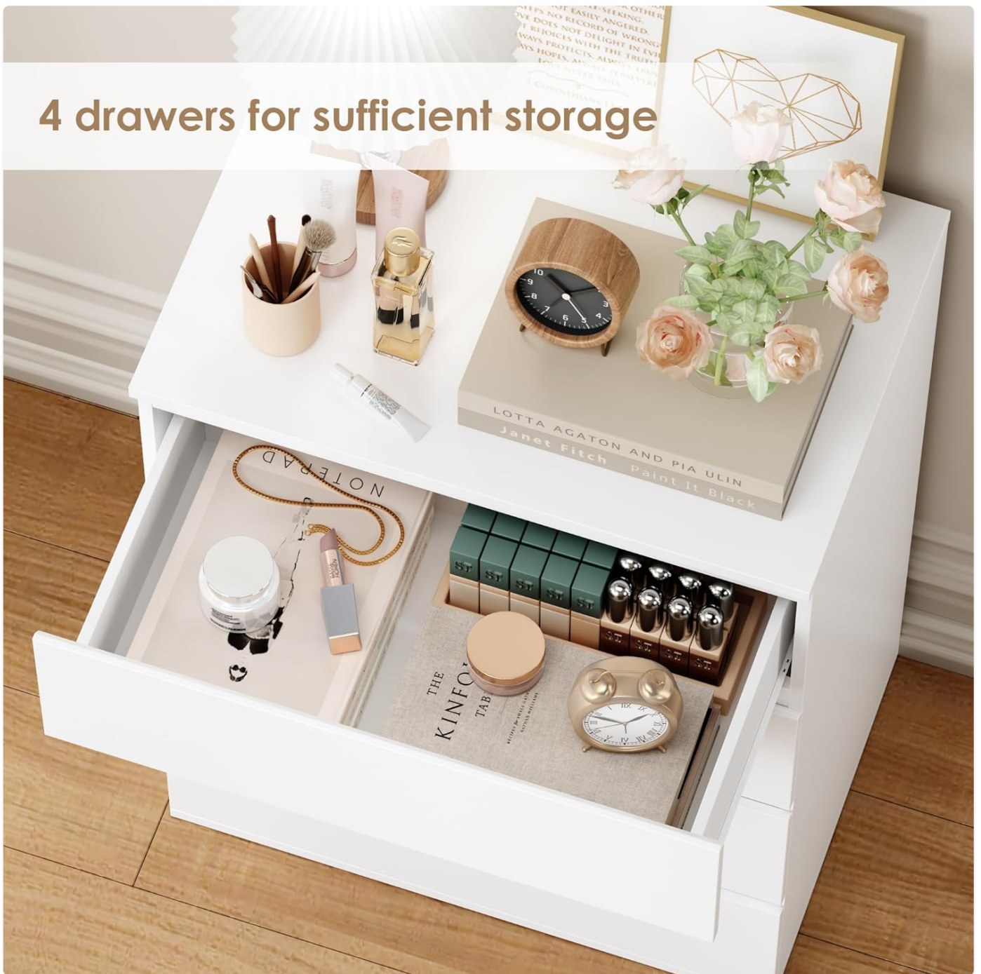
Figure 4: Example of drawer storage capacity.

Utilize the spacious drawers to keep your belongings organized and your living space tidy.