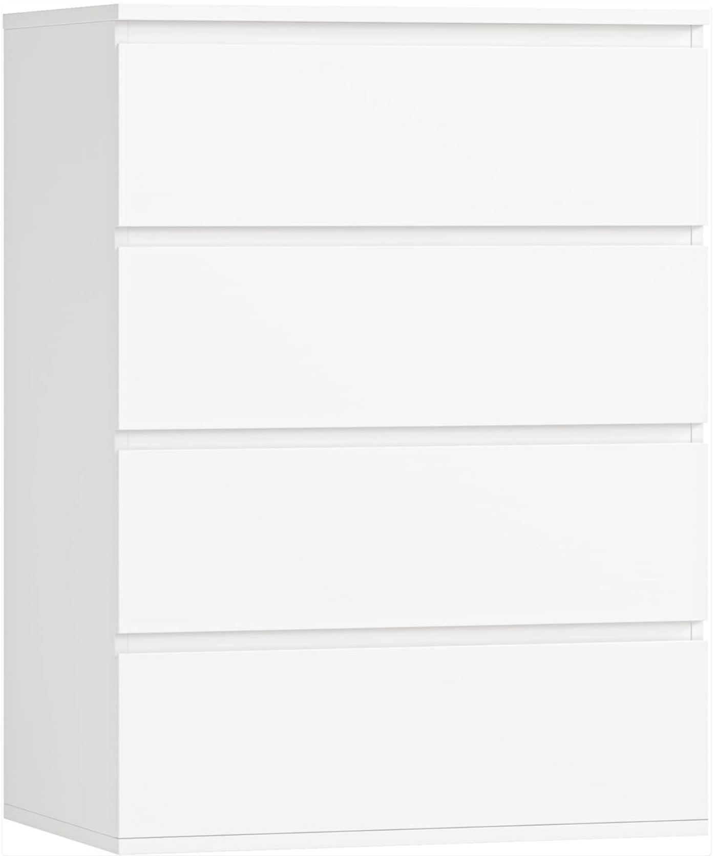
Figure 1: FOTOSOK 4-Drawer Dresser (White)

The FOTOSOK 4-Drawer Dresser is designed for modern living spaces, offering ample storage with a minimalist aesthetic. Its compact size makes it suitable for various rooms, including bedrooms, hallways, living rooms, and home offices.