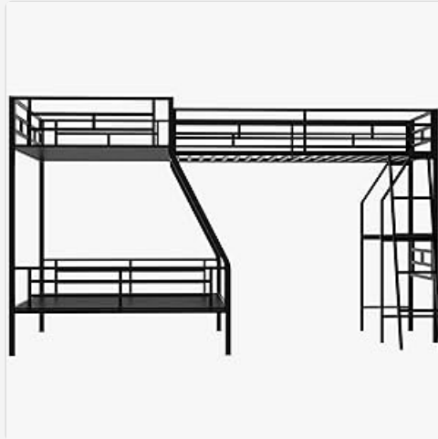
Image 3.2: Detail of the integrated desk area and one of the access ladders.