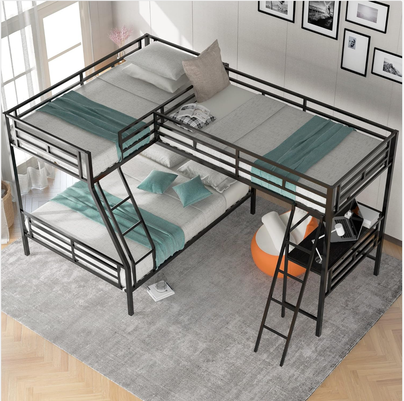
Image 3.1: Top-down view illustrating the L-shaped configuration of the bunk bed, showing the twin upper, full lower, and loft beds.

The Merax L-Shaped Bunk Bed is designed to maximize space with its unique configuration. It includes a twin-sized upper bunk, a full-sized lower bunk, and an integrated loft area with a desk, all constructed from durable metal.