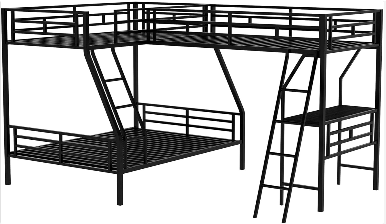
Image 4.1: Side view of the bunk bed frame, illustrating the metal structure and connection points for assembly.