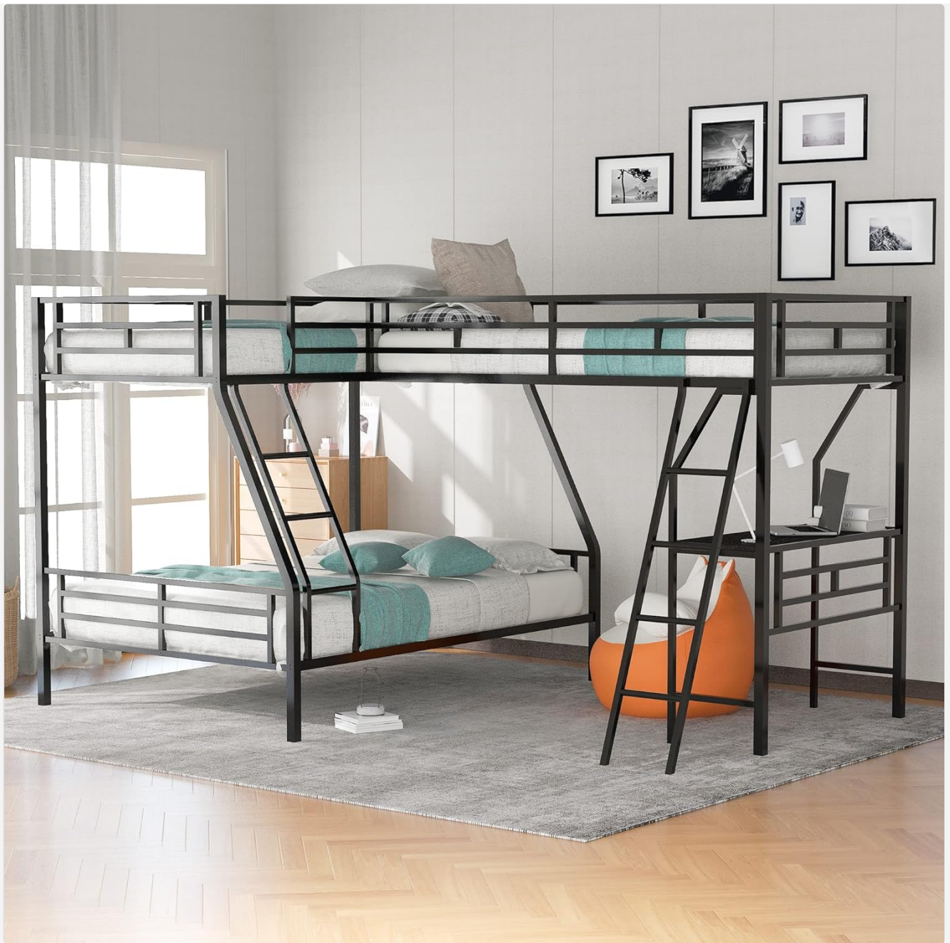
Image 1.1: Overall view of the Merax Metal L-Shaped Bunk Bed with a loft and desk.