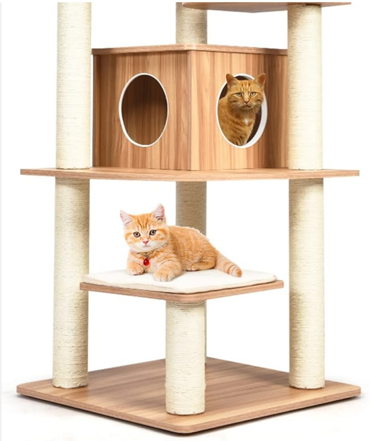
Image 1.1: The PETSITE Tall Cat Tree, showcasing its multi-level design and various features for feline activity.