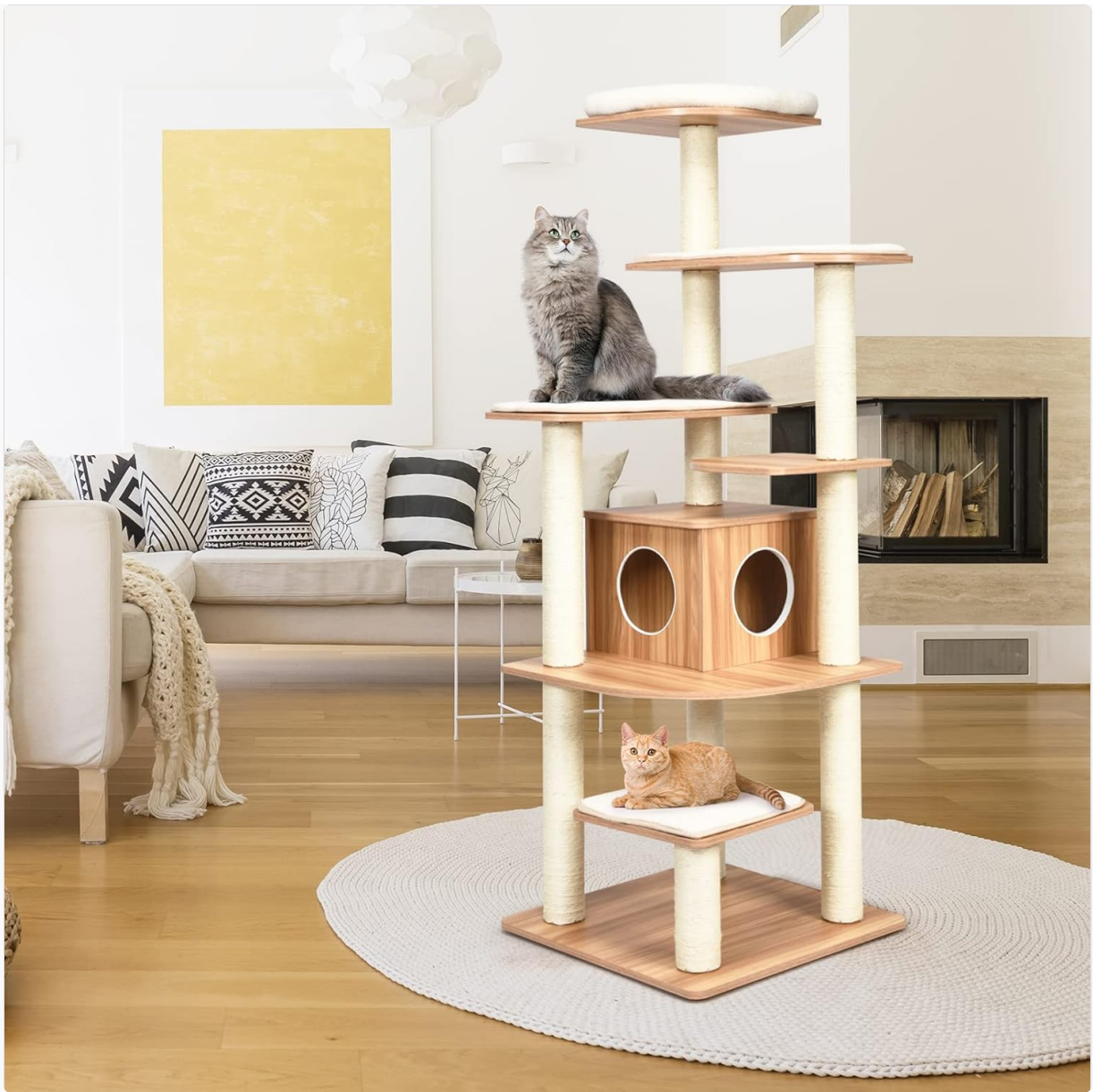
Image 6.1: The plush perch with a cat resting, and an array of removable cushions, highlighting their ease of cleaning.