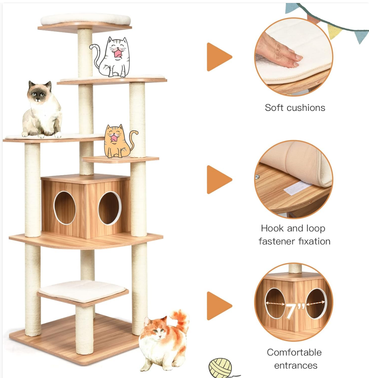
Image 5.2: A cat utilizing the sisal scratching post, demonstrating the product's feature for satisfying natural feline instincts and protecting furniture.