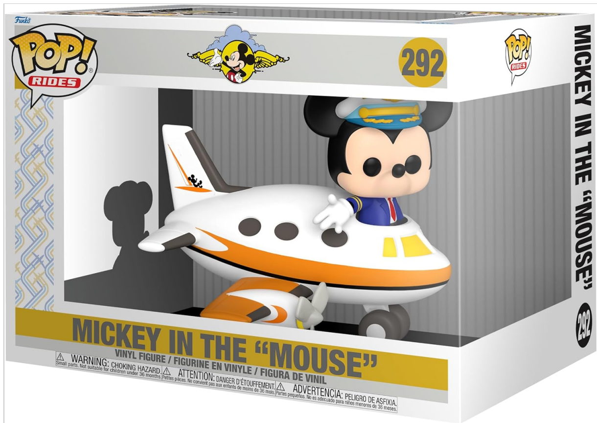
Image 1.1: The Funko Pop! Ride collectible figure, Pilot Mickey Mouse in Walt's Plane 'The Mouse', shown within its original packaging.