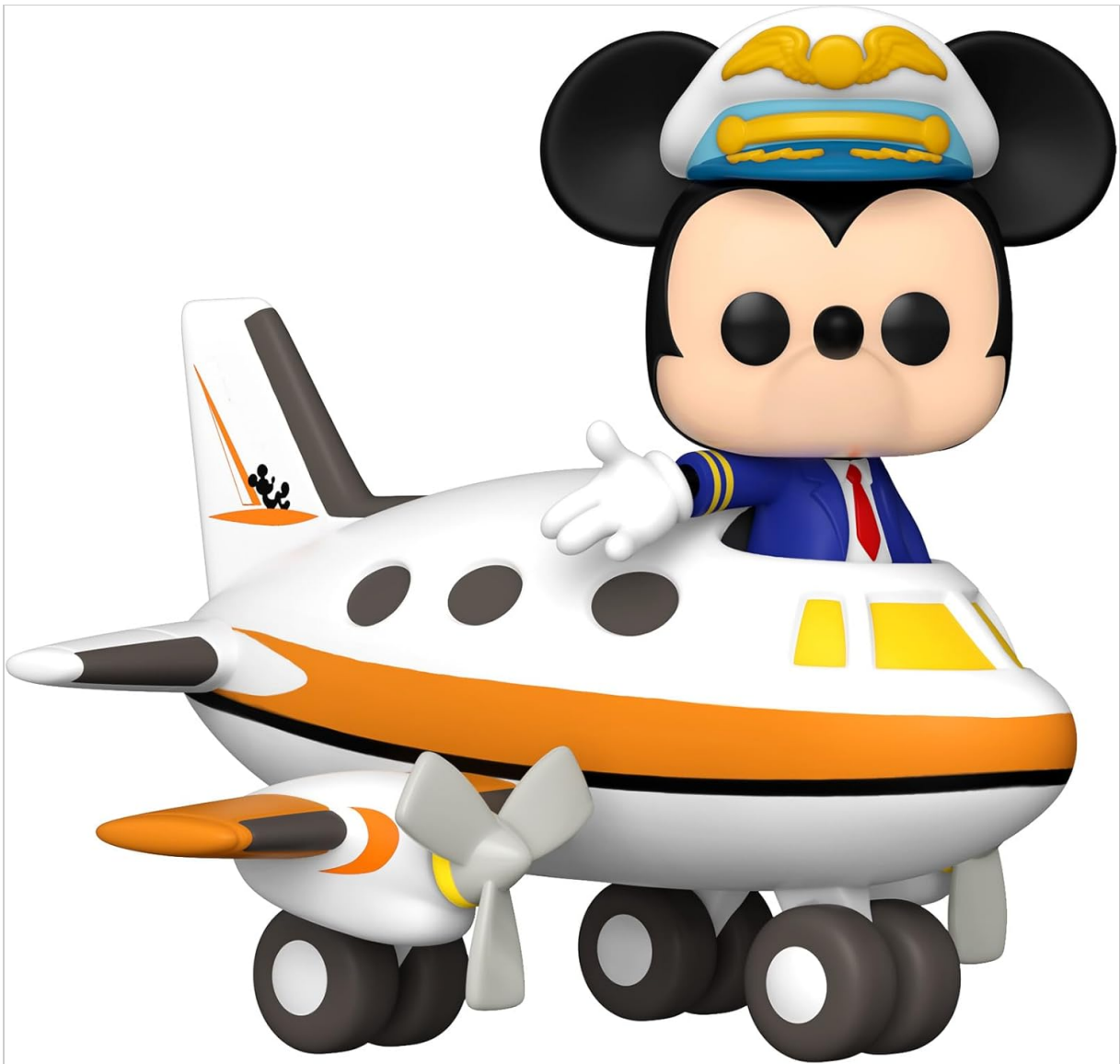
Image 3.1: The collectible figure removed from its packaging, ready for display.