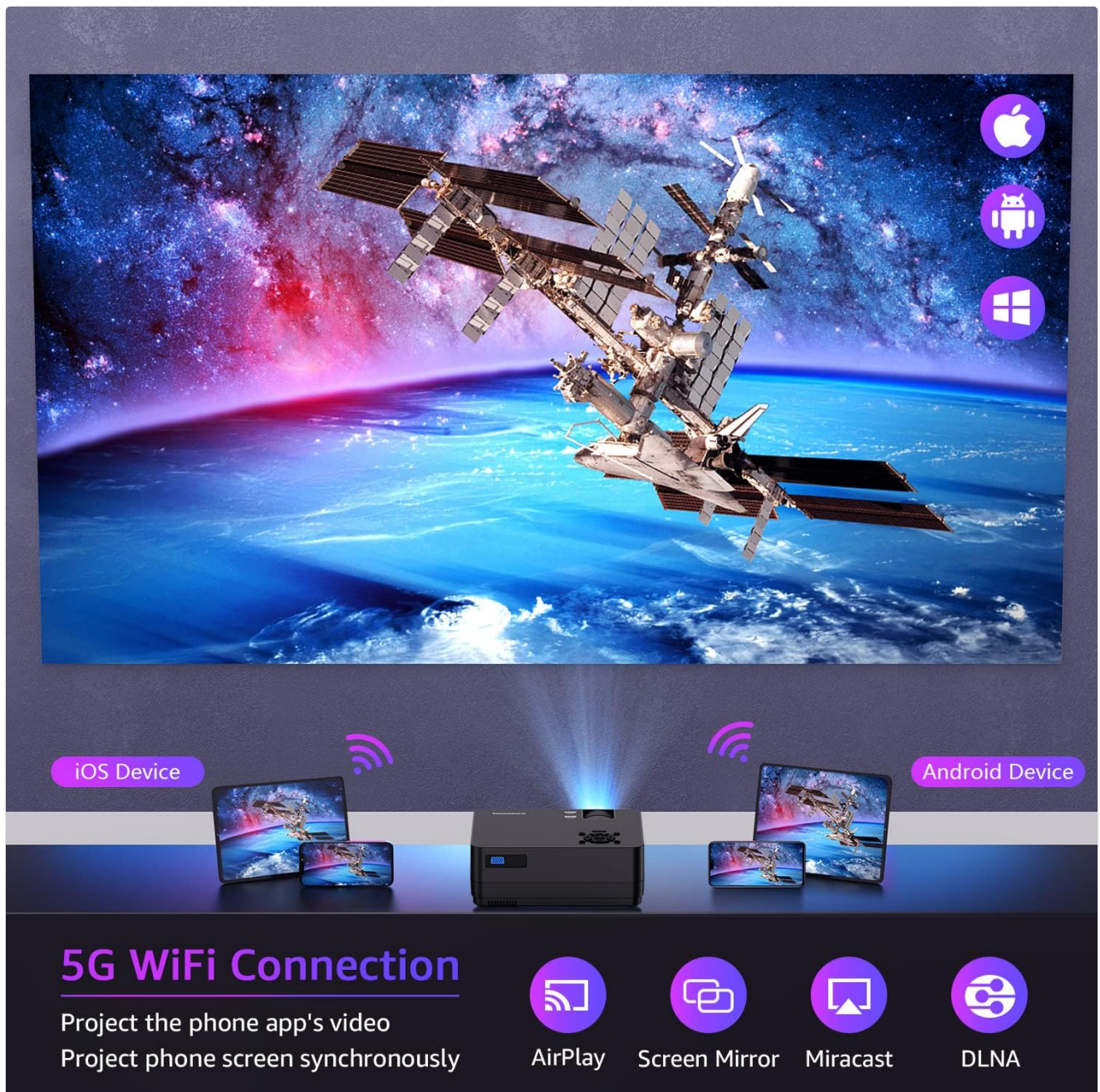
Figure 4.2: Wireless screen mirroring setup for iOS and Android devices.

Note: Due to HDCP copyright issues, streaming services like Netflix, Disney+, and Hulu often prohibit direct mirroring from mobile devices. For these services, it is recommended to use a TV Stick (not included) connected to the projector's HDMI port.