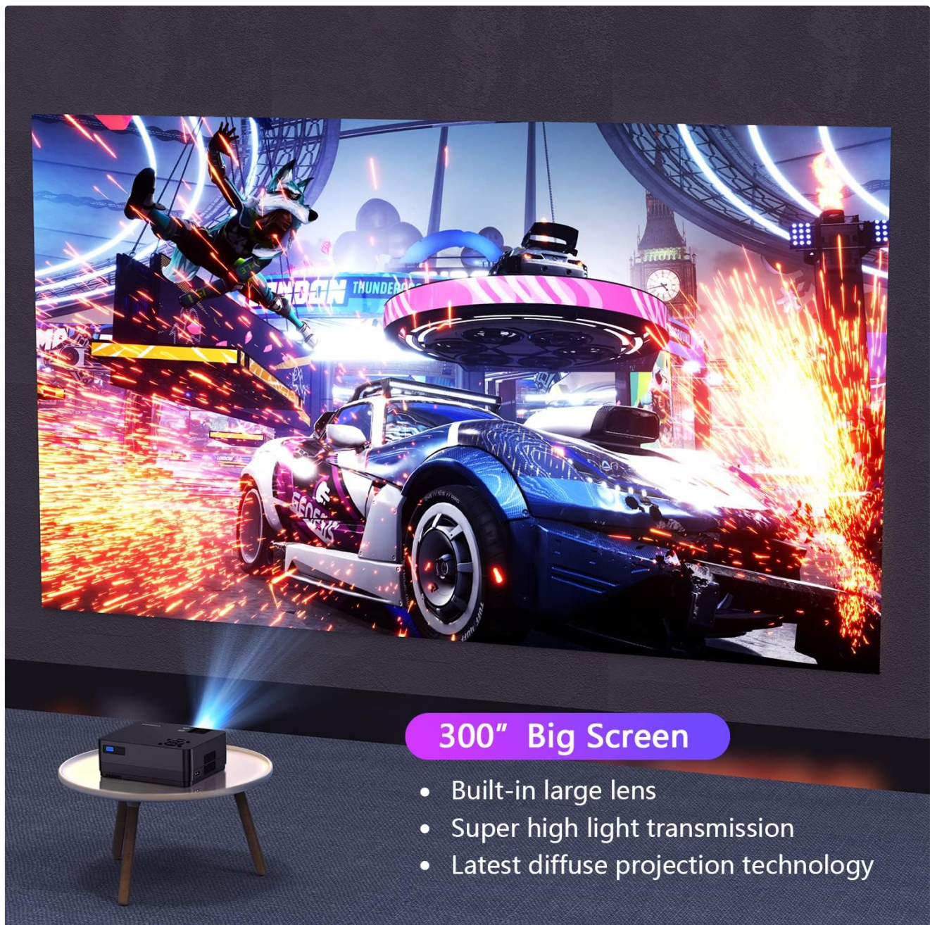
Figure 3.2: The projector is capable of producing a large 300-inch display.