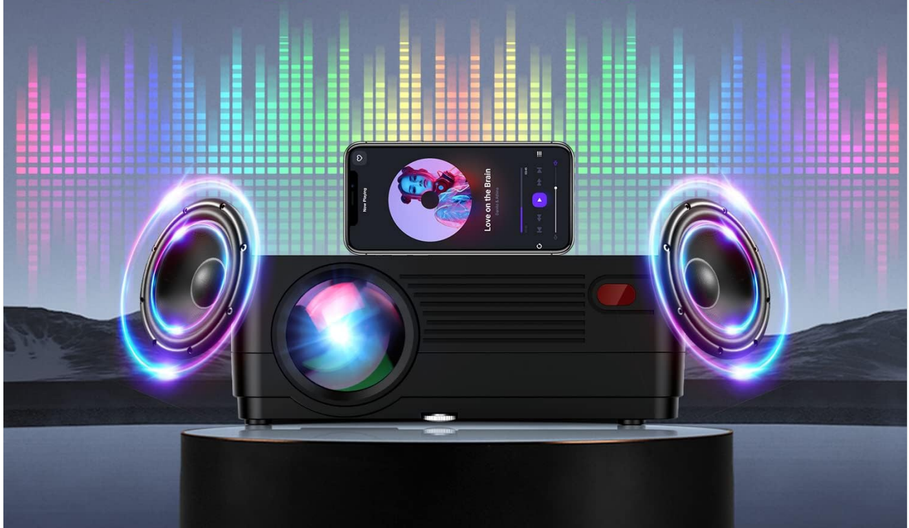
Figure 4.4: Two-way Bluetooth 5.0 capabilities.