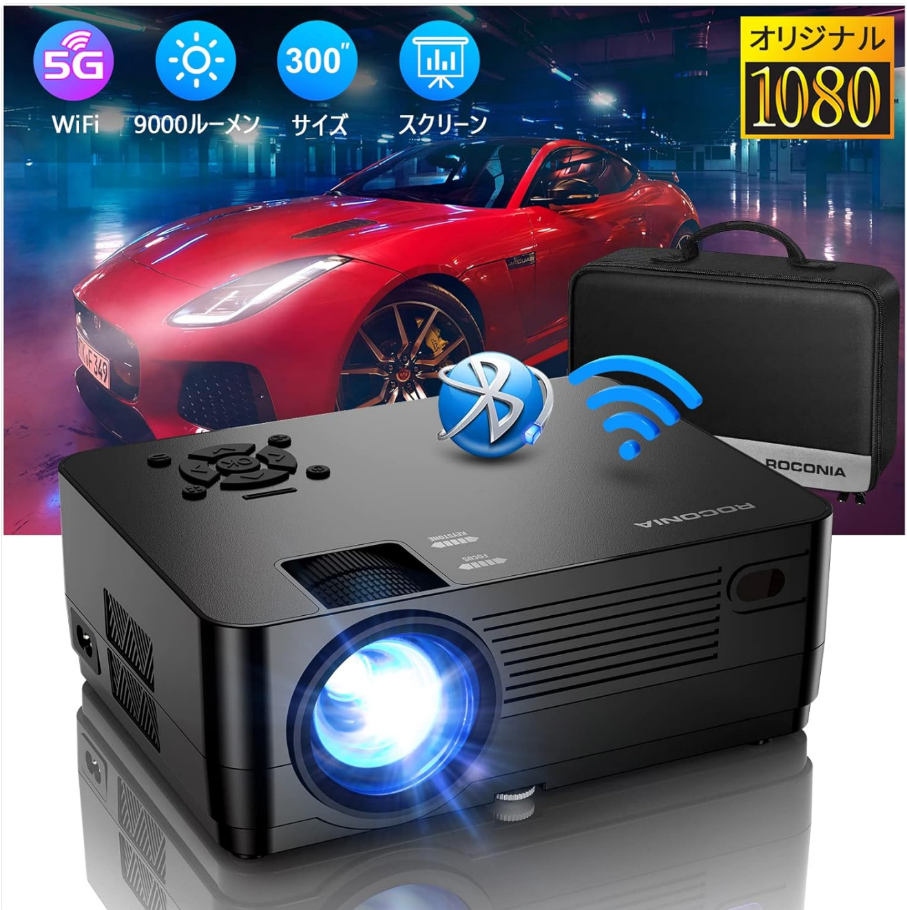
Figure 1.1: Roconia Q602 1080P Projector and accessories.