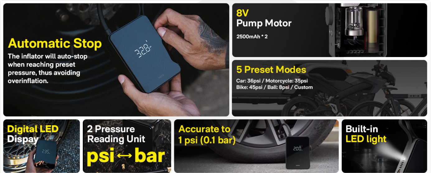
Image: The inflator in use, demonstrating its automatic stop feature when the preset pressure is reached.