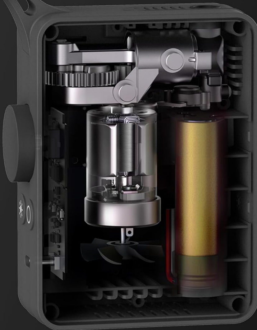
Image: Internal view highlighting the 2500 mAh high-capacity battery.

Fully charged in 3.5 hours, it can inflate 6.8 tires* from 28-35psi *205/55 R16