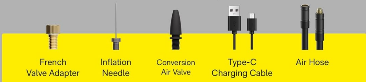
Image: The inflator with its various accessories, including the USB-C cable and different nozzles.