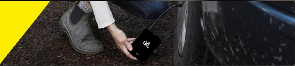
Image: Display illustrating the various preset modes for different inflation needs.