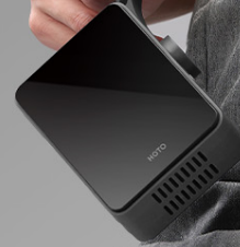
Image: Close-up of the rotational knob for easy pressure adjustment.