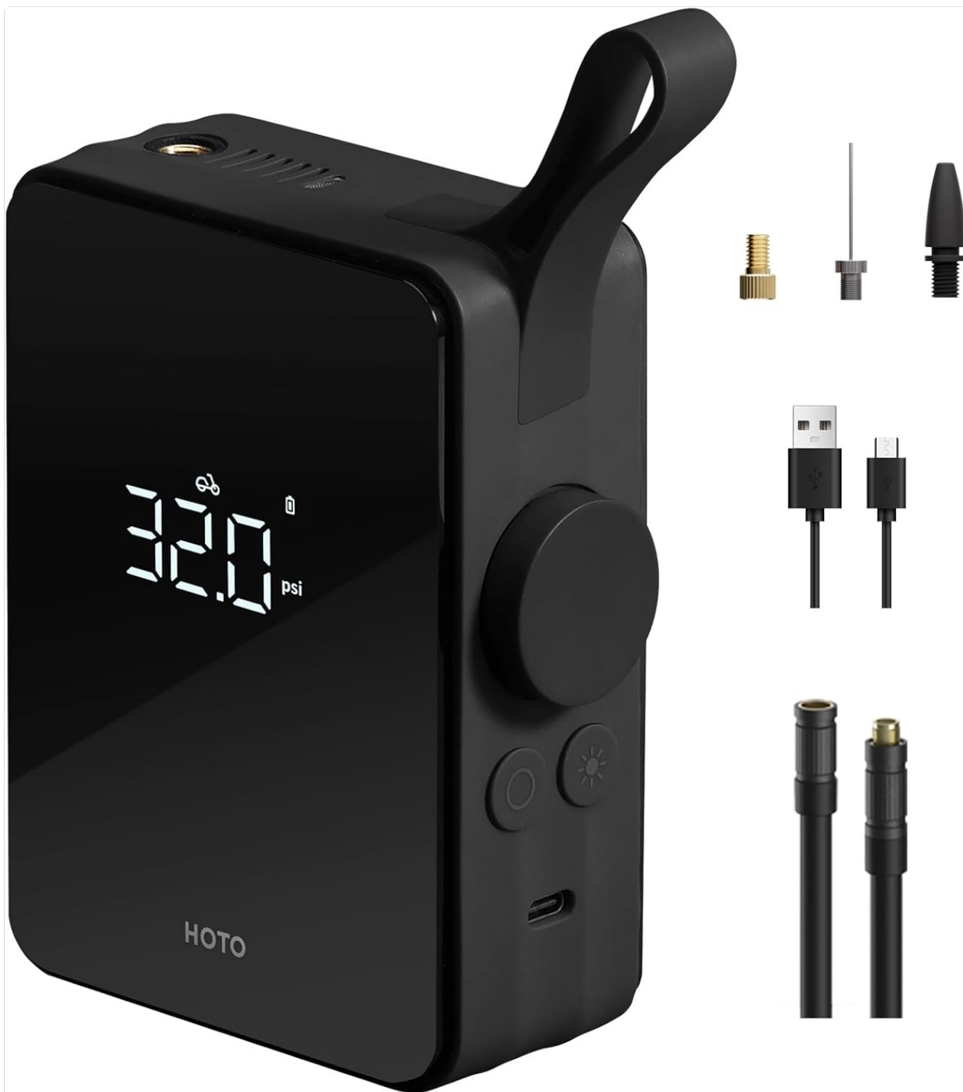
Image: The HOTO Portable Tire Inflator shown with its various inflation accessories, including different nozzles and a charging cable.