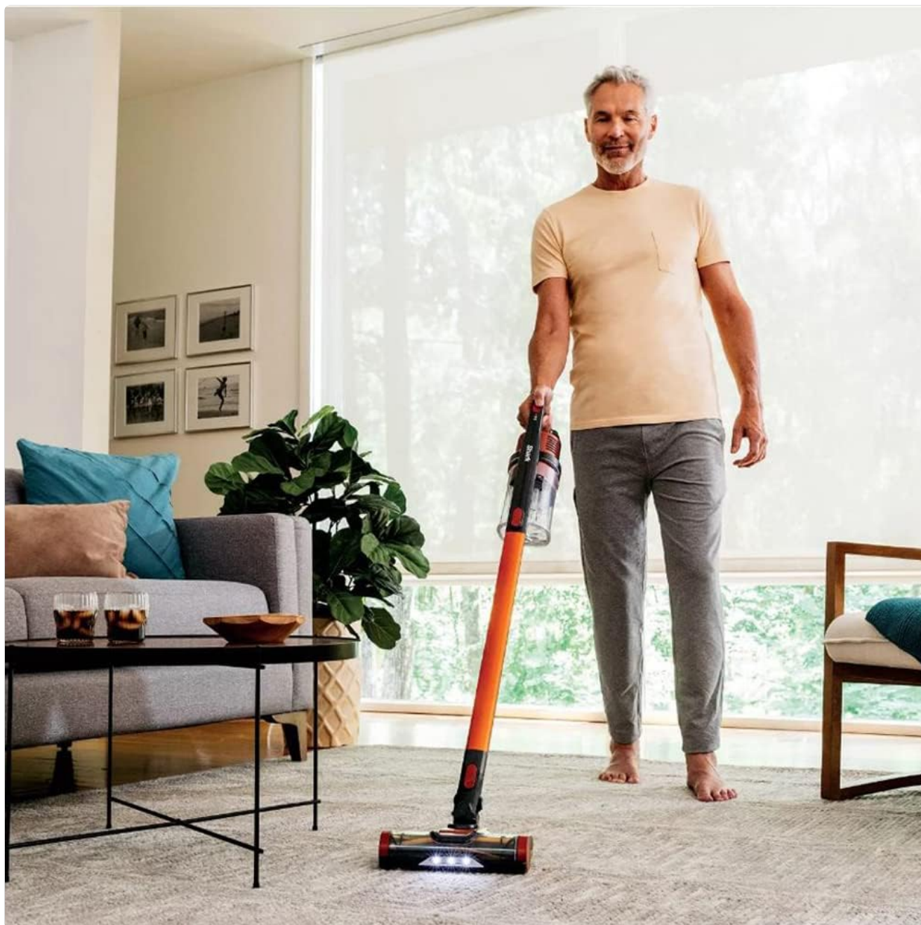
Figure 3: The MultiFLEX wand bends to easily clean under low-lying furniture.

The MultiFLEX wand allows the vacuum to bend, making it easy to clean under furniture without bending over. It also folds for compact, self-standing storage, saving space when not in use.