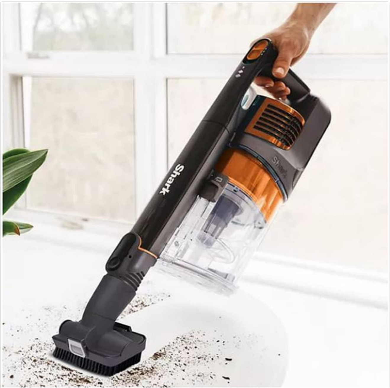
Figure 4: Handheld mode with a brush attachment, perfect for detailed cleaning.