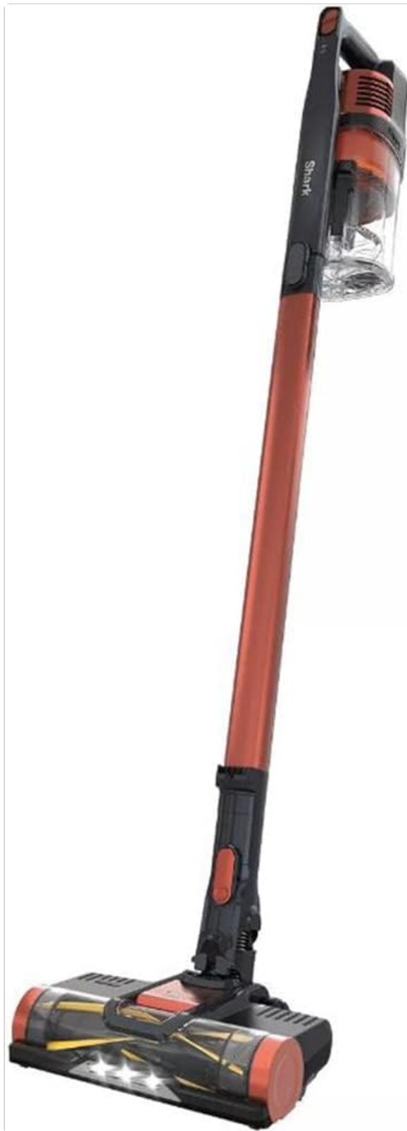
Figure 2: Angled view of the vacuum, highlighting its sleek design and maneuverability.