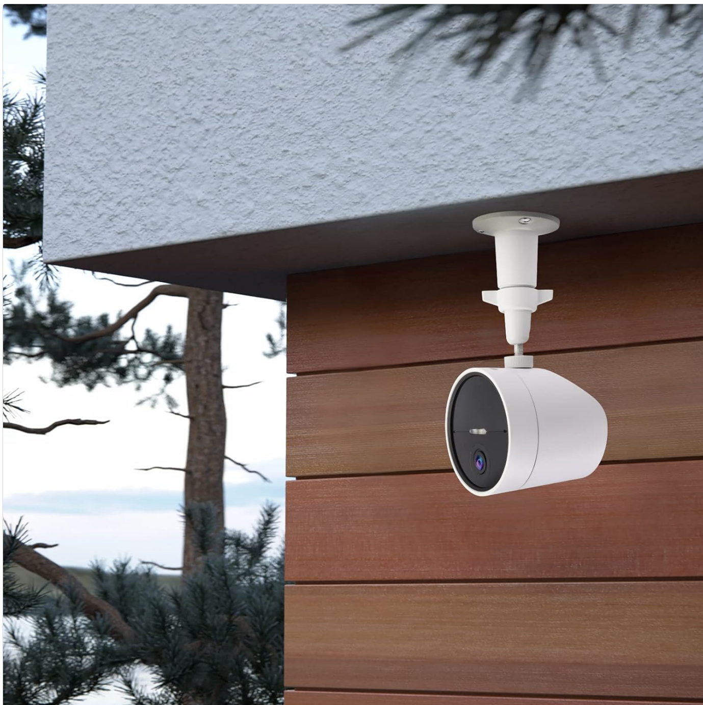
Figure 4: Example of the camera mounted on a ceiling.