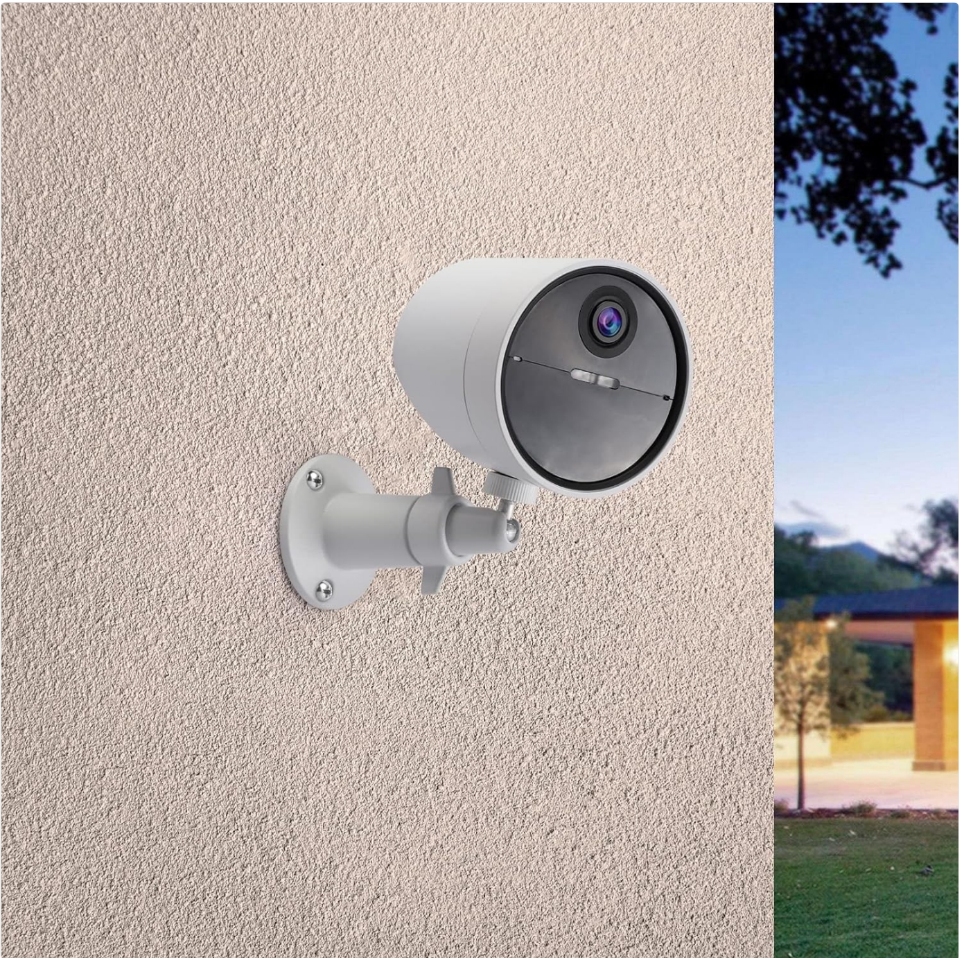
Figure 3: Example of the camera mounted on a wall.