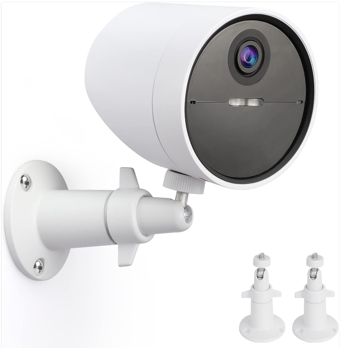
Figure 5: The mount's adjustable ball head allows for precise camera positioning.