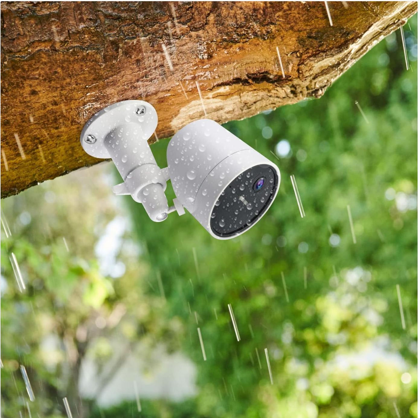
Figure 6: The mount is designed to withstand outdoor elements.