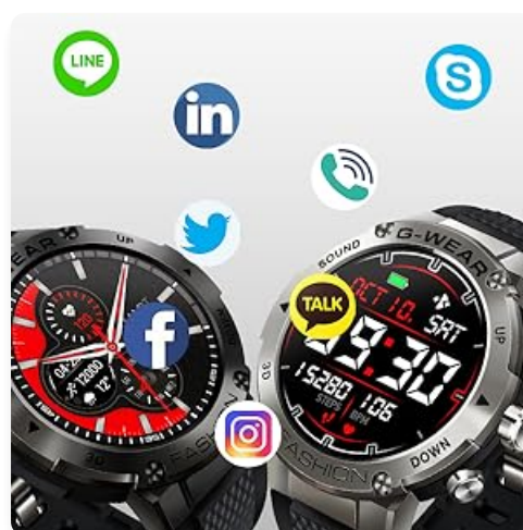
Image 4.1: The smartwatch monitoring heart rate and blood pressure during exercise.