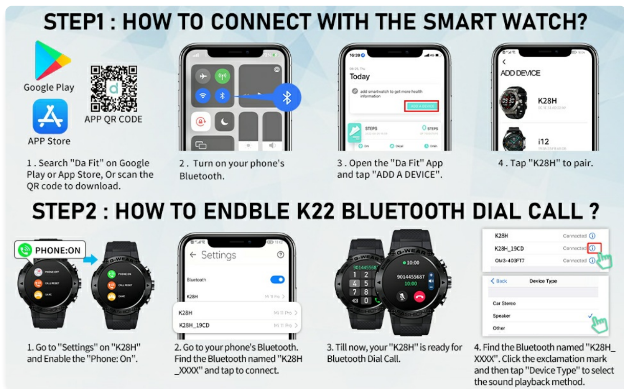
Image 3.1: Visual guide for connecting the smartwatch and enabling Bluetooth call functionality.