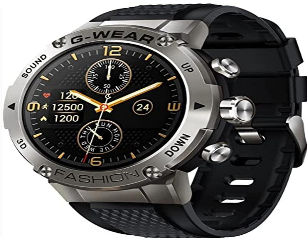
Image 1.1: The GUCABE K28N Smartwatch, featuring a silver bezel and black silicone strap.

The GUCABE K28N Smartwatch is a robust and versatile wearable device designed for active lifestyles. It features comprehensive health monitoring, multiple sports modes, Bluetooth calling capabilities, and smart notifications, all housed in a durable, military-grade waterproof design.