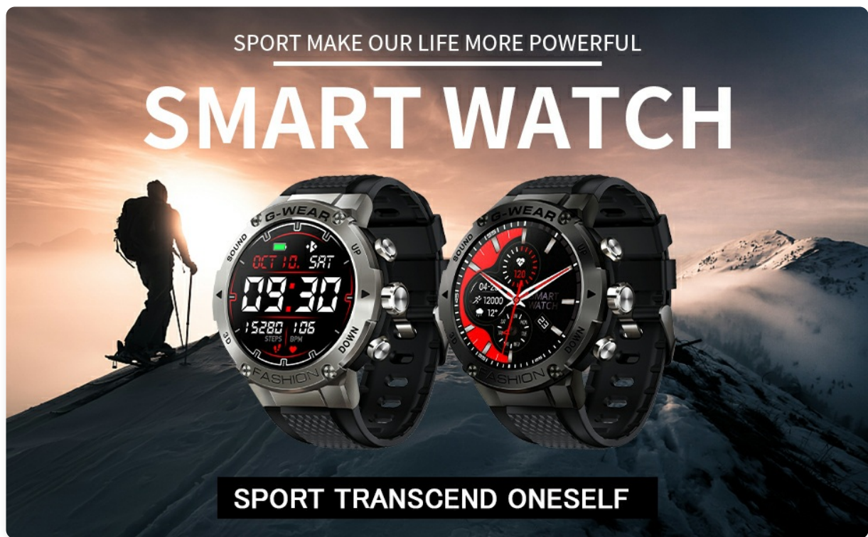
Image 1.2: GUCABE Smartwatches in silver and black, highlighting their suitability for outdoor activities.