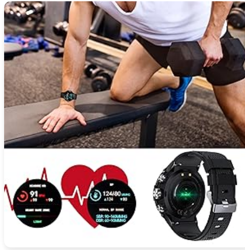
Image 2.1: Visual representation of the smartwatch's health and activity tracking features.