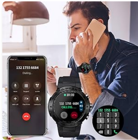
Image 4.4: The smartwatch's call interface, showing incoming call details and a dial pad.

other notifications. You can view the message content on the watch screen.