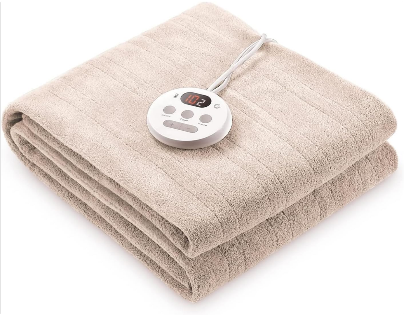
Image 1.1: The CURECURE Heated Mattress Pad, folded to show its soft coral fleece material and the attached manual controller.