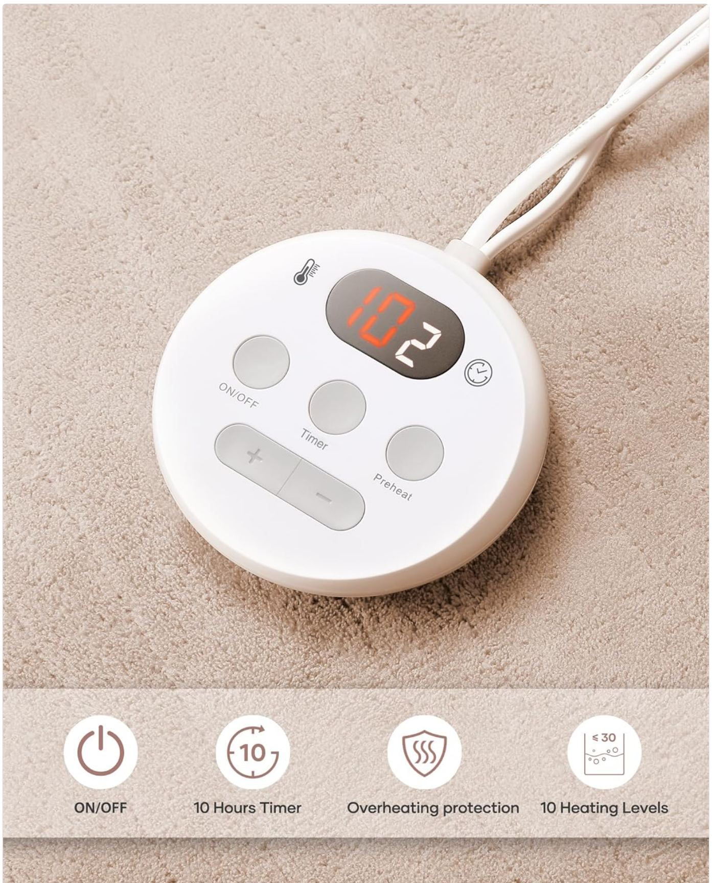
Image 3.1: A detailed view of the intelligent manual controller, showing the ON/OFF, Timer, Plus (+), Minus (-), and Preheat buttons, along with the digital display.