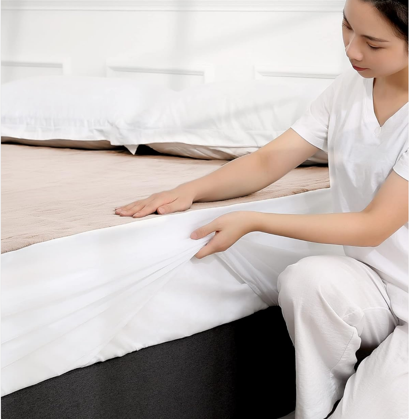
Image 4.2: Demonstrates the deep pocket design, showing how the elasticized fabric securely wraps around the mattress for a non-slip fit.

The Heated Mattress Wraps Your Original Mattress and Will does not Slip During Sleep