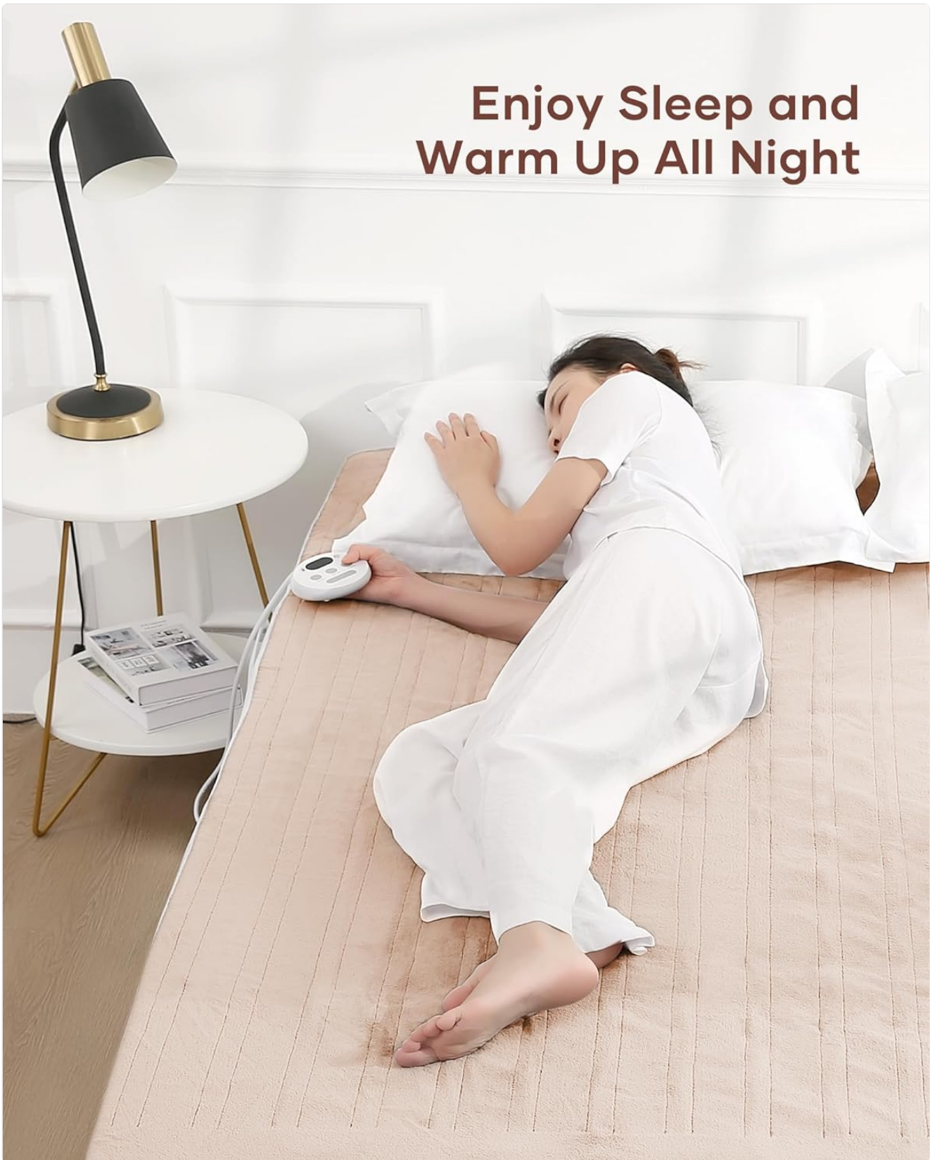
Image 4.1: The Twin size heated mattress pad laid out flat on a bed, illustrating its dimensions and proper placement.