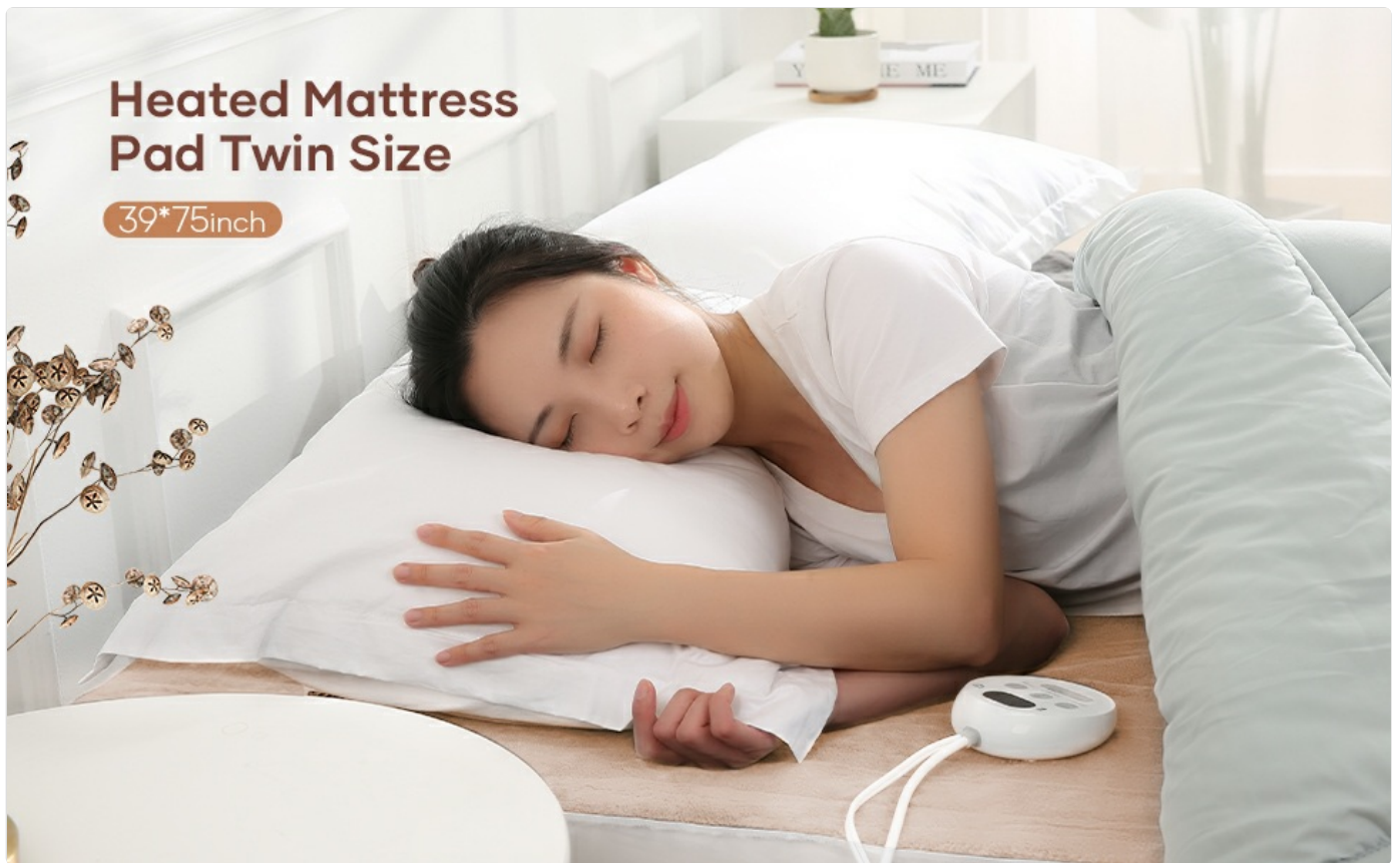
Image 5.1: A person enjoying a comfortable sleep on the heated mattress pad, illustrating its purpose of providing warmth throughout the night.