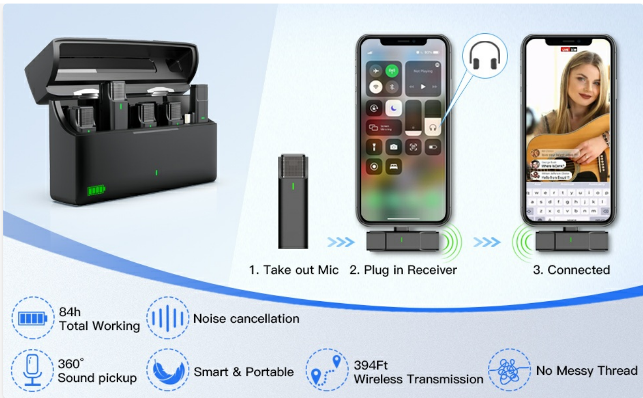
Image: Step-by-step illustration of the connection process, from removing the microphone to plugging in the receiver and achieving a connected state.