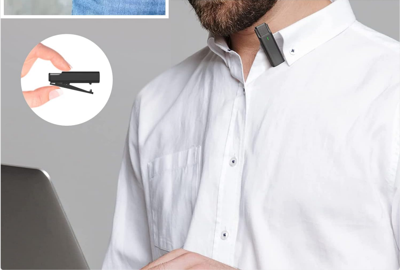
Image: The microphone's smart and mini design, illustrating its portability and how it can be easily clipped onto clothing for discreet use.