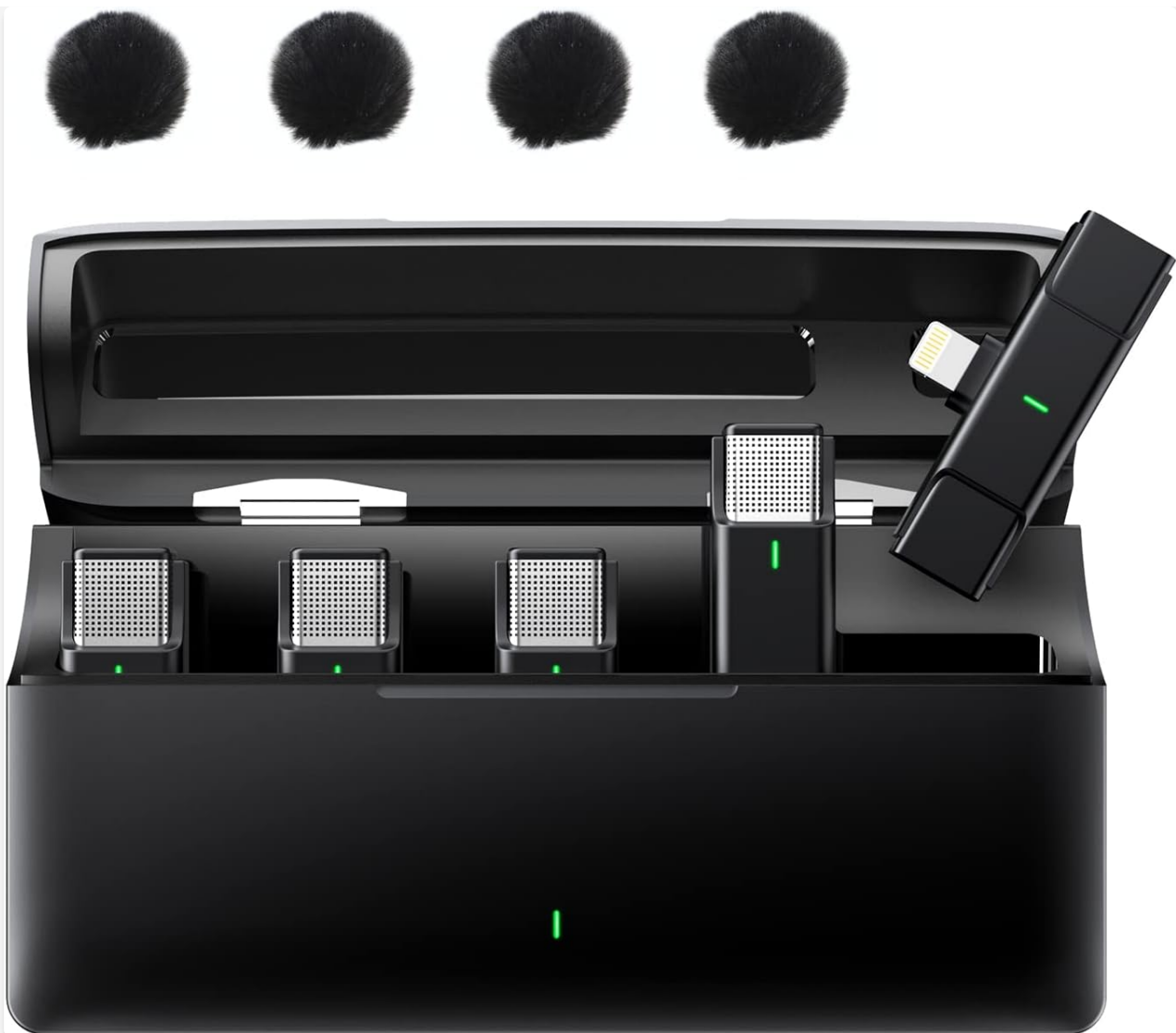
Image: The complete JOSTART mic04 package, including four lavalier microphones, the lightning receiver, the charging case, and four windproof wool covers.