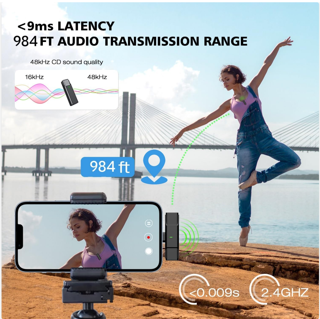
Image: Illustration of the microphone's extensive wireless transmission range and high-quality audio capabilities.