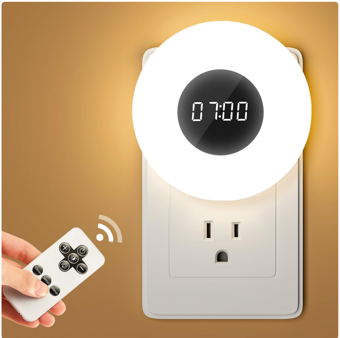
Image: The One Fire Bathroom Clock Night Light, showing its digital clock display and the accompanying remote control.