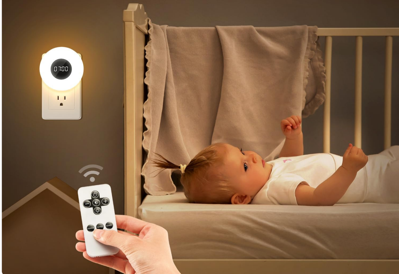
Image: Demonstrates the 10 dimmable brightness levels and 3 selectable light colors (White, Natural, Warm).