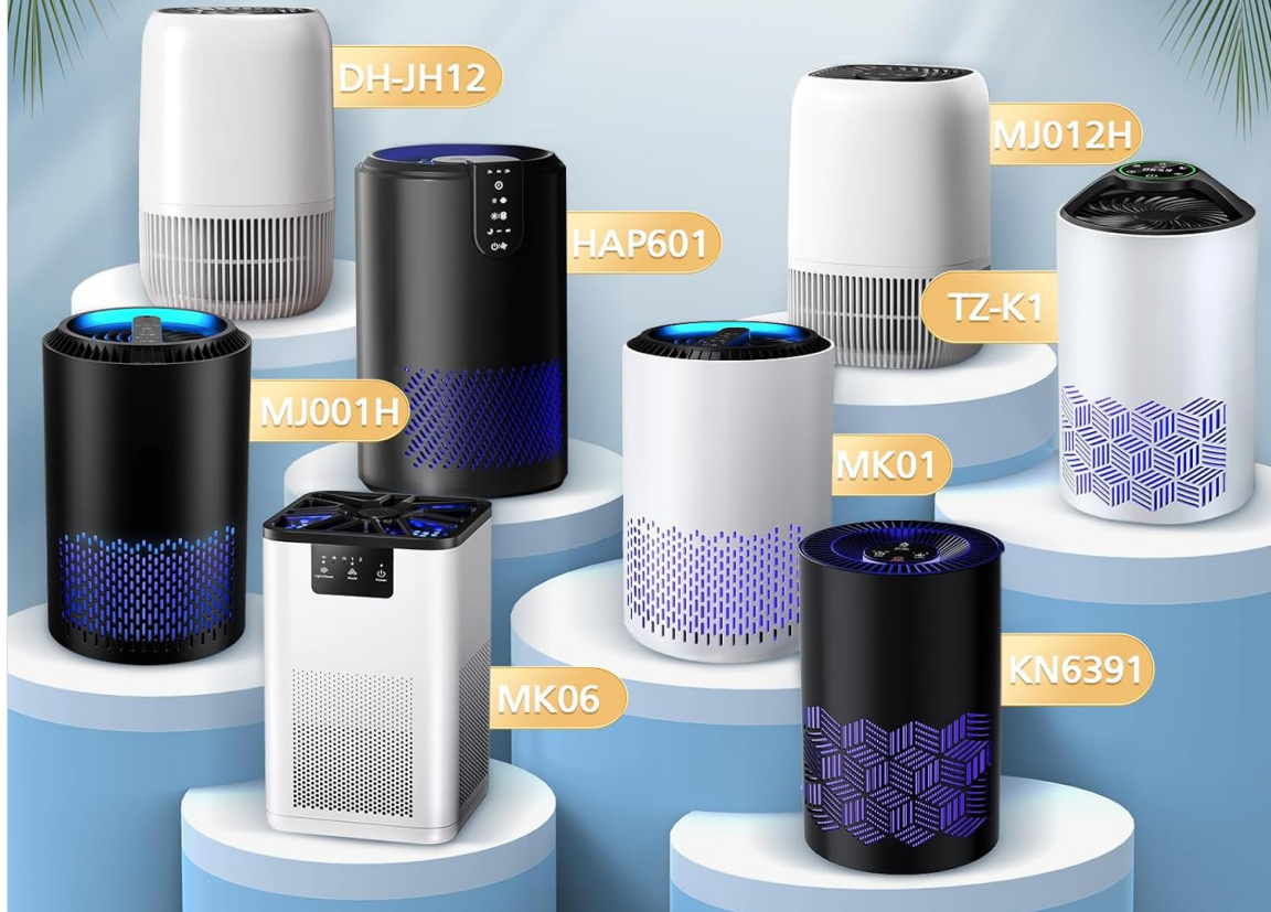
Figure 1: Visual representation of air purifier models compatible with JORAIR replacement filters.

Compatible with MK01, MK06, MG01JH, VOOPNU DH-JH12, ToLife TZ-K1, Kloudi DH-JH01, POMORON MJ001H, MJ012H, FreAire KN6391, HAP601, Intelabe EPI080/EP1080 and Elechomes EPI081/EP1081 Air Purifiers