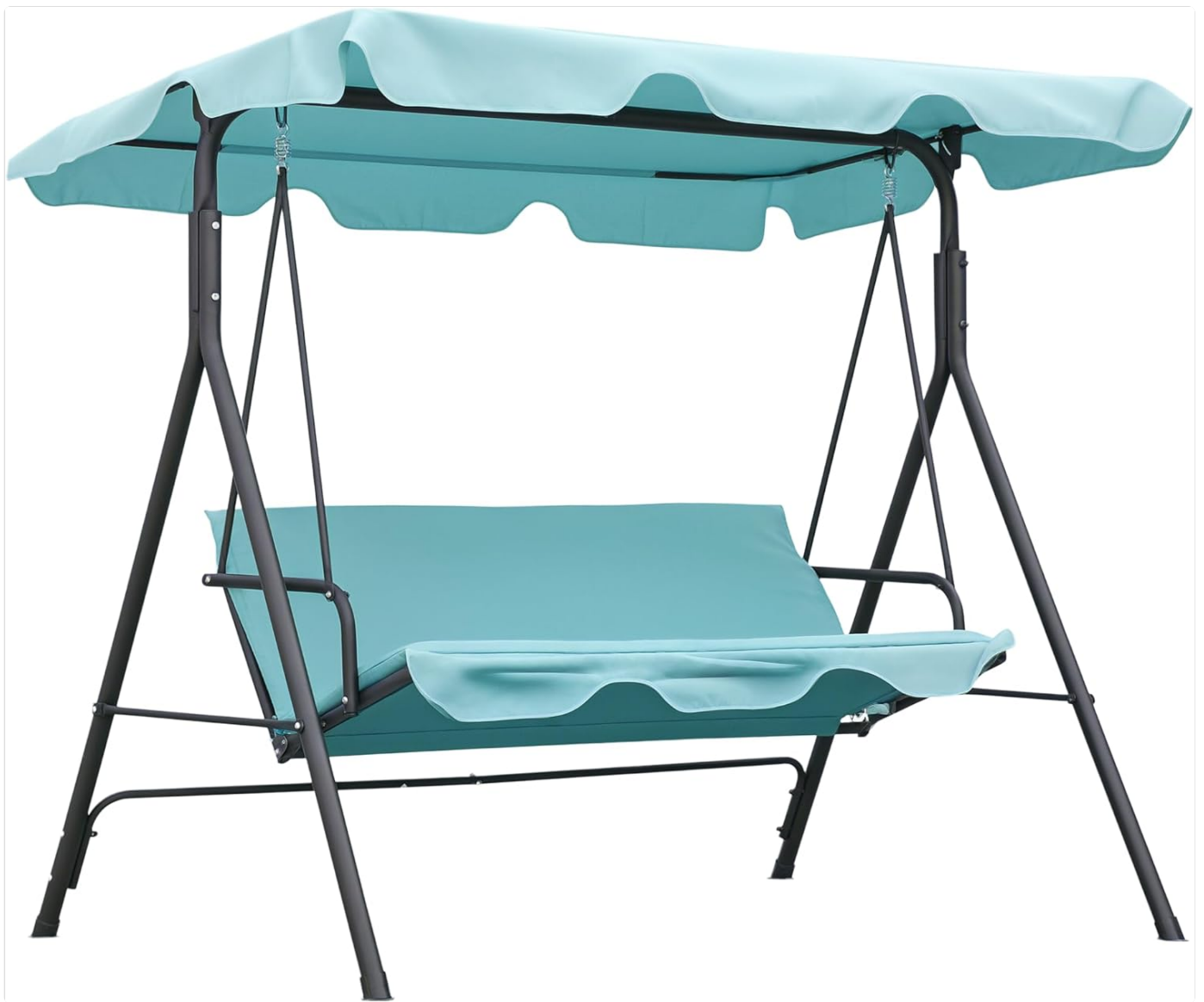
Image: The fully assembled Outsunny 3-Seat Outdoor Patio Swing Chair, showcasing its green canopy and seat, and sturdy steel frame.