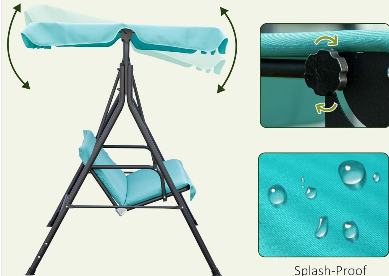
Image: A diagram illustrating the adjustable canopy feature, showing how the angle can be tilted and highlighting its splash-proof material.

The angle of the canopy can be easily adjusted to your needs