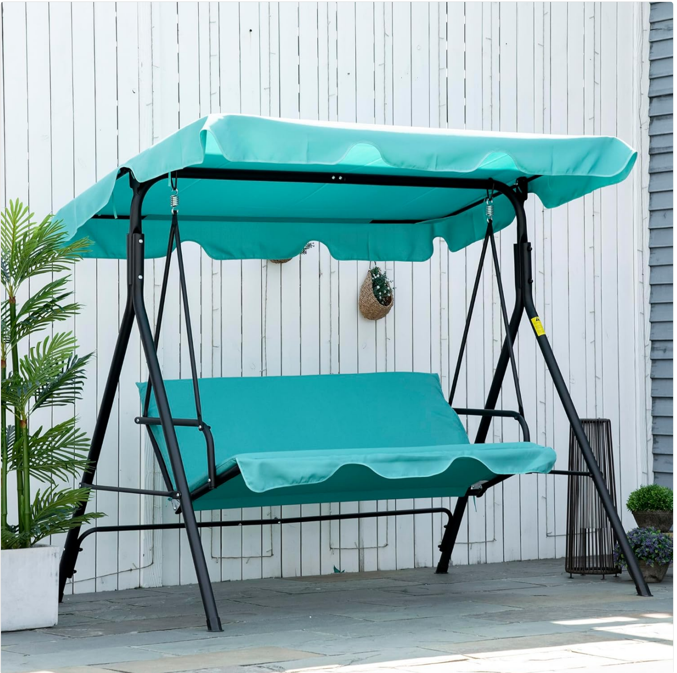
Image: The swing chair positioned on a patio, demonstrating its size and appearance in an outdoor environment.