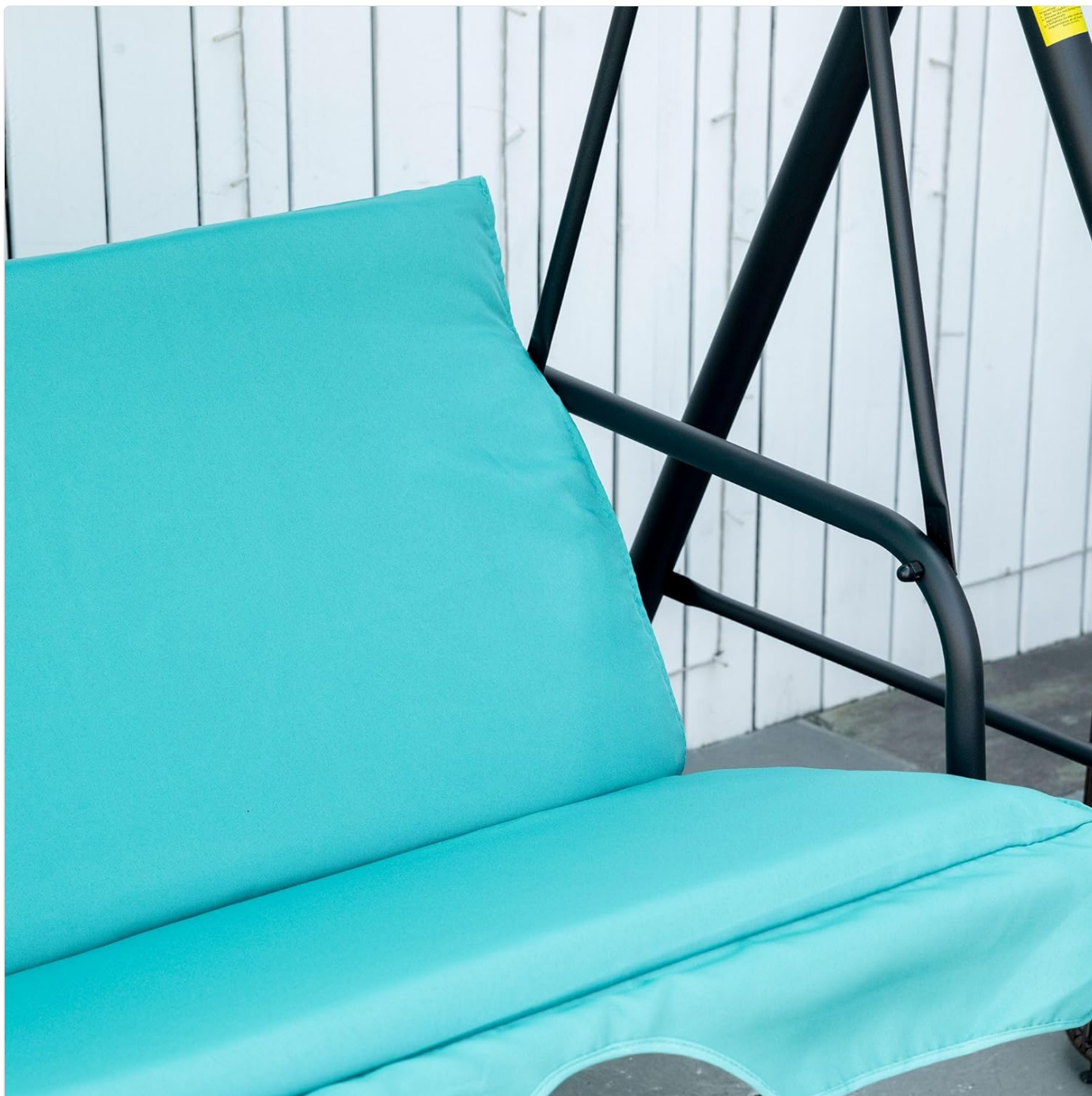
Image: A detailed view of the swing chair's comfortable cushioned seat and backrest, highlighting the fabric texture.