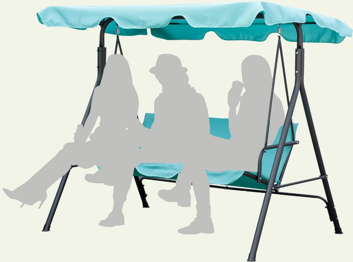
Image: An illustration demonstrating the 3-seater capacity of the swing, showing three individuals comfortably seated.