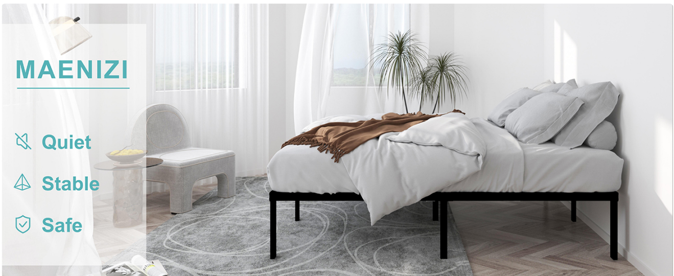
Image 1.1: The Maenizi Queen Size Metal Bed Frame, designed for quiet, stable, and safe use.

Thank you for choosing the Maenizi 14 Inch Queen Size Metal Bed Frame. This heavy-duty platform bed frame is designed for stability, durability, and ease of assembly, providing robust support for your mattress without the need for a box spring. Its intelligent integrated structure ensures a noise-free experience and offers ample under-bed storage space. This manual provides essential information for safe assembly, proper use, and maintenance of your new bed frame.