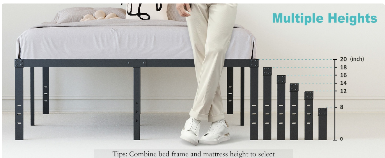
Image 5.2: The bed frame offers multiple height options (8 to 20 inches) to suit various mattress heights and preferences.