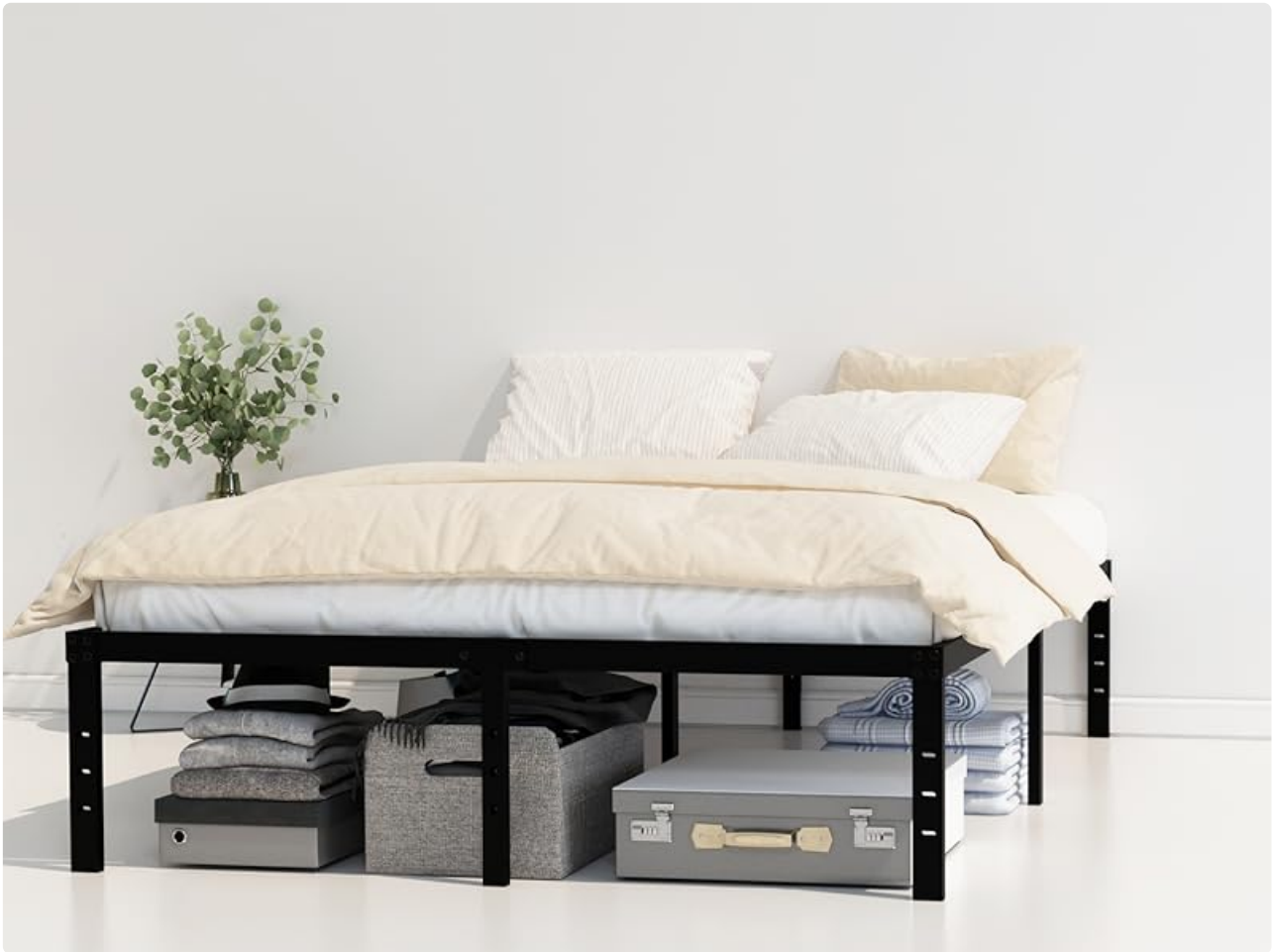
Image 5.1: The 14-inch clearance provides ample space for under-bed storage solutions.