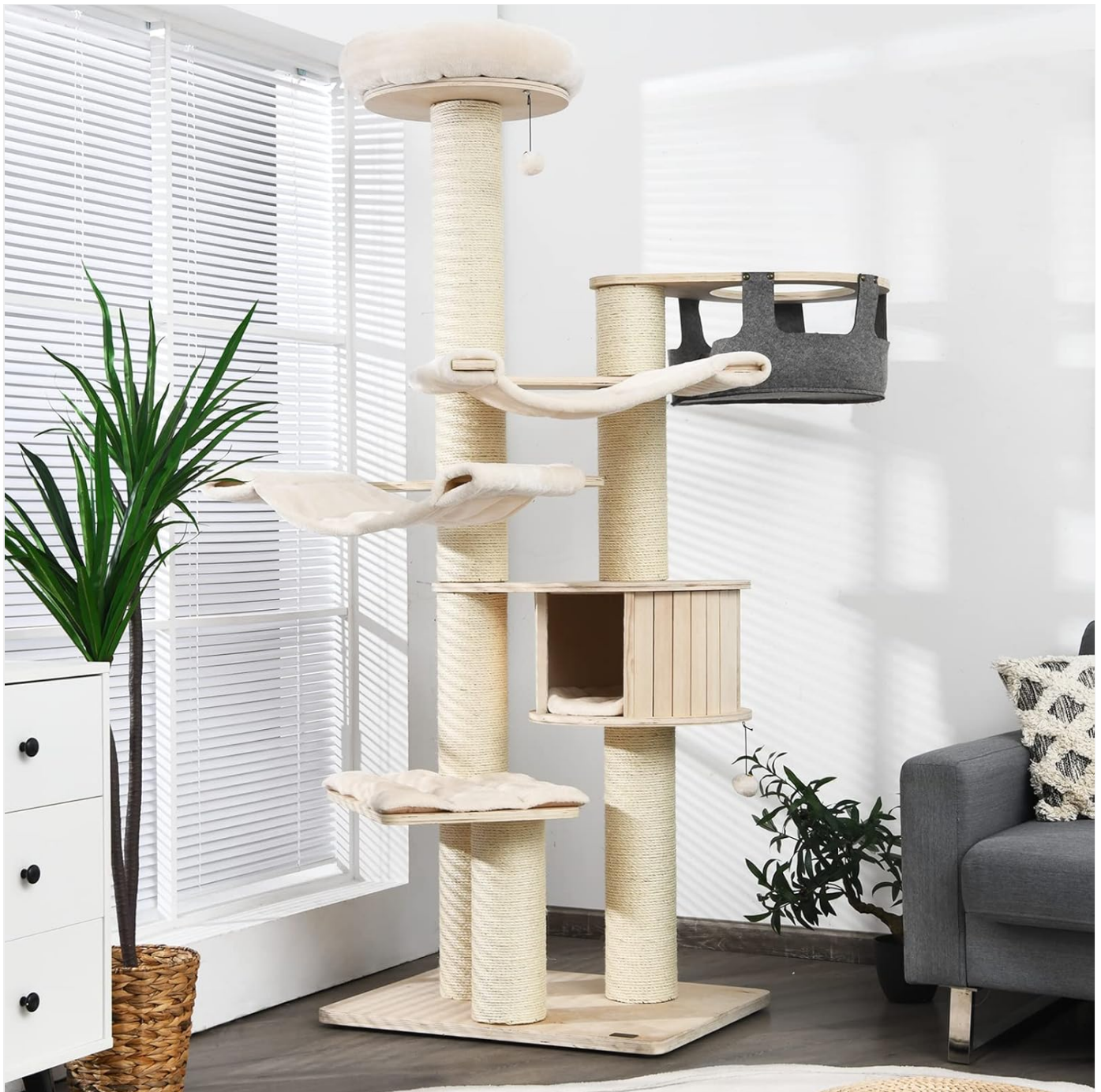
Image: The Tangkula Large Multi-Level Cat Tree, showcasing its various features and height.