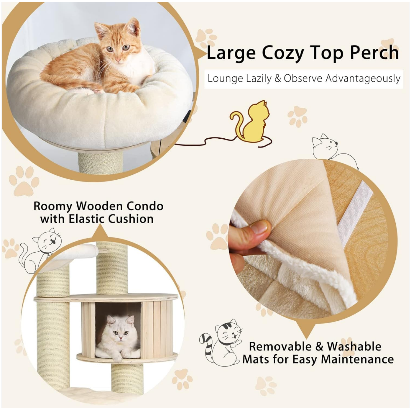
Image: The multi-layered design of the cat tree, highlighting its various levels and climbing opportunities.

Image: A visual guide demonstrating the assembly sequence of the cat tree.