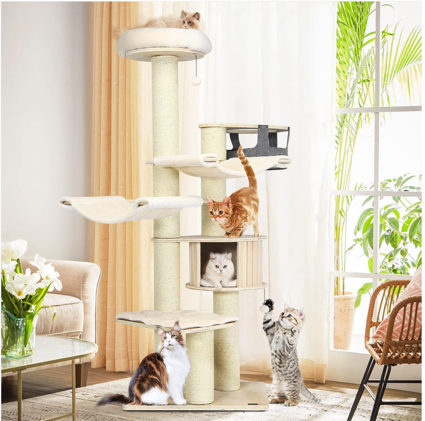
Image: Cats utilizing the various levels and features of the cat tree.