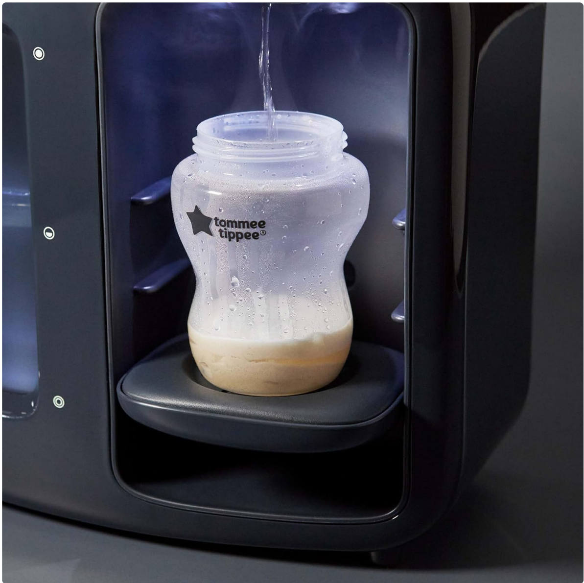
Image: Water being dispensed into a baby bottle, illustrating the "hot shot" phase where the initial hot water mixes with the formula powder.