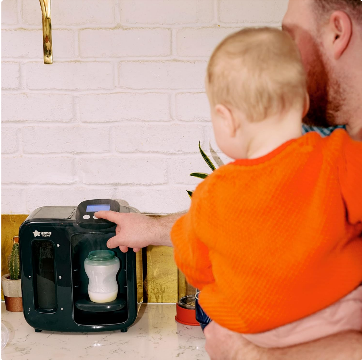
Image: A parent carefully positioning a baby bottle under the dispenser spout of the Perfect Prep machine, ready for formula preparation.