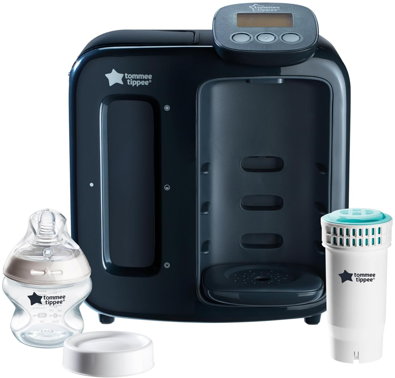
Image: The Tommee Tippee Perfect Prep Day & Night machine, shown with a baby bottle and a replacement water filter, highlighting its compact design and key components.