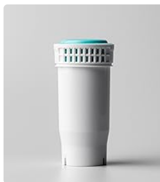
Image: A close-up of the antibacterial water filter, showing its design and the blue top indicating it's a genuine Tommee Tippee filter.