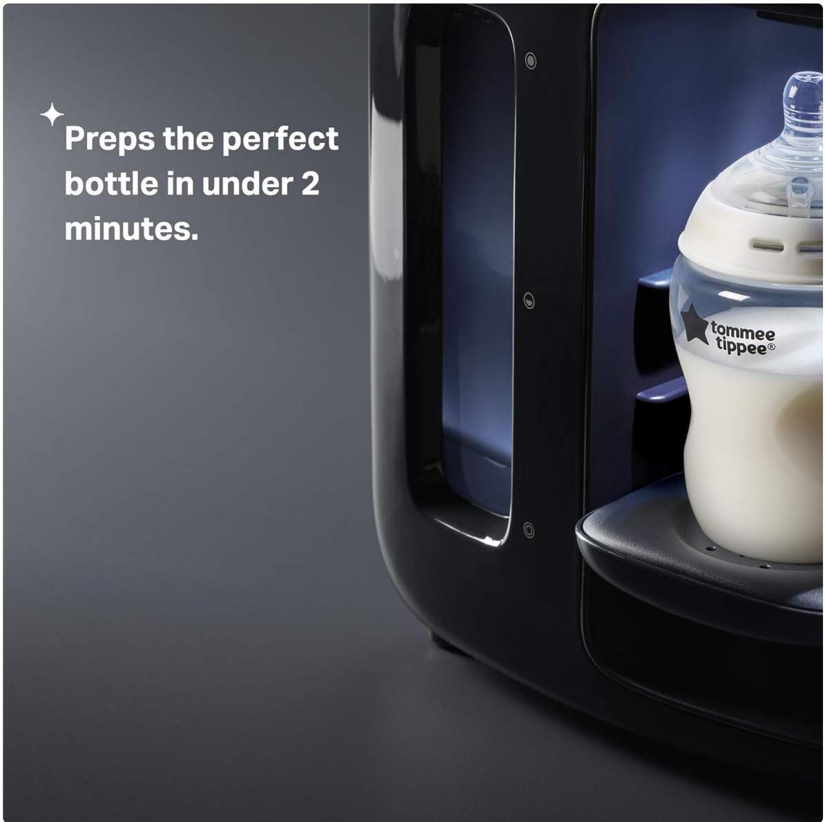
Image: A close-up view of a baby bottle inside the Perfect Prep machine, demonstrating the final stage of water dispensing to achieve the desired volume and temperature.

✦ Preps the perfect bottle in under 2 minutes.