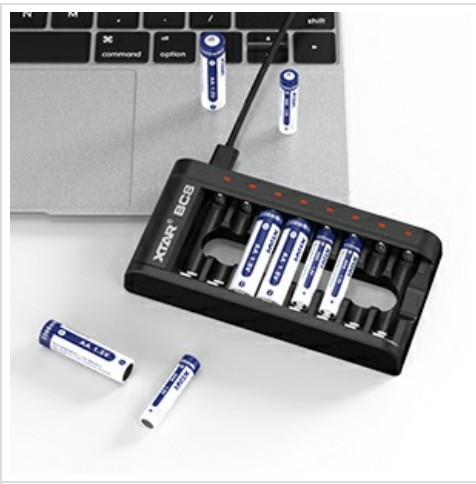
Image: XTAR BC8 charger, Type-C cable, and user manual included in the package.