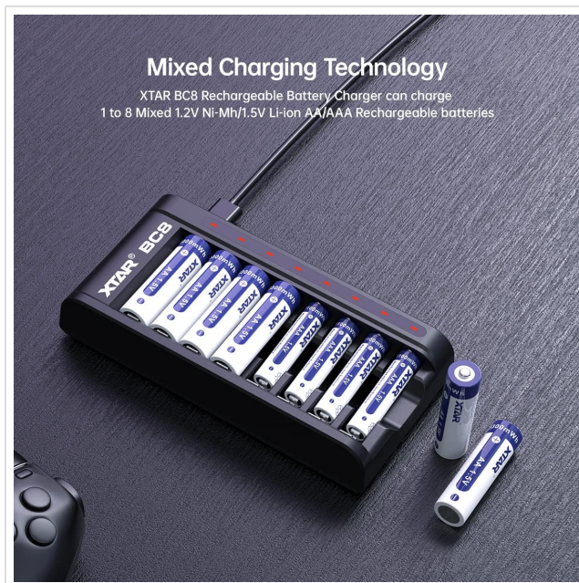
Image: Diagram showing the charging indicator lights (red for charging, green for charged/power on) and battery slot types (AA/AAA).

Image: The XTAR BC8 charger with various AA and AAA batteries inserted, demonstrating its mixed charging capability for compatible types.