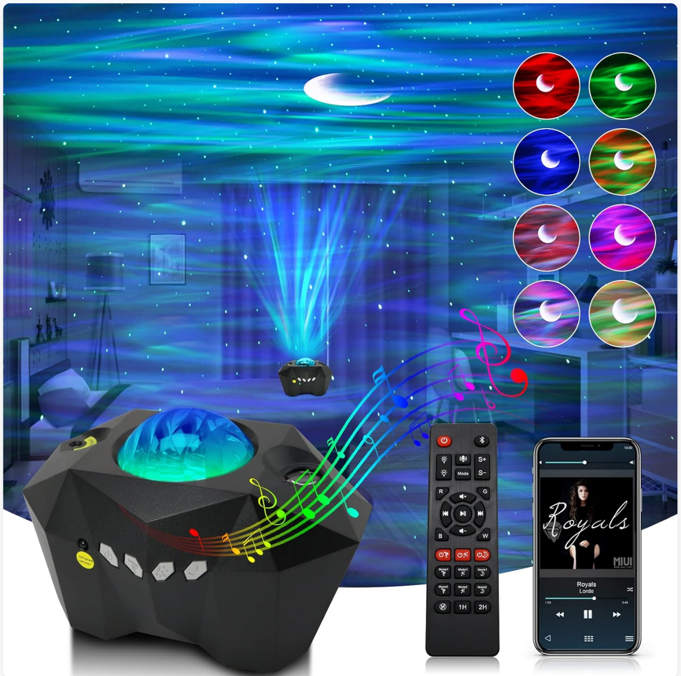
Figure 1.1: The Aurora Star Projector Night Light, showcasing its compact design, remote control, and Bluetooth music playback feature.