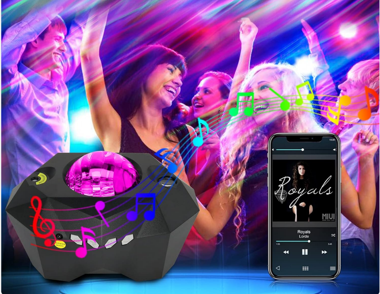
Figure 6.3: The projector's sound active control feature, allowing lights to sync with music or clapping.

Built-in high-quality speakers and microphones allow the projector lights to flash to the rhythm of music or clapping.