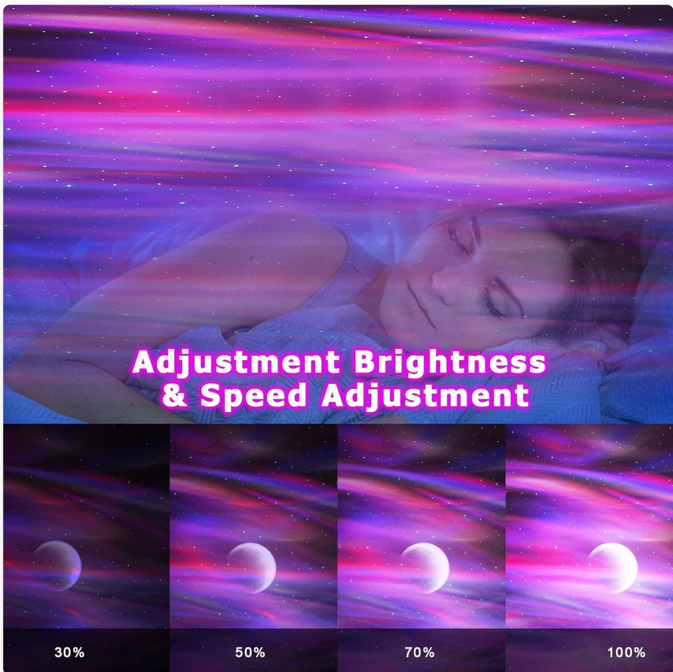
Figure 6.2: Visual representation of adjustable brightness levels for the projection.