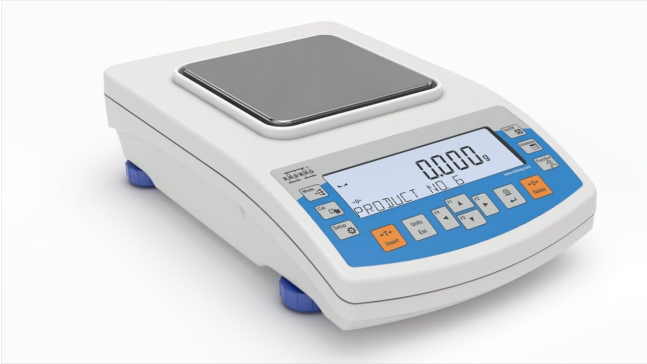
Figure 2: Angled view of the balance, highlighting its compact design and adjustable feet.