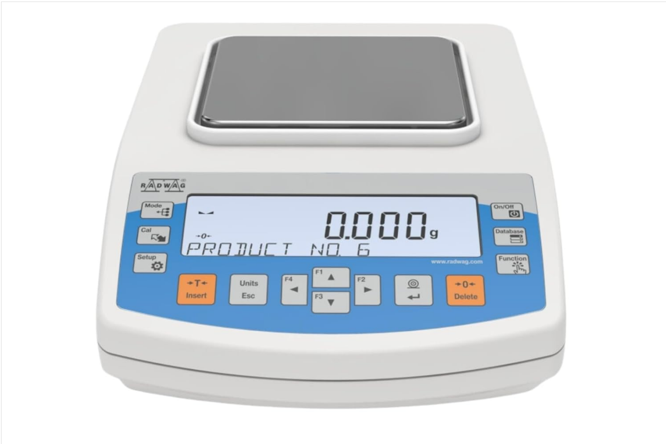
Figure 1: Front view of the Radwag PS 200/2000.R1 Precision Balance, showing the display and control panel.