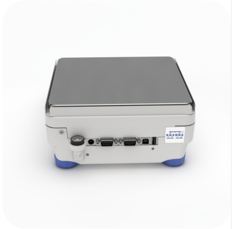
Figure 5: Illustration of key features including the plastic housing, stainless steel pan, and the under-pan weighing capability.

The balances have a possibility to weigh products out of the pan (under-pan weighing) - the load hangs under the pan.