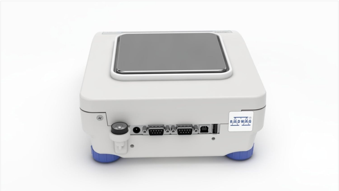
Figure 3: Rear view of the balance, illustrating the power input and communication ports (RS232, USB).