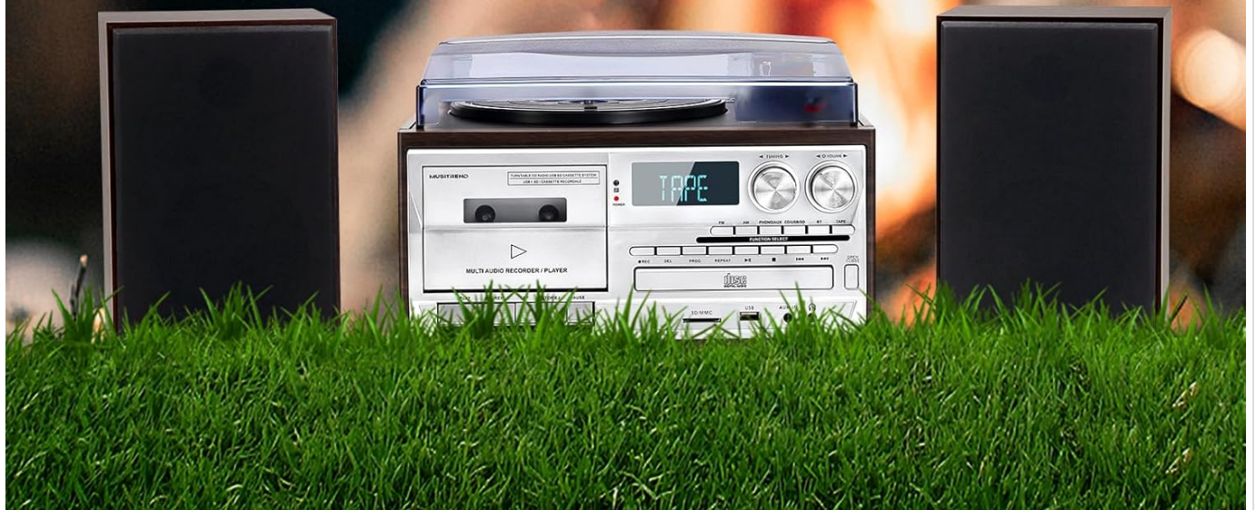
Image: An illustrative diagram highlighting the ten versatile functions of the record player, including vinyl, CD, cassette, SD/MMC, AM/FM radio, Bluetooth, headphone jack, remote control, USB, and Aux-in/RCA out.