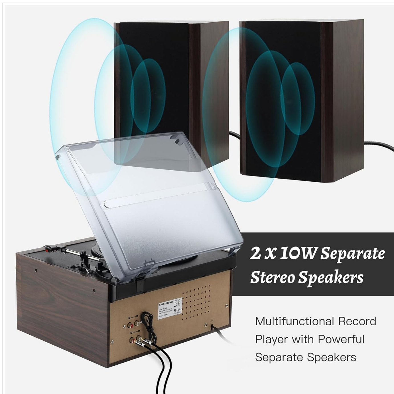
Image: The back of the record player unit with cables connecting to the two external speakers, illustrating the speaker setup.