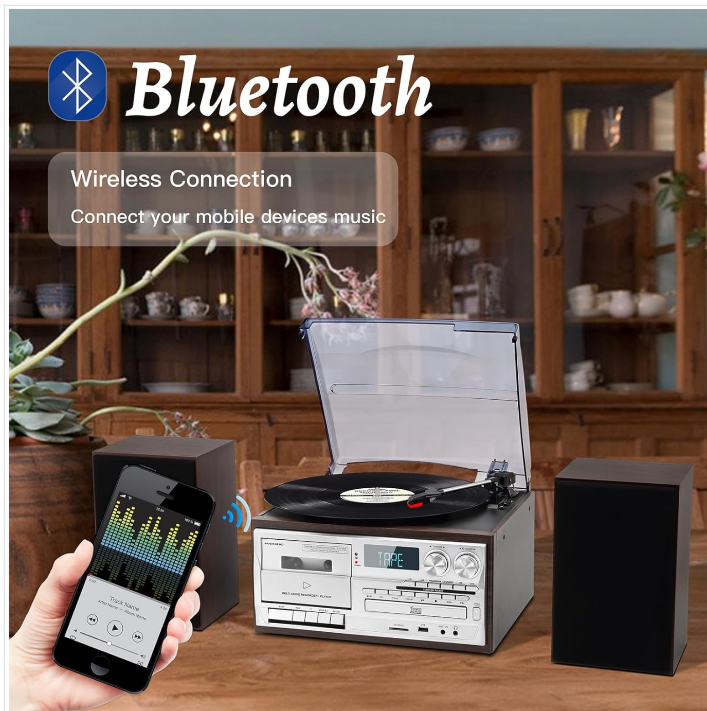
Image: Demonstrates wireless Bluetooth connection, allowing users to stream music from their mobile devices to the record player.