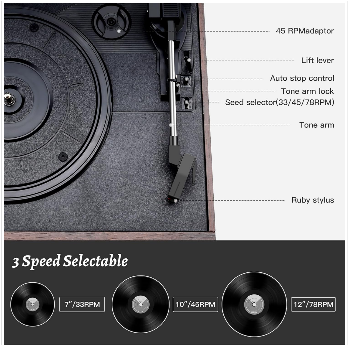
Image: Detailed view of the turntable's key components and a guide to selecting the correct speed for 7, 10, and 12-inch vinyl records.