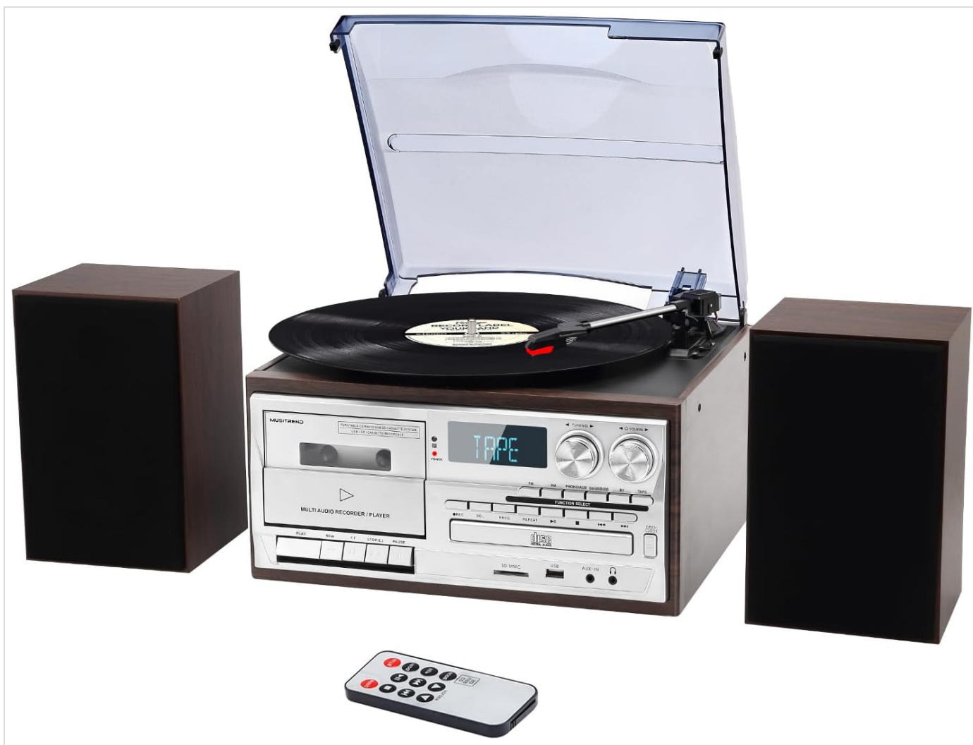
Image: The complete MUSITREND 10-in-1 Record Player system, showing the main unit, two external speakers, and the remote control.