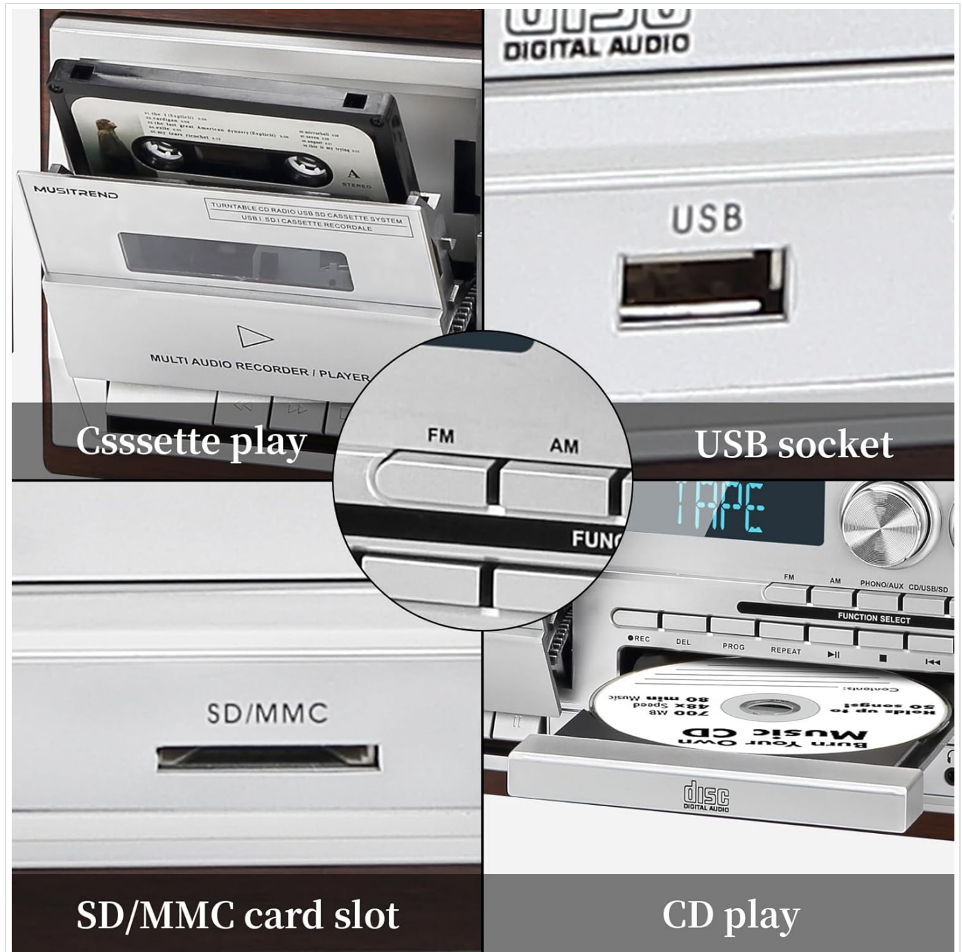
Image: A composite image detailing the cassette play mechanism, AM/FM radio controls, USB port, and CD player tray.