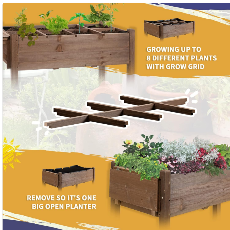
Image: An illustration demonstrating the eight individual grow grids within the planter, and how they can be removed to create one large, open planting space.

Insert the 8 grow grids into the planter box. These grids help separate different plants and manage their growth. They can also be removed if a single large planting area is desired.