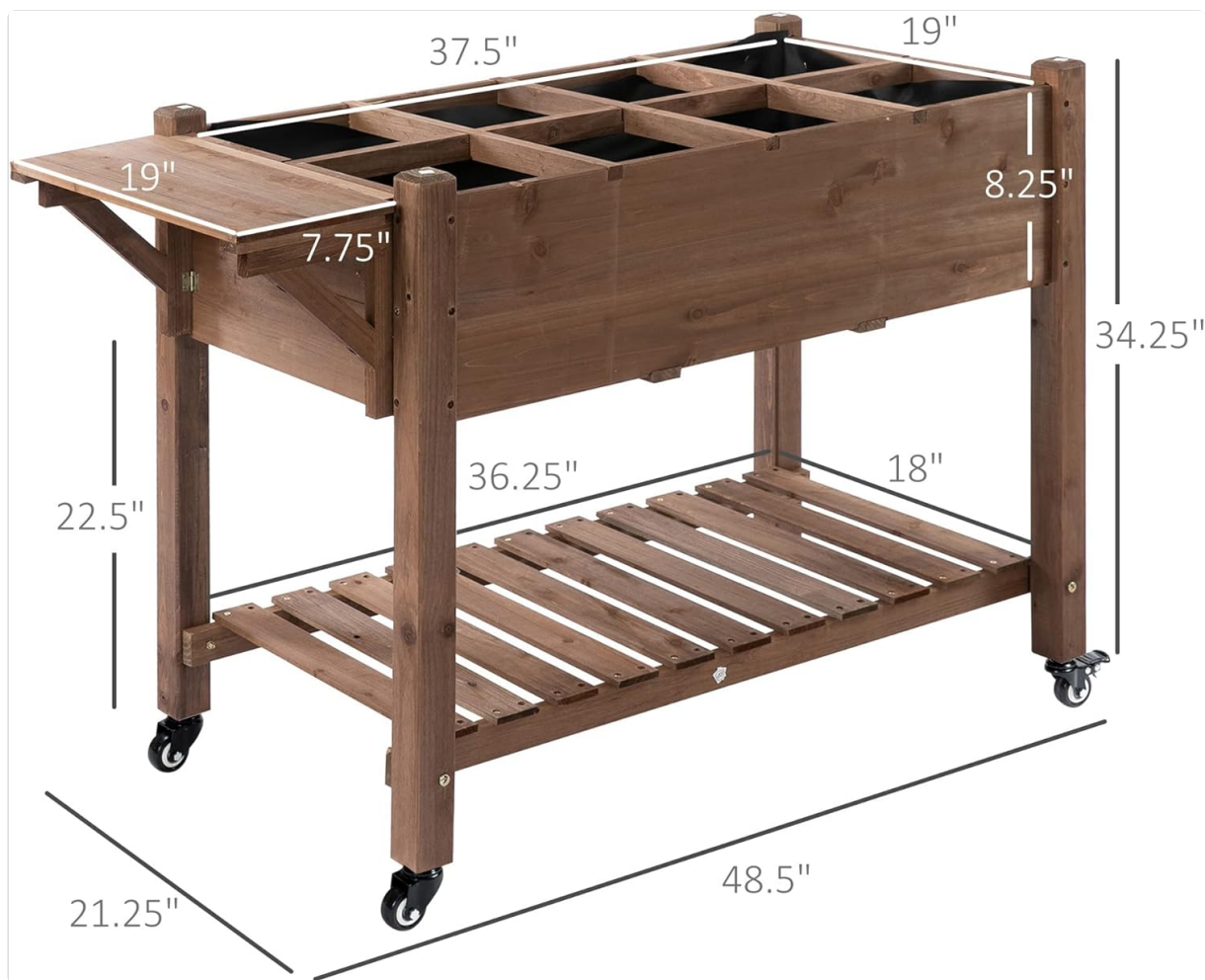
Image: A technical diagram illustrating the precise measurements of the raised garden bed, including its overall height, width, depth, and the dimensions of the planting area and bottom shelf.