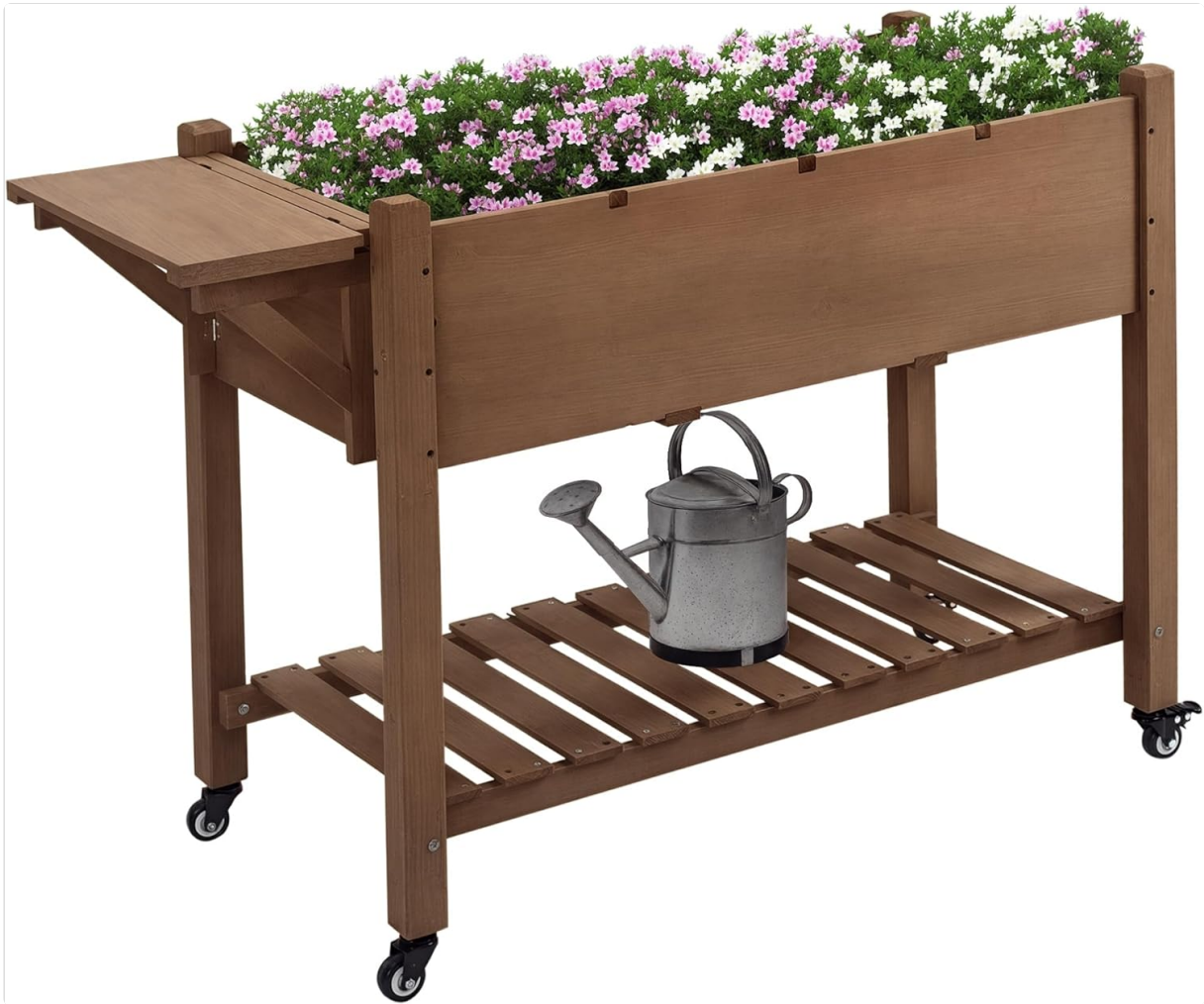
Image: The Outsunny Raised Garden Bed, showcasing its elevated design, bottom storage shelf, and integrated wheels. It is filled with various plants and flowers, with a watering can placed on the lower shelf.