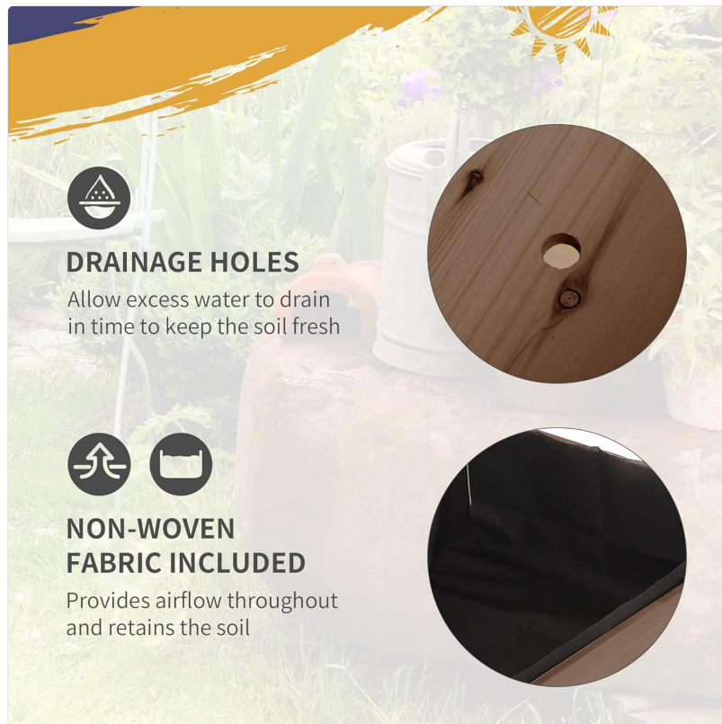
Image: A visual representation of the drainage hole at the bottom of the planter and the black non-woven fabric liner, which ensures proper drainage while keeping soil contained.

Place the non-woven fabric liner inside the planter box. This liner helps retain soil while allowing water to drain, protecting the wood.