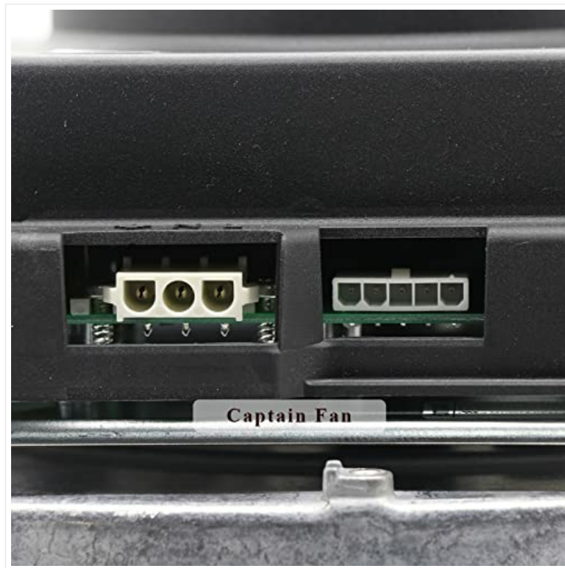
Figure 4: Detailed view of the electrical connectors on the fan unit.