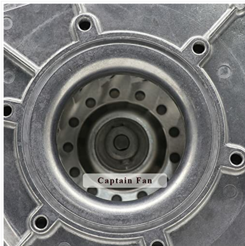
Figure 2: Close-up of the fan's intake, showing the impeller blades.