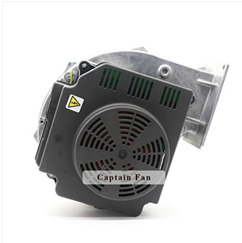
Figure 5: Side view illustrating the integrated motor and control electronics of the fan.